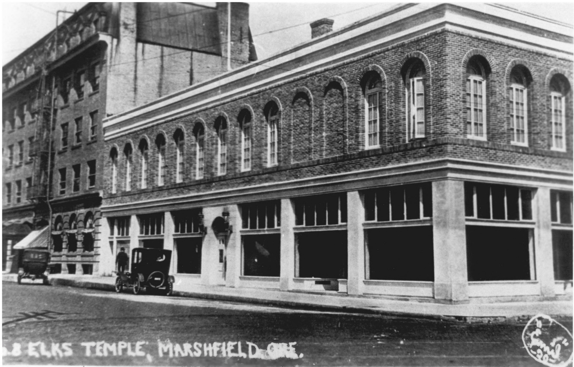
ELKS TEMPLE, MARSHFIELD, ORE.