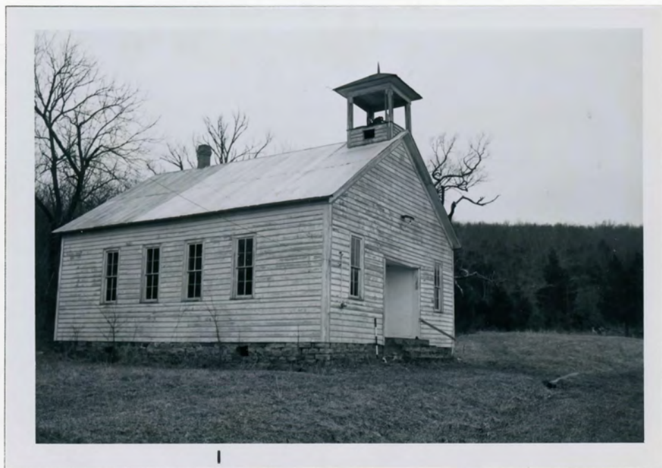
Historic Resources of Stone County West Richwoods Church & School, ST-124 West Richwoods 1983 Negative on file at the AHPP Viewed from the southeast