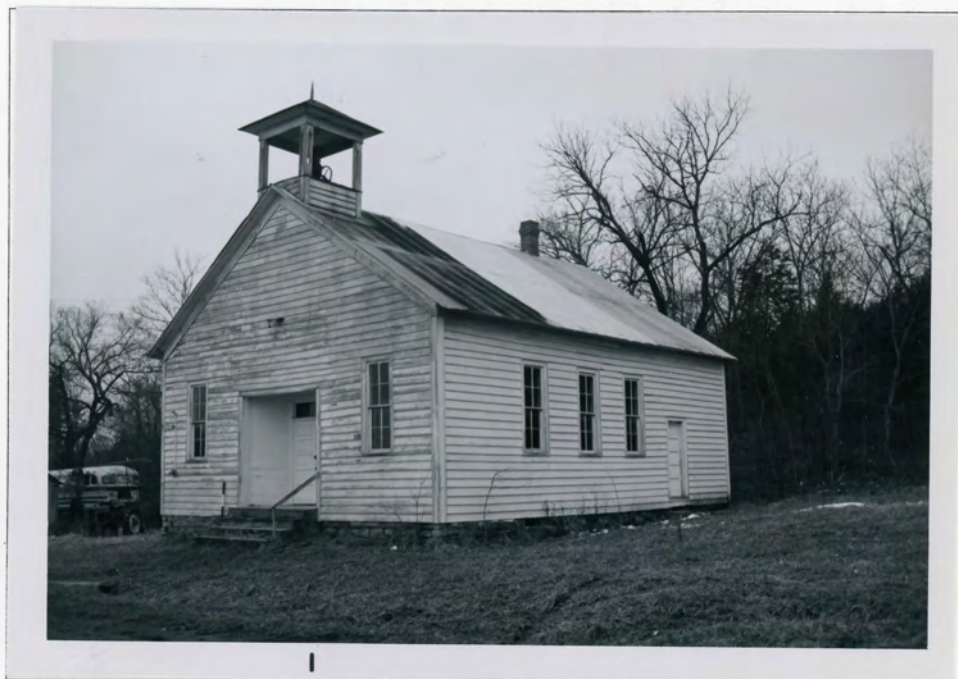
Historic Resources of Stone County West Richwoods Church & School, ST-124 West Richwoods 1983 Negative on file at the AHPP Viewed from the northeast