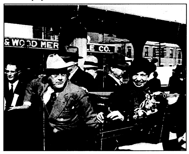
President Franklin Roosevelt and First Lady, Eleanor, soon after arriving at Union Station in 1936. From the Wichita Public Library Local History Section, wpl_wpl60.

18, 1935, and dust storms still affected the city in 1937.<sup>30</sup> Thus federal support for Wichita's economy through New Deal programs increased even more in the latter half of the thirties. In 1934, over $25 million was spent on relief in Sedgwick County. By 1935 relief programs in Wichita, with over sixty case workers hired to handle the paperwork, were a major part of the economy. It was estimated 25,000 people in Sedgwick County were dependent on these programs, approximately one quarter of the county's population. When the WPA became active in 1935, the amount of federal involvement in the local economy grew even more. Between 1935 and 1940, this one agency alone spent $8,500,000 in Wichita and at one time employed 3,000 local people.<sup>31</sup> Wichita's population began to rise again, albeit slowly. One theory for this might be the exodus of families from the surrounding agricultural region into the city in hopes of obtaining work, either through private employment but more likely through one of the many large New Deal work-relief projects in Wichita.