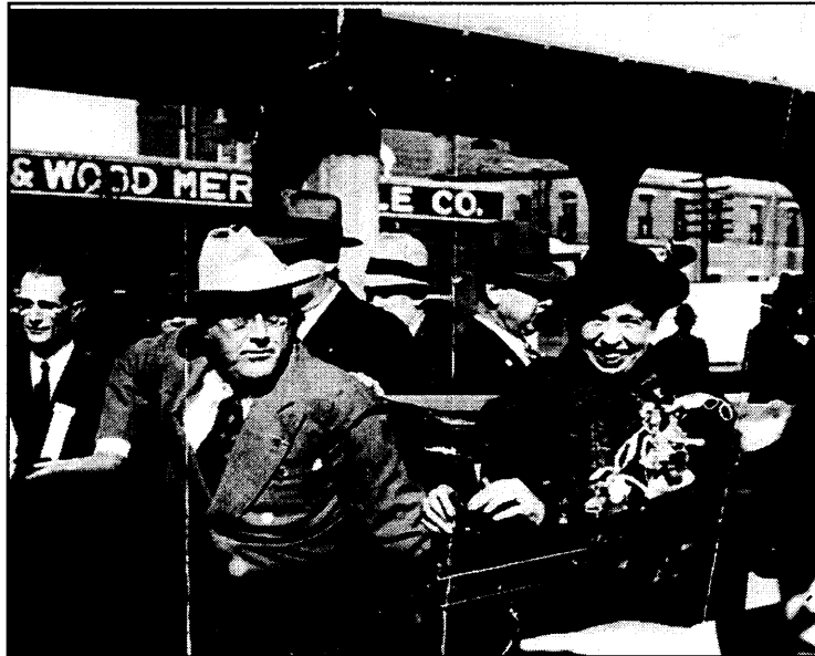
President Franklin Roosevelt and First Lady, Eleanor, soon after arriving at Union Station in 1936.

18, 1935, and dust storms still affected the city in 1937. 30 Thus federal support for Wichita's economy through New Deal programs increased even more in the latter half of the thirties. In 1934, over $25 million was spent on relief in Sedgwick County. By 1935 relief programs in Wichita, with over sixty case workers hired to handle the paperwork, were a major part of the economy. It was estimated 25,000 people in Sedgwick County were dependent on these programs, approximately one quarter of the county's population. When the WPA became active in 1935, the amount of federal involvement in the local economy grew even more. Between 1935 and 1940, this one agency alone spent $8,500,000 in Wichita and at one time employed 3,000 local people. 31 Wichita's population began to rise again, albeit slowly. One theory for this might be the exodus of families from the surrounding agricultural region into the city in hopes of obtaining work, either through private employment but more likely through one of the many large New Deal work-relief projects in Wichita.