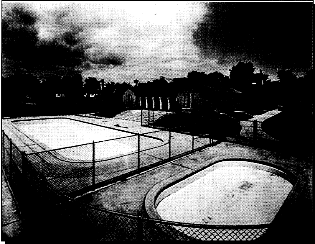
College Hill Park Pool and Bathhouse in 1937.

College Hill Park Bathhouse Sedgwick County, Kansas