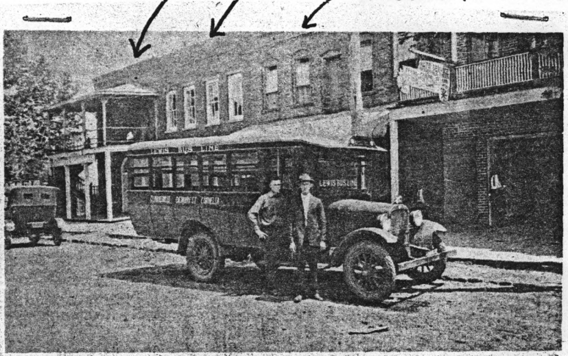
The J.A. Lewis Bus ran on a regular schedule between Clarkesville and Cornelia in 1924, with stops along the way.

MOULDERG CARGON PHARMACY JACKGON BLOG. No. 13 Pg.