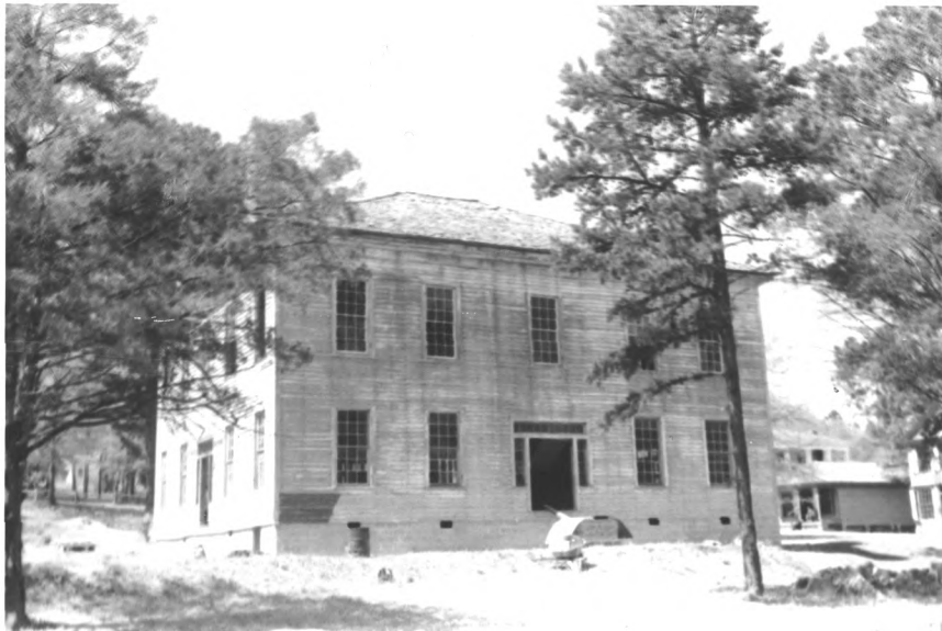
CHATTAHOOCHEE COUNTY COURTHOUSE

Originally, the Chattahoochee courthouse was in Cusseta, but when faced with demolition, it was dismantled and moved to Westville, a model village of the 1850's. Boards were numbered before dismantling and great care has been taken in the rebuilding. The attic trusses, the 52' ceiling beam, the pegged construction and the patina of old pine remains. If this building had not been moved to Westville, 35 miles from its original site, it would have been destroyed. As it is, students of all ages can visit and study the fine old building.