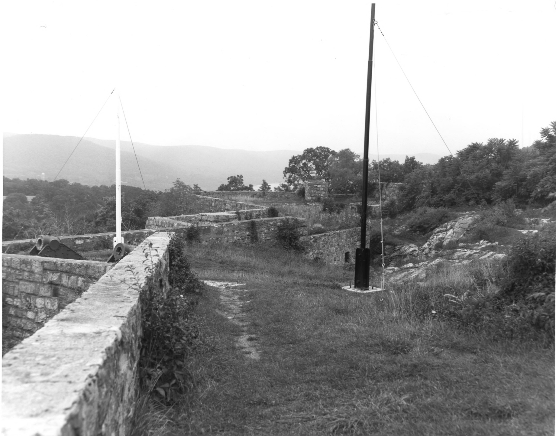
Fort Putnam (Reconstructed), looking south. West Point, New York.