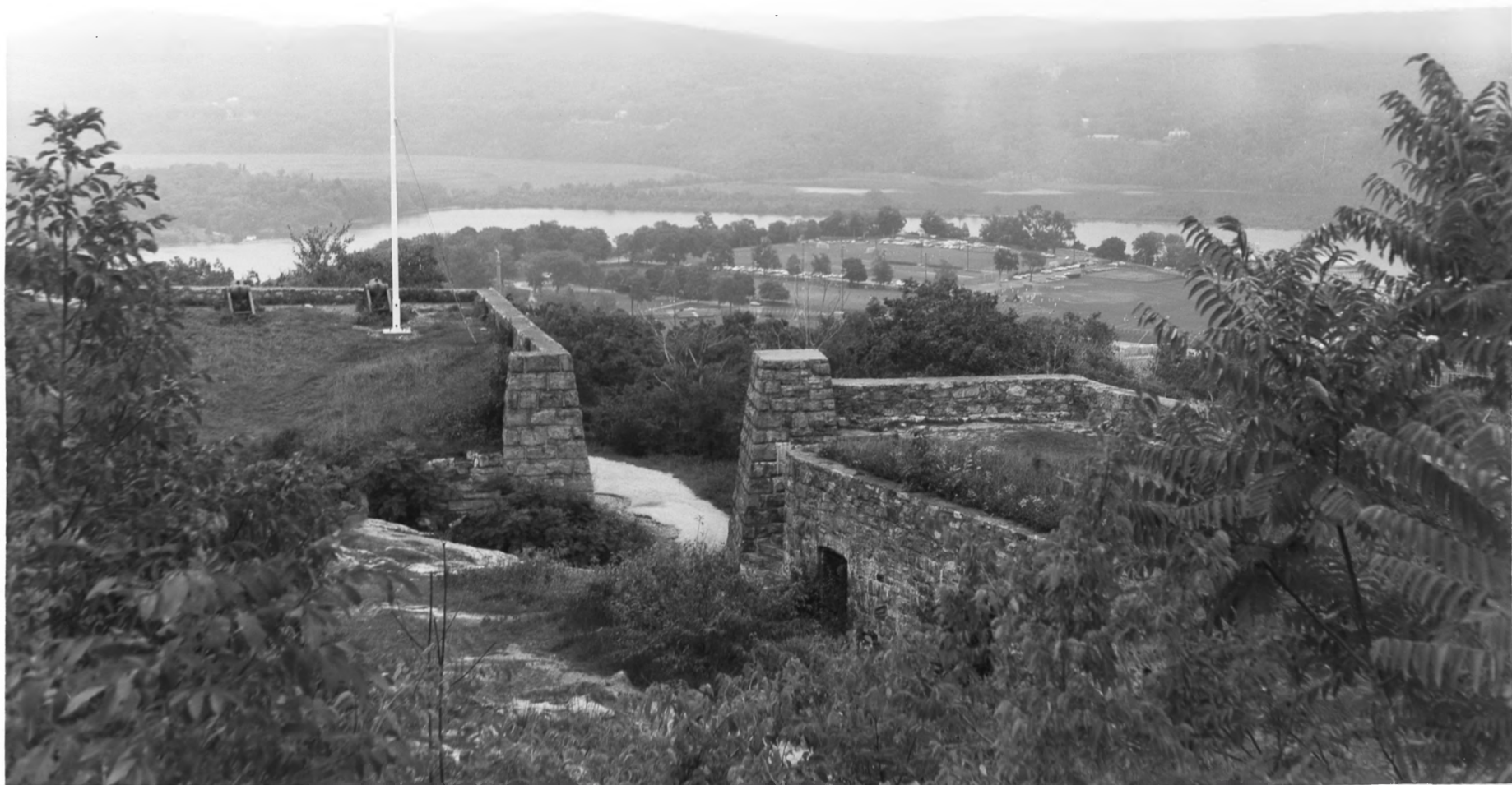
Fort Putnam (Reconstructed), looking east. West Point, New York.