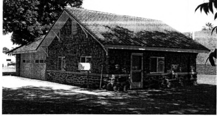
Link Colvin House

Of the five stone houses identified, the Link Colvin House and the Dowdy Rental Cottage exhibit the highest degree of workmanship and design. The other examples are typically more crudely built, particularly the latest example. The George O. Dowdy Rental Cottage is thus a significant example of cobblestone construction for its rarity and quality.