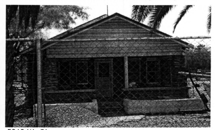
5313 W. Glenn

After World War II, and particularly by the mid-fifties, concrete block became the most widely-used and inexpensive method of construction across the Salt River Valley, including Glendale. By that era, Glendale started to become more of a suburb of Phoenix than a town unto itself - with the resulting homoginzation of architectural styles and construction methodologies with its larger cousin. With the advent of tract housing and mass-production homebuilding, hand-built house techniques like adobe and stone virtually disappeared, to resurface in later years as veneer or in high-end custom homes.