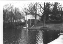
Building #3 1255 East Saddle River Road ice house, looking NE across pond. neg. file # 19844-3 slide