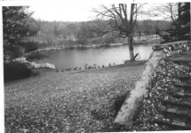
Wandell Estate and Ward Factory Site, 255-261 East Saddle River Road Saddle River

Pond which is part of Saddle River 255 East Saddle River Road Looking NW neg. file # 19844-2