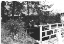
Structure #2 boulder bridge, 255 East Saddle River Road Looking SE neg. file # 19844-4 slide

Pond which is part of Saddle River 255 East Saddle River Road Looking NW neg. file # 19844-2