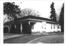
PHOTO Negative File No. 19844-1 Building #1, slide Map (Indicate North)

Additional Architectural Description: Wraparound columnar porch on 3 and W, bay window on east, additions to north. House faces S. Building #7 (261): appears mid 19th c., according to tradition built in 1810, vernacular style; ls. boulder foundation as building moved c. 1900; clapboard; 5 bays on 1st story, 6/6; gable roof; 5 bay porch, 3 front (E) wall dormers, doorway with heavy architrave-trim and door with cast-iron grills.