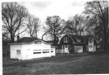
Wandell Estate and Ward Factory Site 255-261 East Saddle River Road Saddle River

Building #5, carriage house 255 East Saddle River Road and building #6, 261 East Saddle River Rd., barn. Looking N. neg. file # 29844-5 slide.