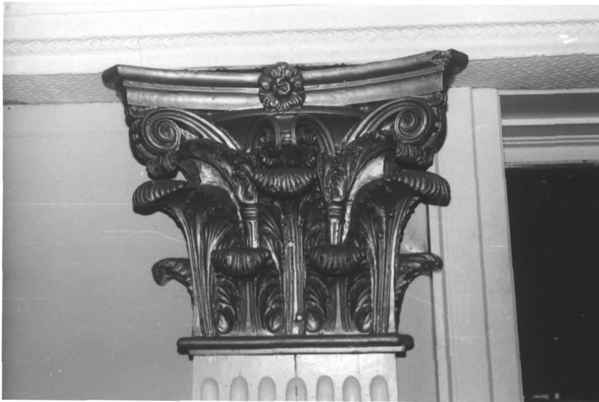
COURTROOM DETAIL - CAPITAL