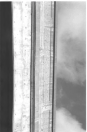
West Washington Street Bridge, Delaware Co., PA 00