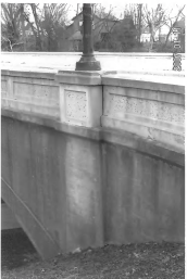
West Washington Street Bridge, Delaware Co., PA 01