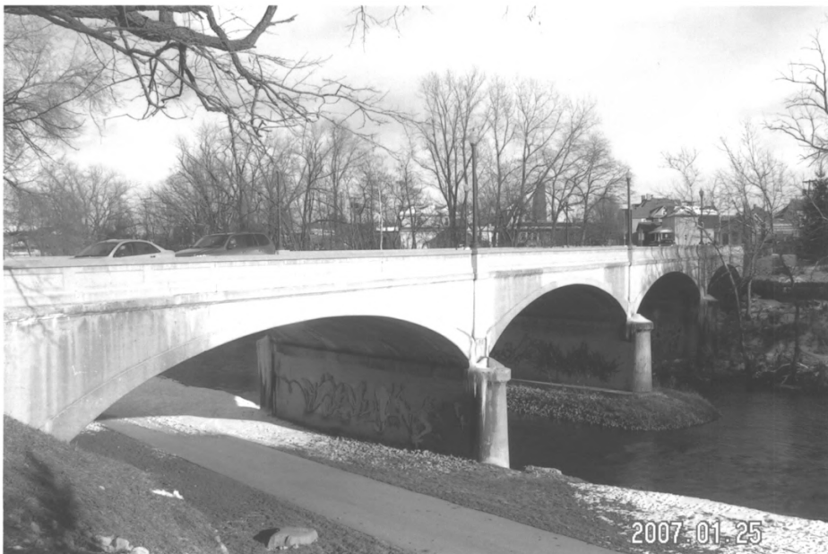
West Washington Street Bridge, Delaware Co., IN #2