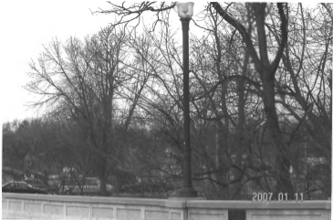
West Washington Street Bridge, Delaware Co., IN #9