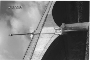
West Washington Street Bridge, Delaware Co., IN #10