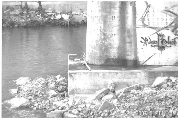
West Washington Street Bridge, Delaware Co., IN #5