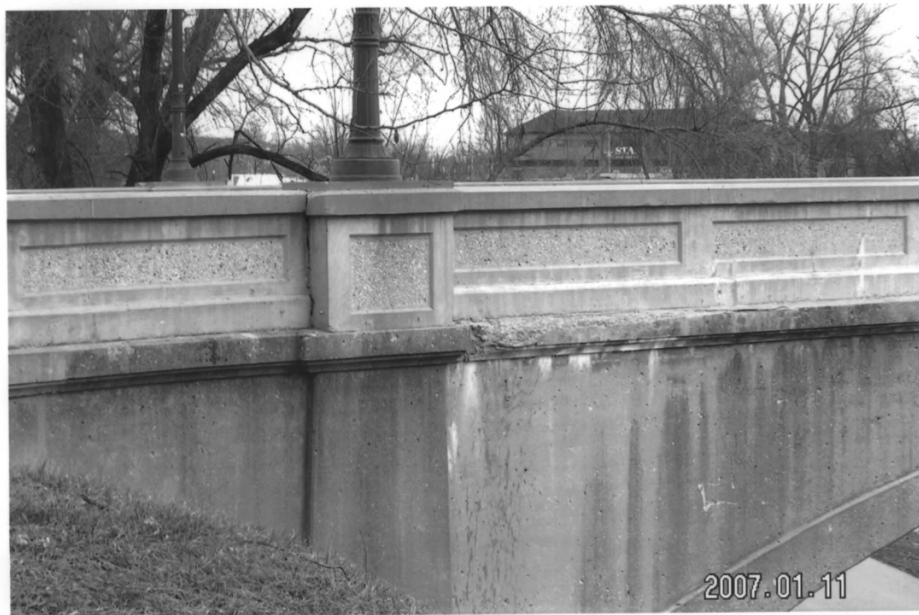
WEST WASHINGTON ST. BRIDGE, DELAWARE Co., IN # 11