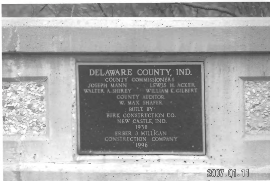
WEST WASHINGTON ST. BRIDGE, DELAWARE Co., IN #13