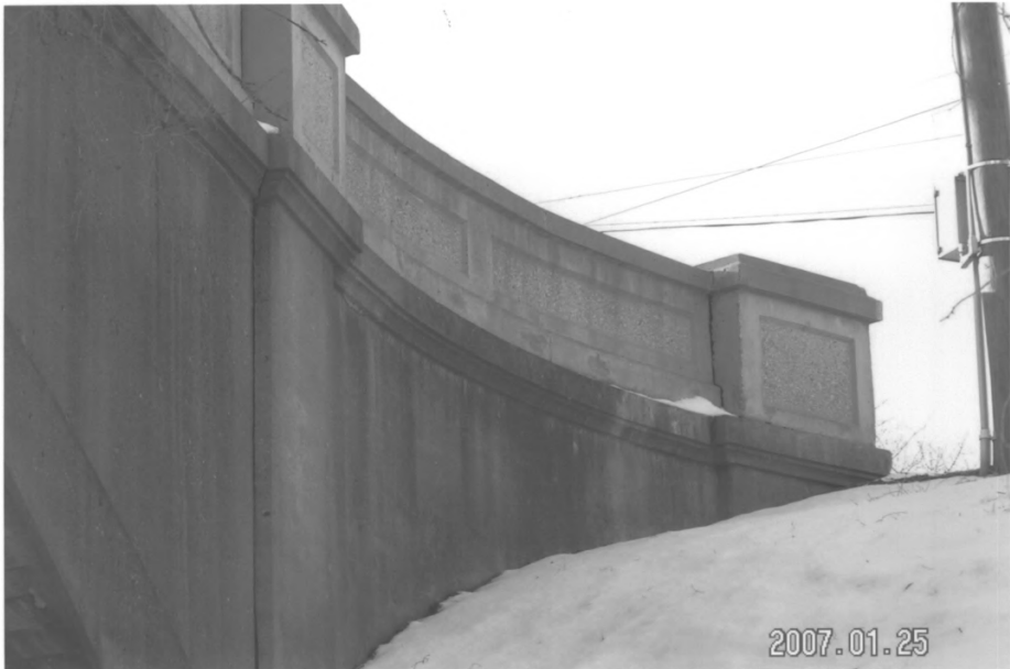
West Washington Street Bridge, Delaware Co., IN #17