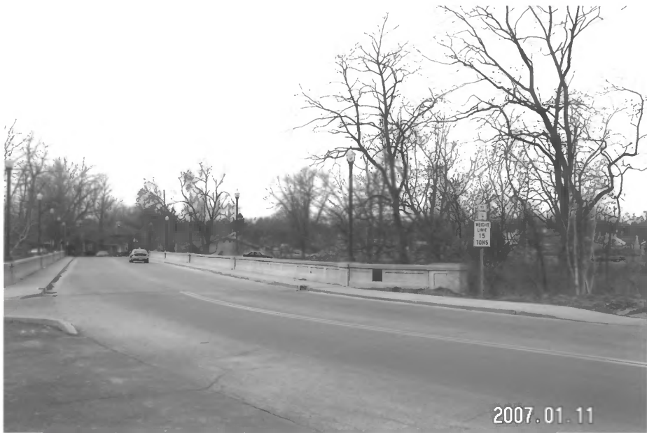
West Washington Street Bridge, Delaware Co., IN #1