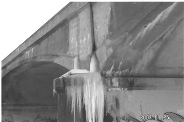
West Washington Street Bridge, Delaware Co., IN #6