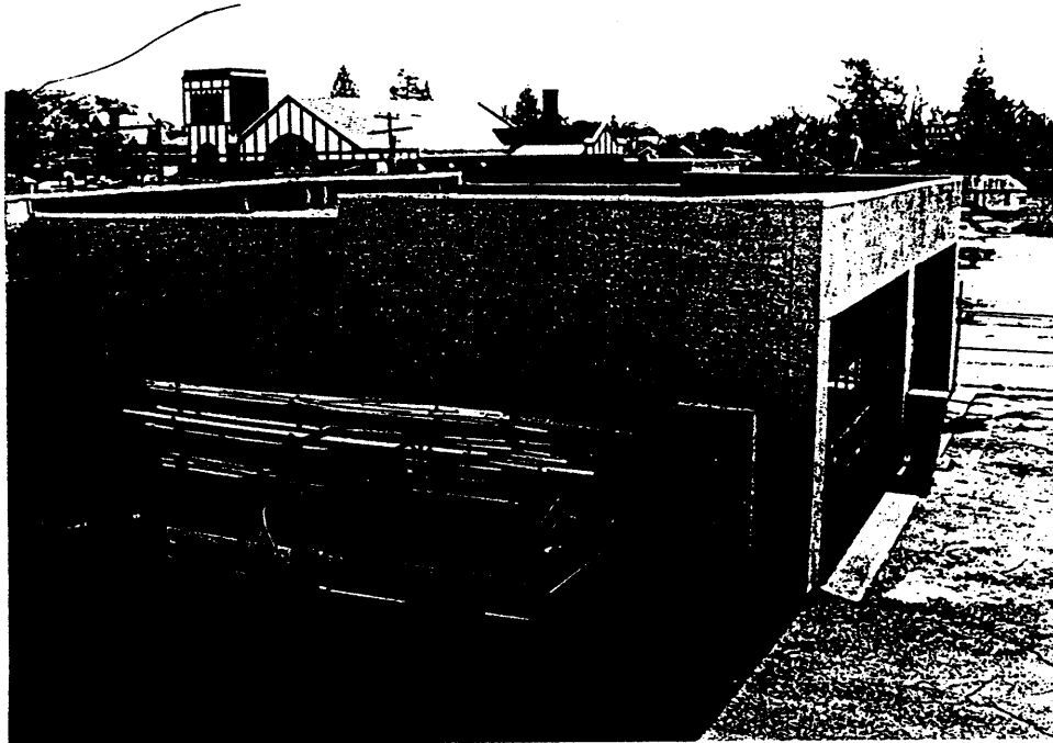
PHOTO DISPLAYS OVERHEAD TRUCK DOOR LOCATED IN THE CONCRETE BLOCK SHOP BUILDING

PHOTO DISPLAYS THE DETACHED CONCRETE BLOCK SHOP BUILDING LOCATED ON THE SUBJECT PROPERTY NOTE FUEL DISTRIBUTION PUMP