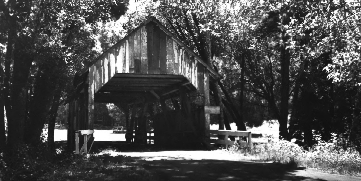
THE OLD COVERED BRIDGE SANTA CRUZ COUNTY CALIFORNIA