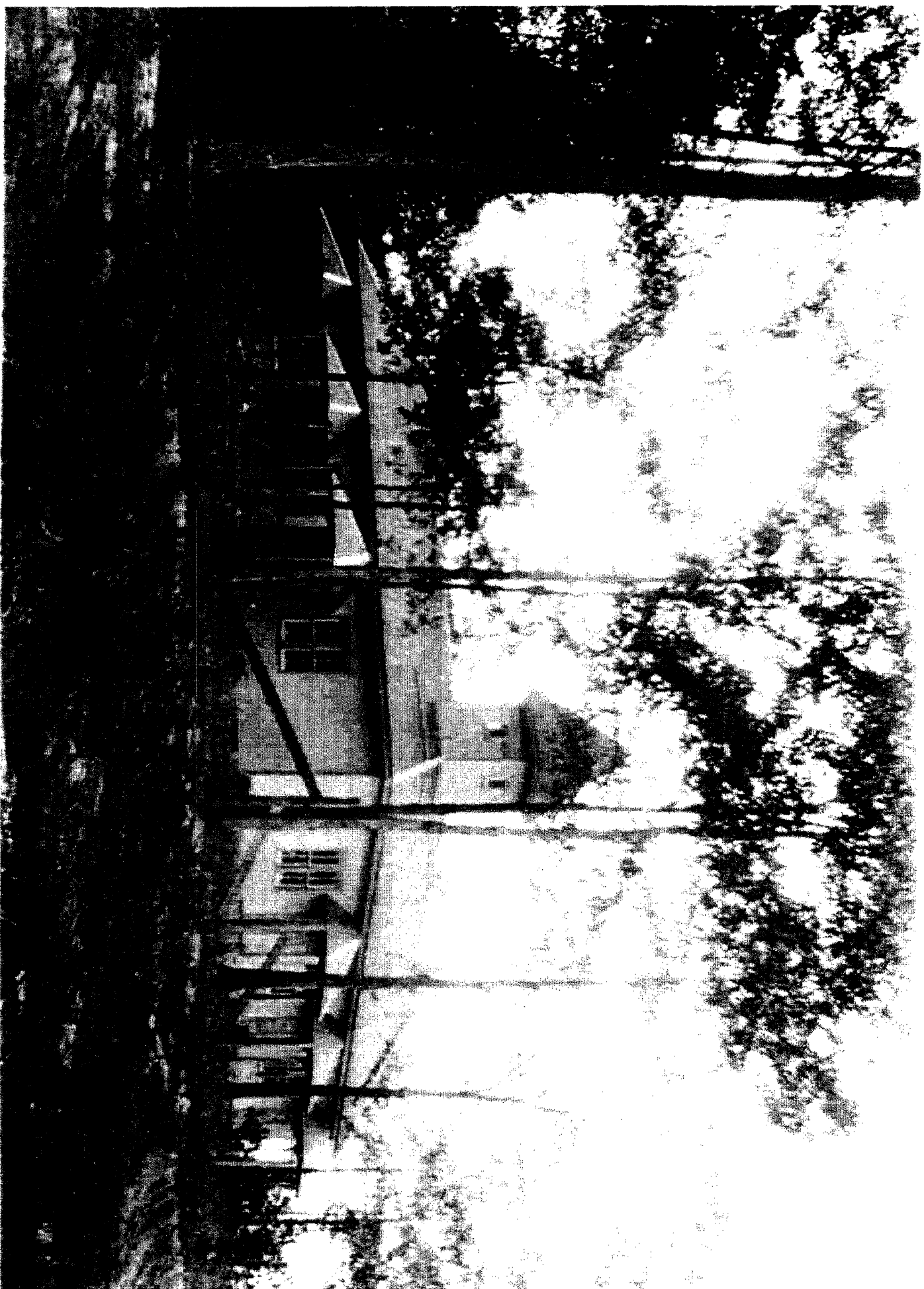
HUNGARIAN SETTLEMENT SCHOOL

School as it appeared in Springfield before being moved to Hungarian Settlement in 1928. Note: Belfry not moved.