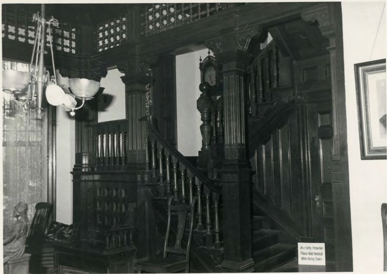
As a Safety Precaution Please Hold Handrail When Using Stairs