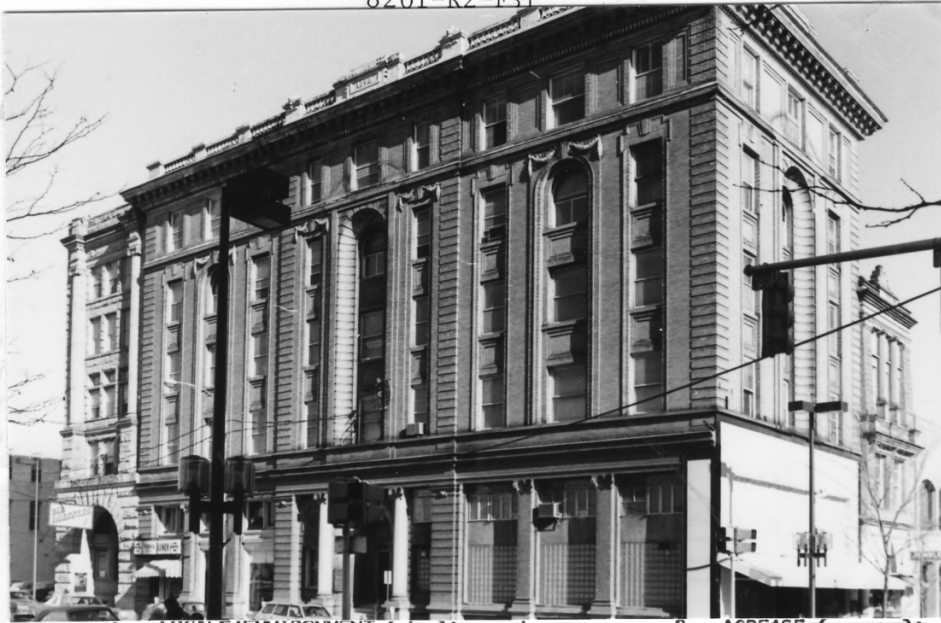
6. LOCALE/ENVIRONMENT (map):