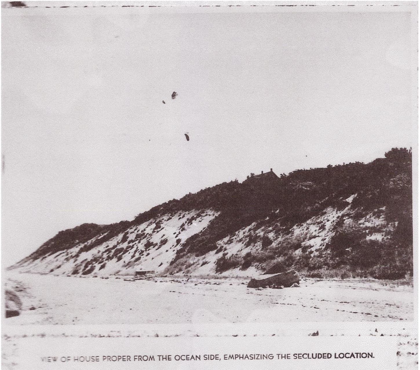
Figure 3. Wading River Radio Station, ca. 1942. Richard Millen reflections.