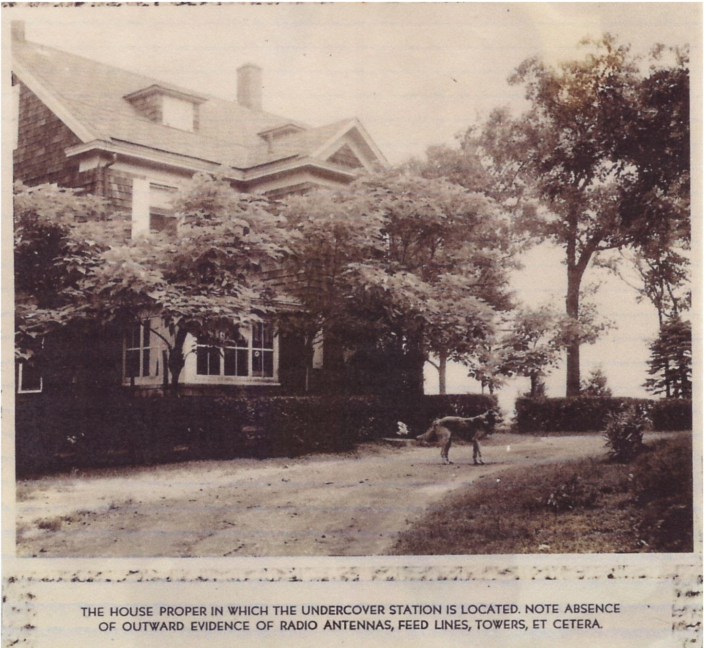
Figure 2. Wading River Radio Station, ca. 1942. Richard Millen reflections.