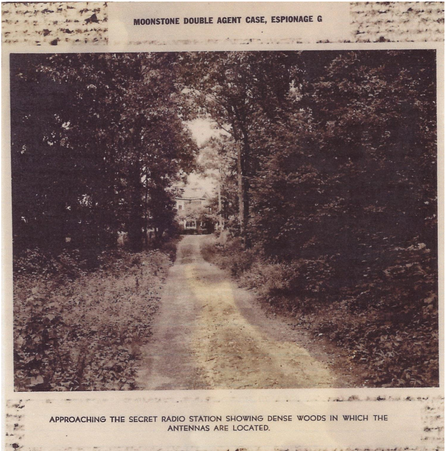
Figure 1. Wading River Radio Station, ca. 1942. Richard Millen reflections.