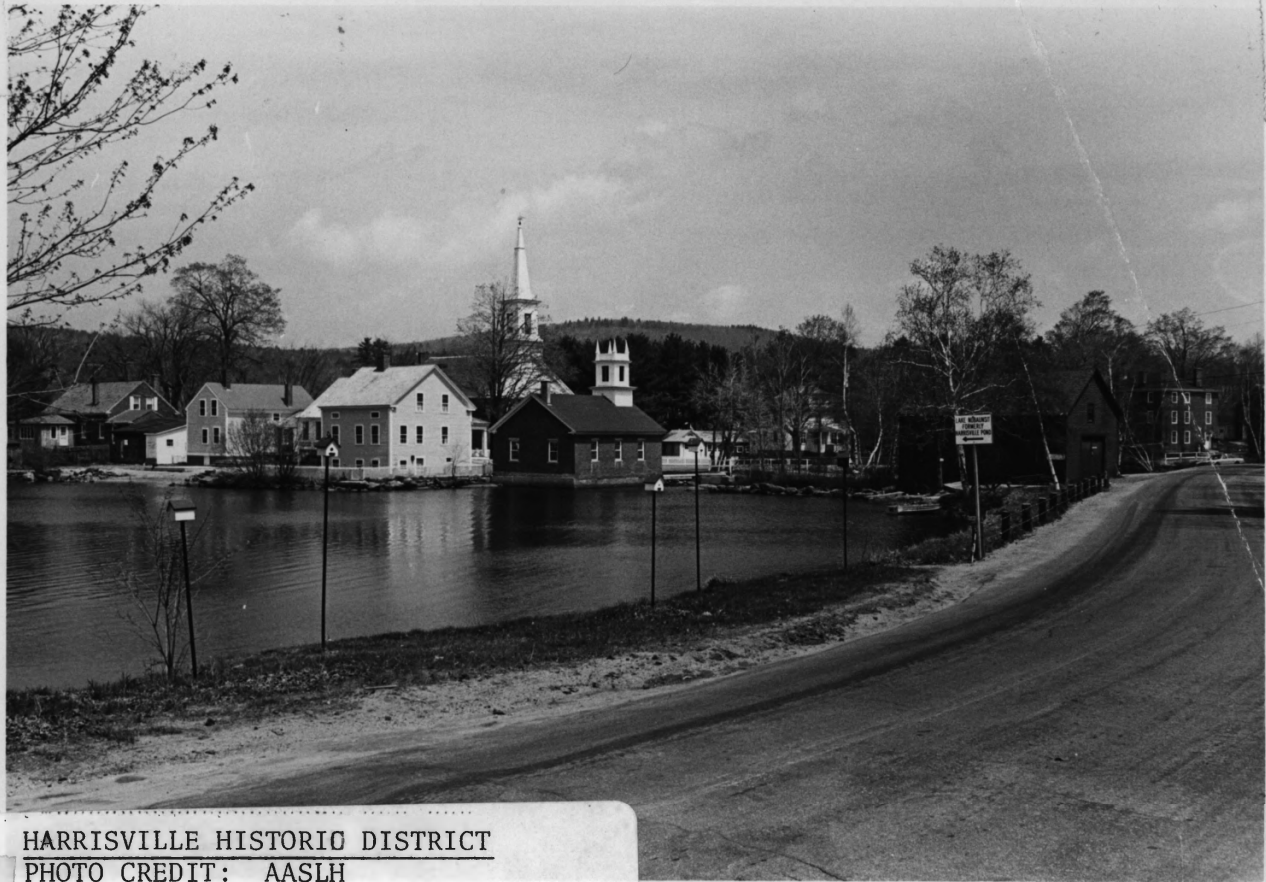
HARRISVILLE HISTORIC DISTRICT