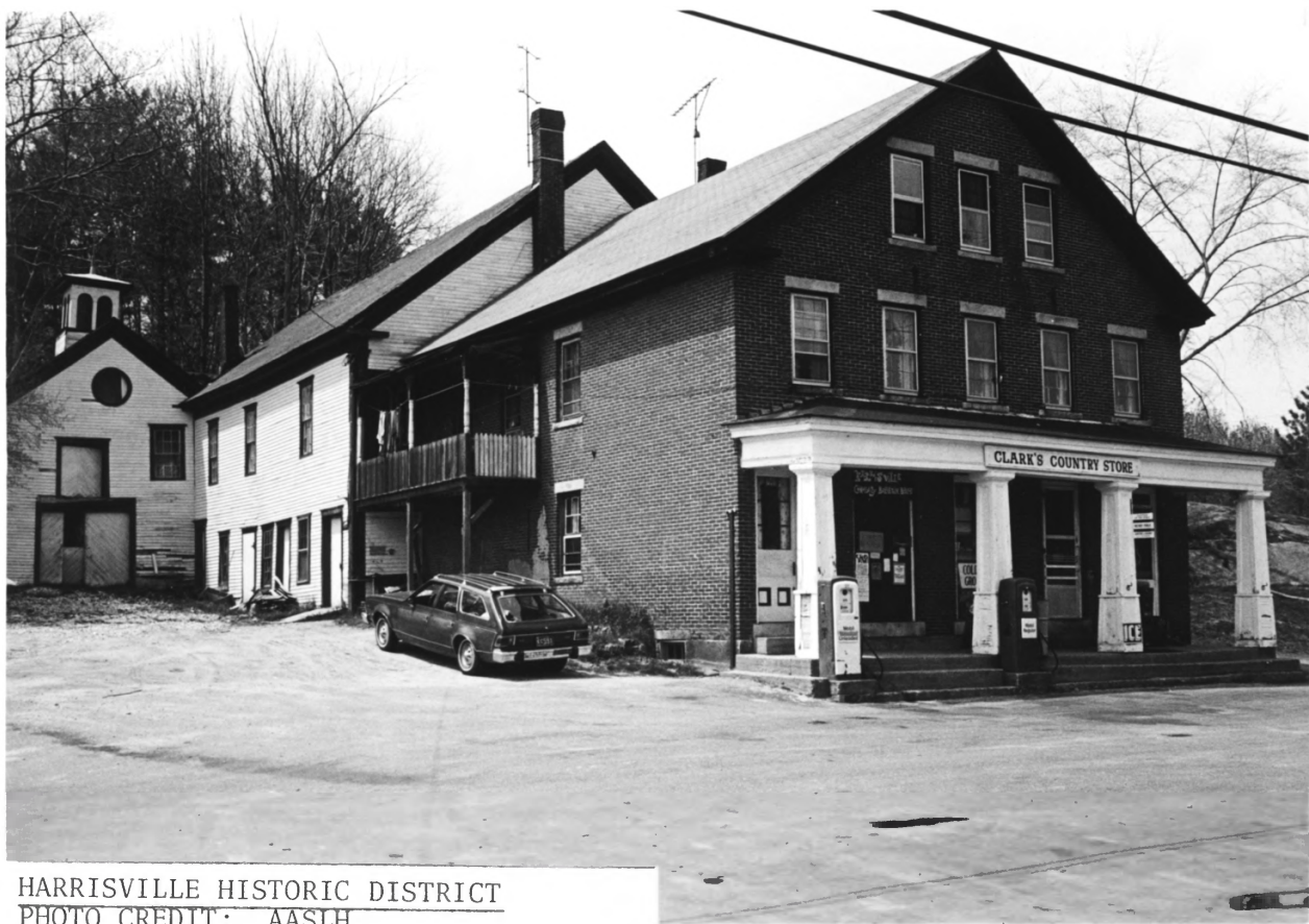
HARRISVILLE HISTORIC DISTRICT