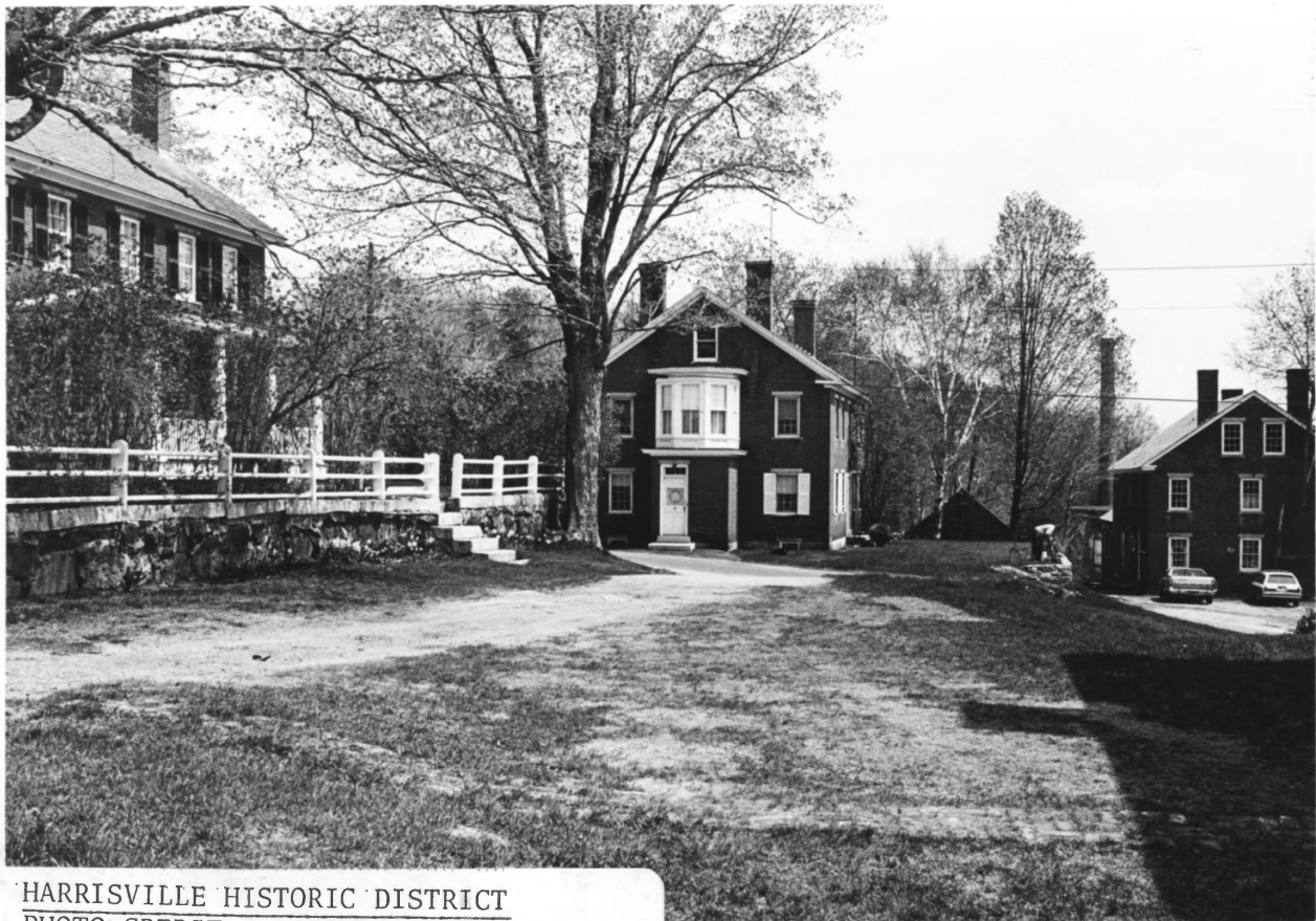
HARRISVILLE HISTORIC DISTRICT