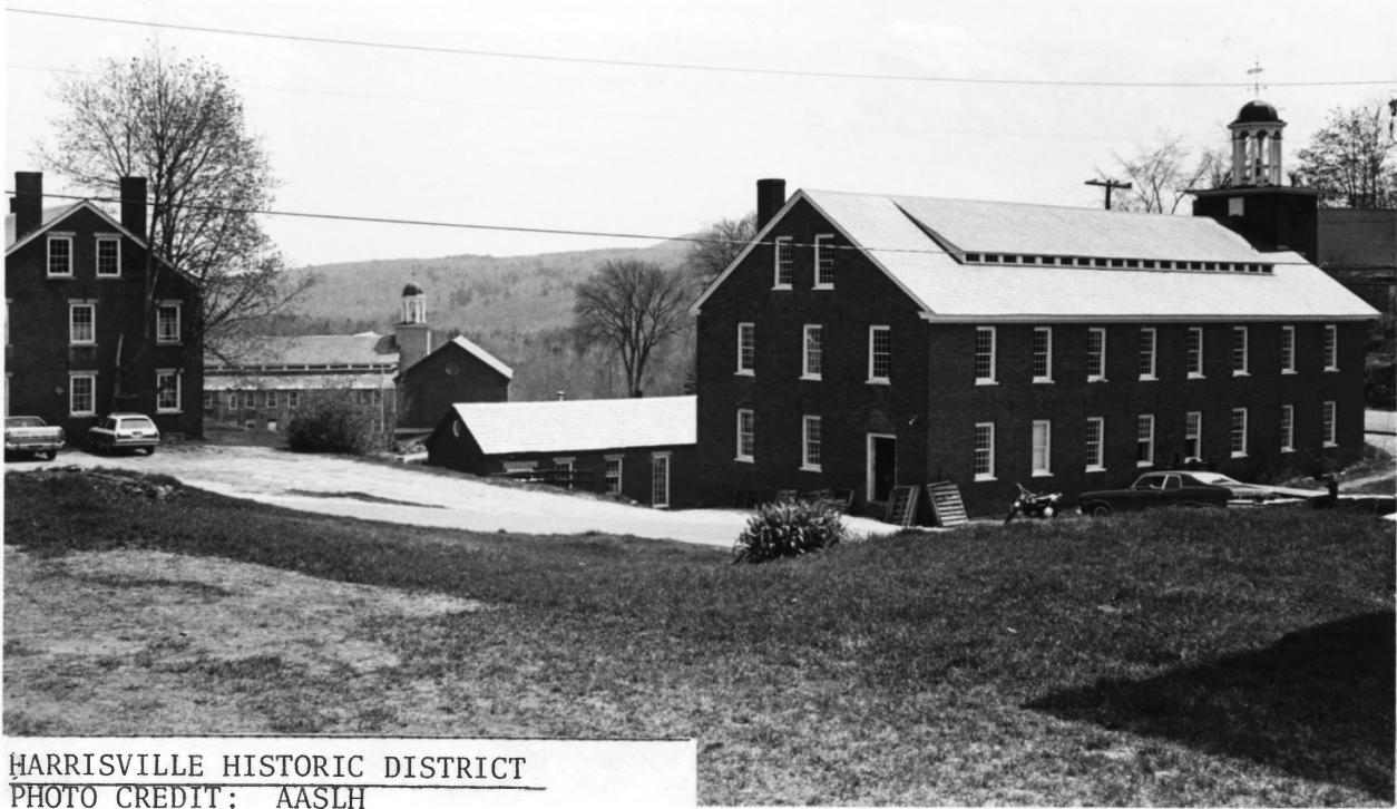
HARRISVILLE HISTORIC DISTRICT