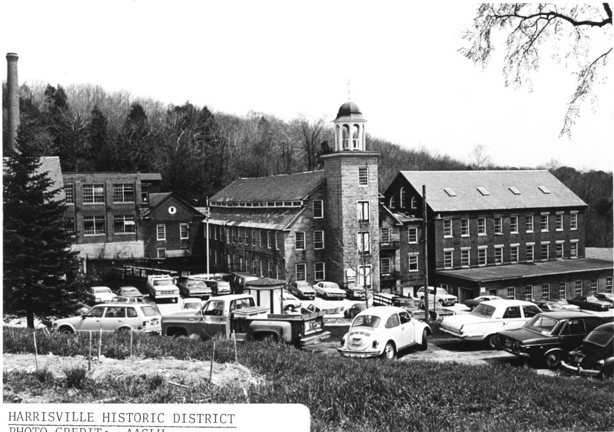
HARRISVILLE HISTORIC DISTRICT