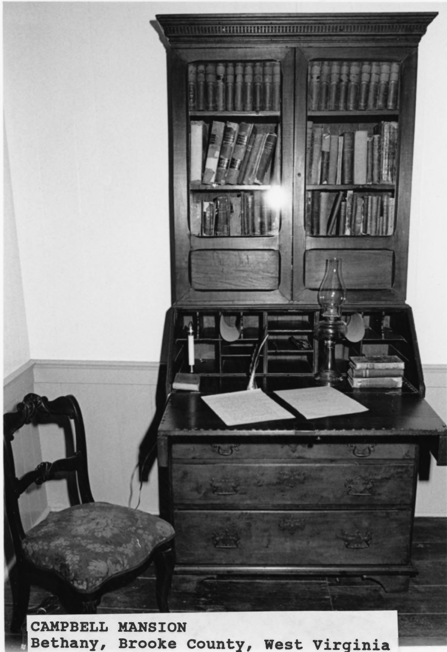
CAMPBELL MANSION Bethany, Brooke County, West Virginia "Secretary" in parlor in original portion of house