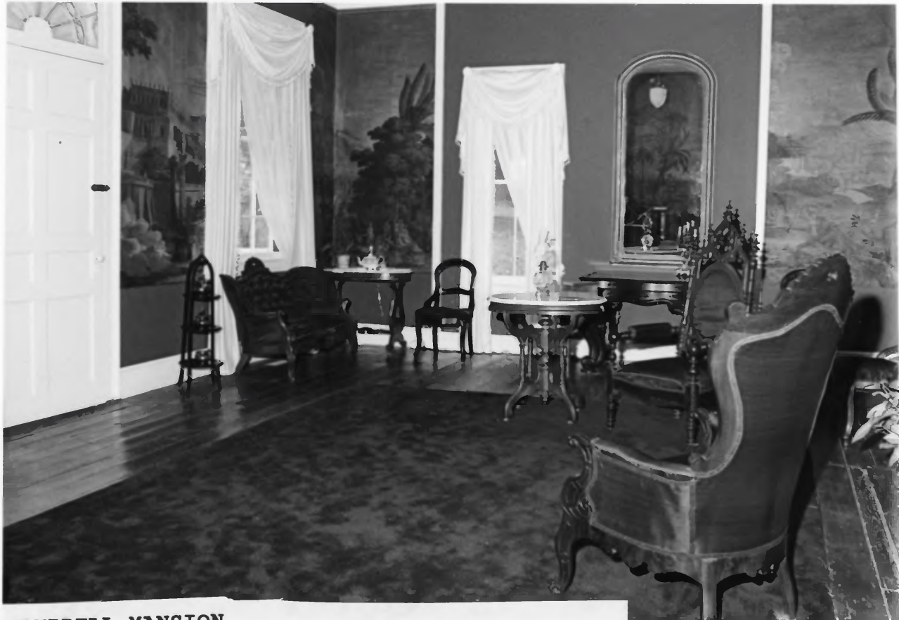
CAMPBELL MANSION Bethany, Brooke County, West Virginia Parlor in "Strangers Hall" portion of house, Photo: Bethany College, 1993