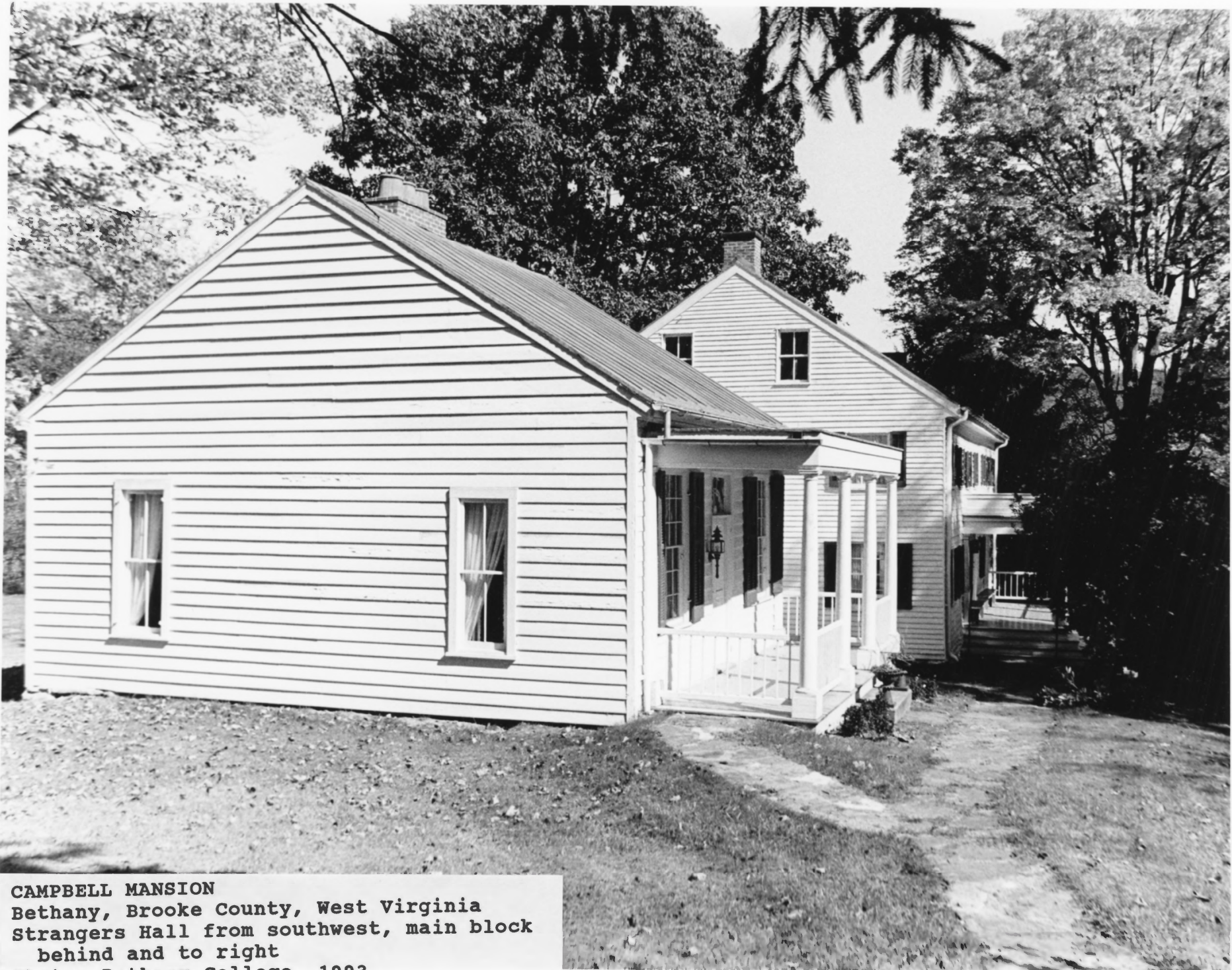
CAMPBELL MANSION Bethany, Brooke County, West Virginia Strangers Hall from southwest, main block behind and to right Photo: Bethany College, 1993