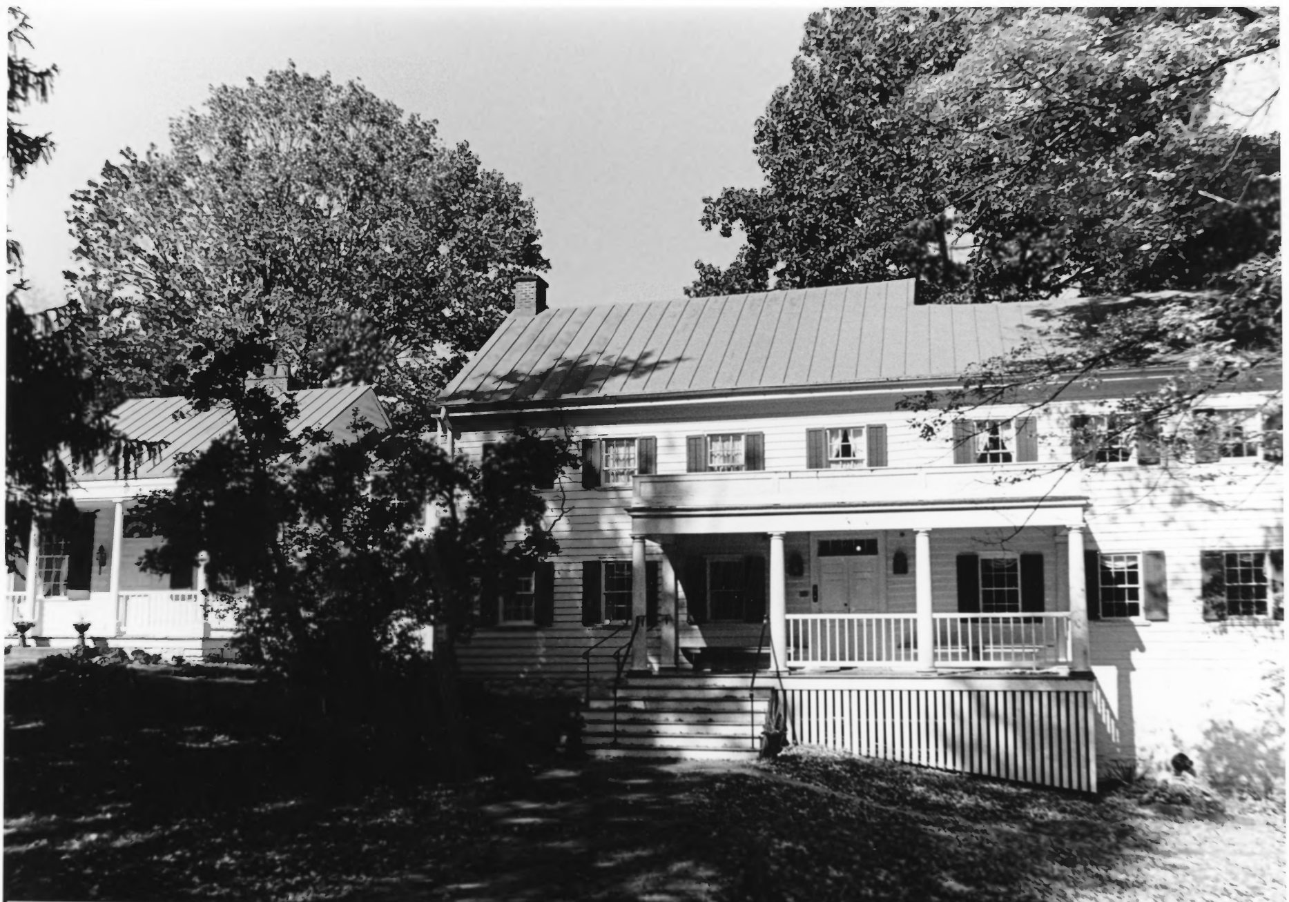
CAMPBELL MANSION Bethany, Brooke County, West Virginia View from south, main block to right. Strangers Hall to left Photo: Bethany College, 1993