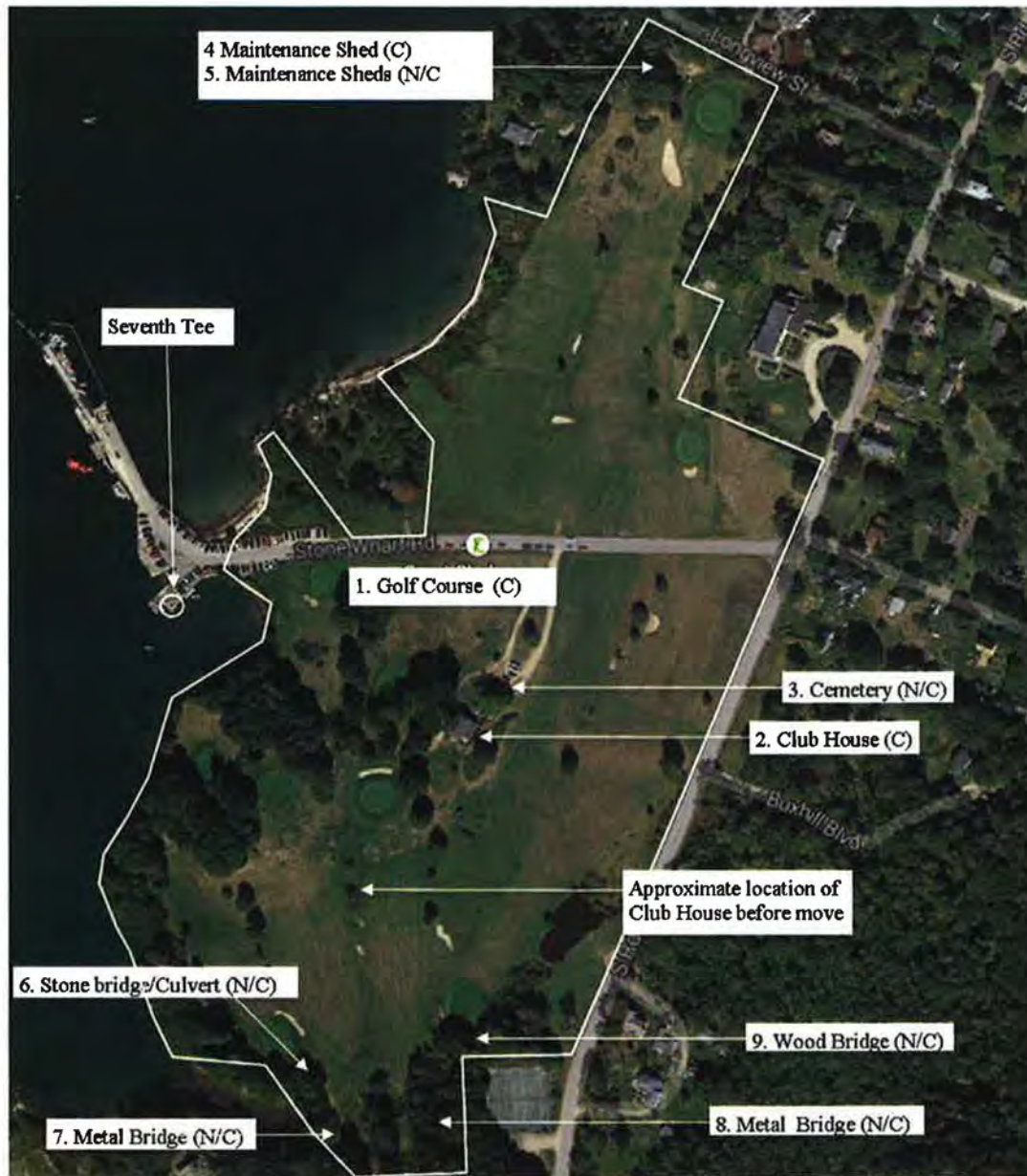
Great Chebeague Golf Club Chebeague Island, Maine Sketch Map 3 April 2015 ttl-architects,llc