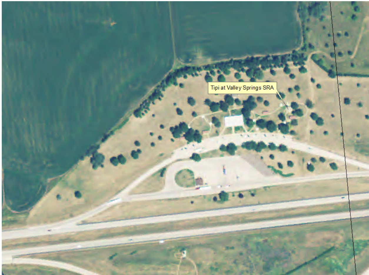
SD_MinnehahaCounty_ConcreteInterstateTipisofSouthDakotaMPS_ValleySpringsRestStopTipi: SW¼, NE¼, S27, T102N, R47W; UTM Z=14 E=7046940 N=4831740. 7.5 Minute Quadrangle Map, 1:24,000. Produced in ArcMap 8 August 2014.

Valley Springs Rest Stop Tipi Name of Property Minnehaha County, SD County and State Concrete Interstate Tipis of South Dakota Name of multiple listing (if applicable)