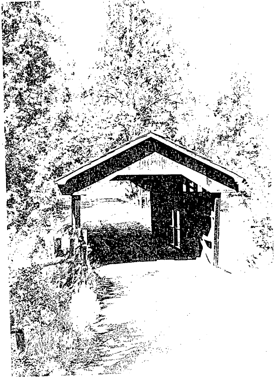
Bridge Index No. 5 Rock-o-the-Range Covered Bridge Vicinity of Bend Deschutes County, Oregon East Elevation

Nick and Bill Cockrell Photo, 1976 751 Piedmont NW Salem, OR 97304