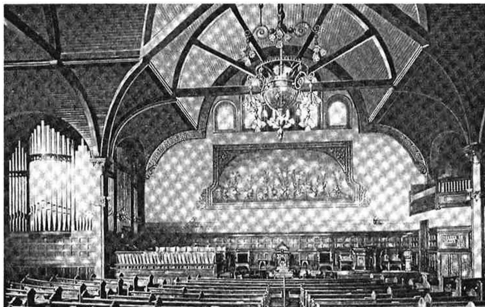
Auditorium-sanctuary (1893) as depicted in 1903 dedication brochure. View west-southwest showing interior finishes before 1970 fire. Courtesy, Dorchester Historical Society (image no. 2226)