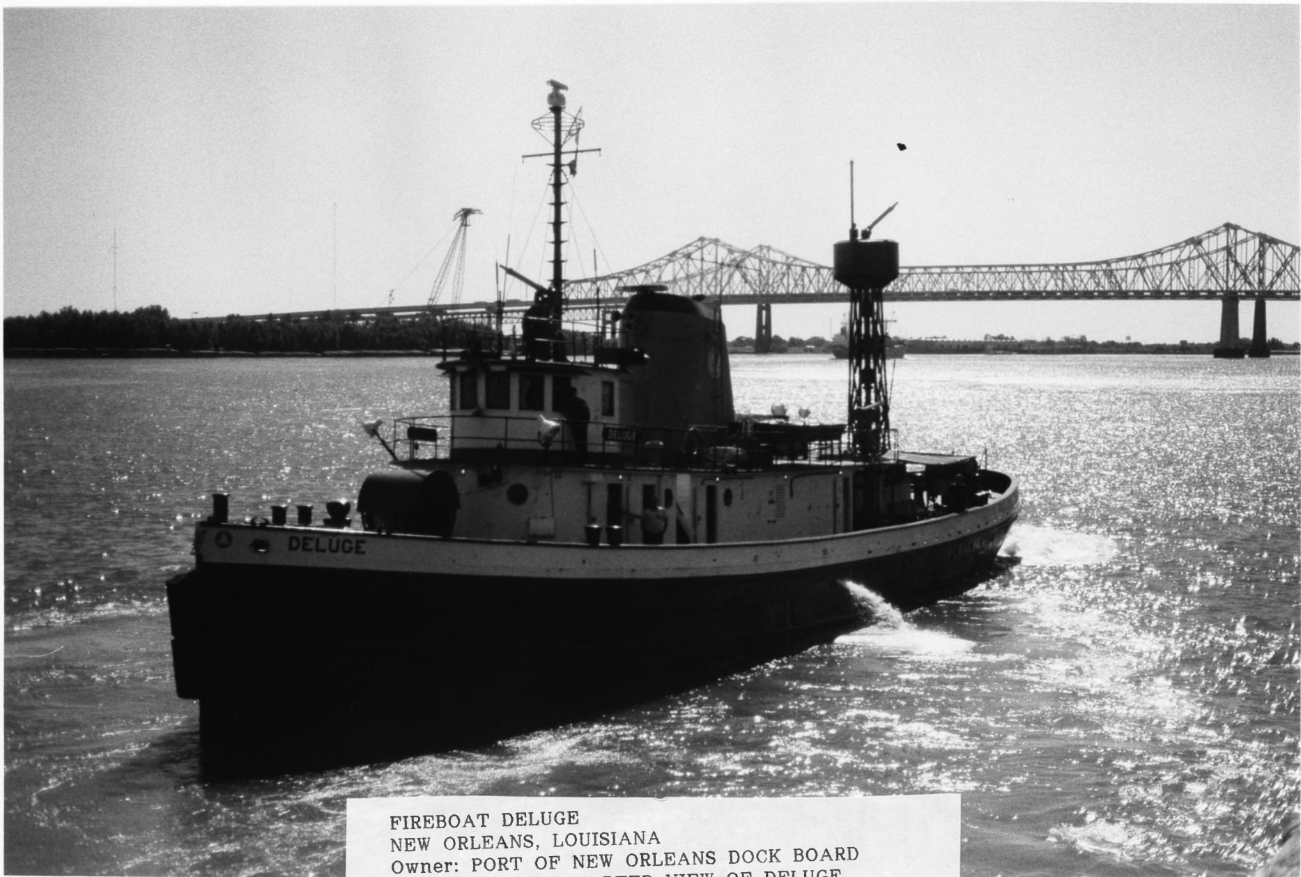
FIREBOAT DELUGE NEW ORLEANS, LOUISIANA Owner: PORT OF NEW ORLEANS DOCK BOARD FORWARD PORT QUARTER VIEW OF DELUGE. Photo #2 by JAMES P. DELGADO, 1988 Courtesy of: NATIONAL PARK SERVICE