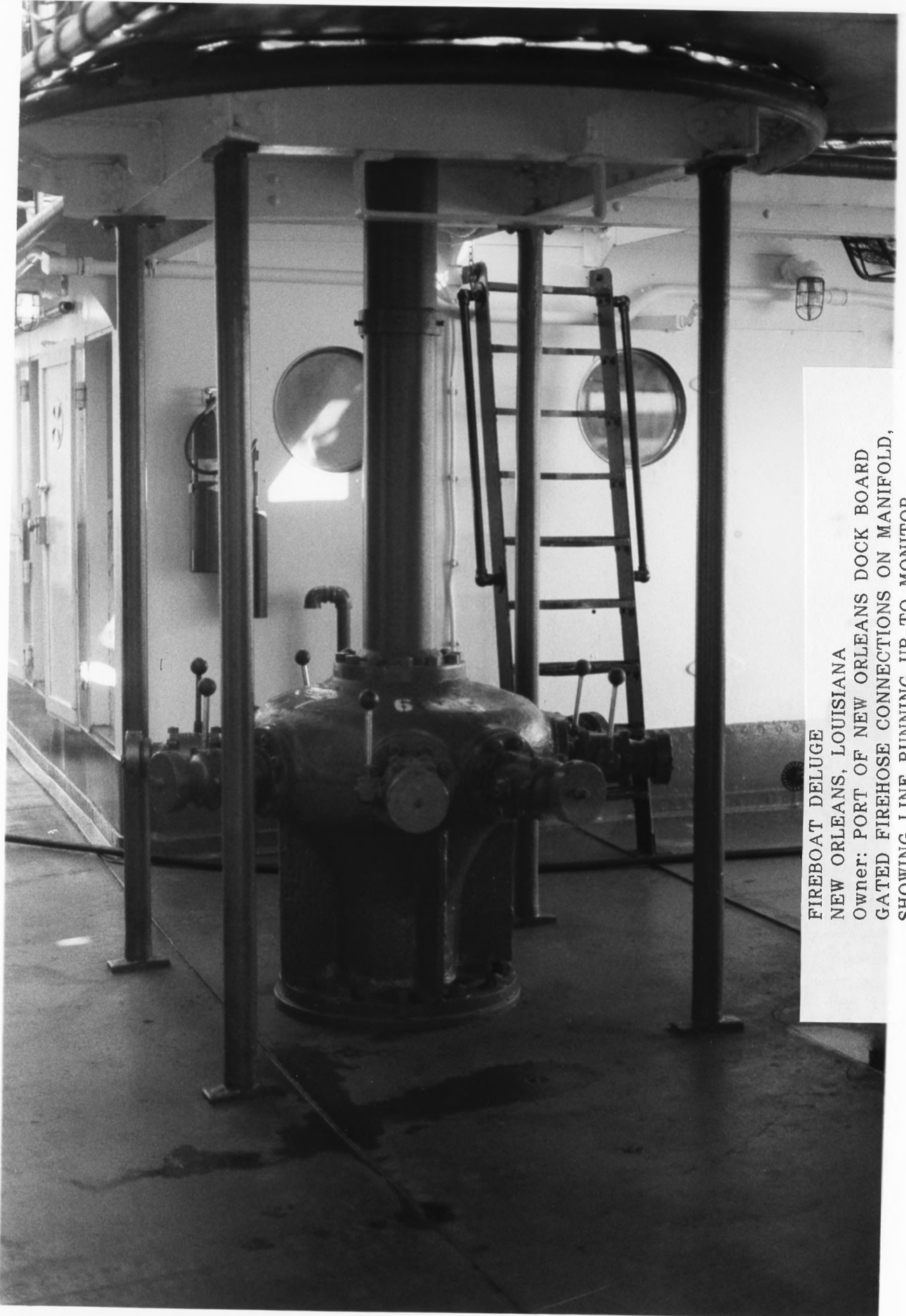
FIREBOAT DELUGE NEW ORLEANS, LOUISIANA Owner: PORT OF NEW ORLEANS DOCK BOARD GATED FIREHOSE CONNECTIONS ON MANIFOLD, SHOWING LINE RUNNING UP TO MONITOR. Photo #8 by JAMES P. DELGADO, 1988 Courtesy of: NATIONAL PARK SERVICE