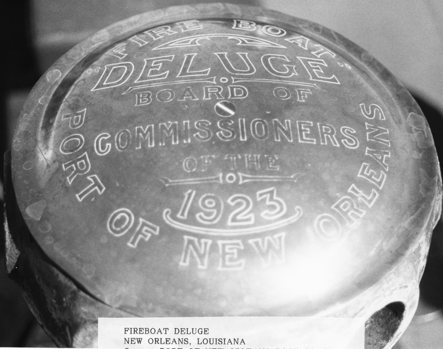
FIREBOAT DELUGE NEW ORLEANS, LOUISIANA Owner: PORT OF NEW ORLEANS DOCK BOARD CAPSTAN PLATE SHOWING INSCRIPTION. Photo #4 by JAMES P. DELGADO, 1988 Courtesy of: NATIONAL PARK SERVICE