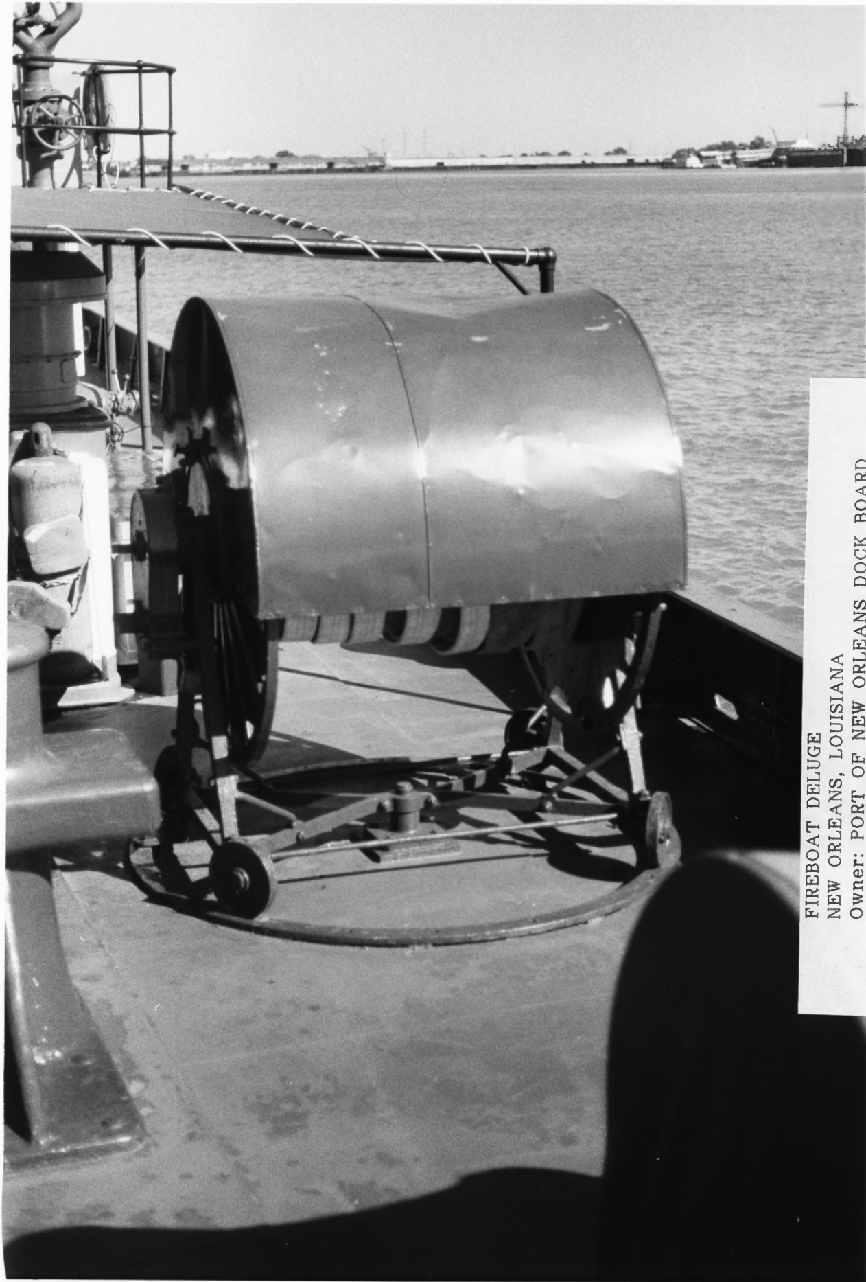
FIREBOAT DELUGE NEW ORLEANS, LOUISIANA Owner: PORT OF NEW ORLEANS DOCK BOARD PROTECTED HOSE REEL ON BARBETTE, AFTER STARBOARD QUARTER, MAIN DECK. Photo #7 by JAMES P. DELGADO, 1988 Courtesy of: NATIONAL PARK SERVICE