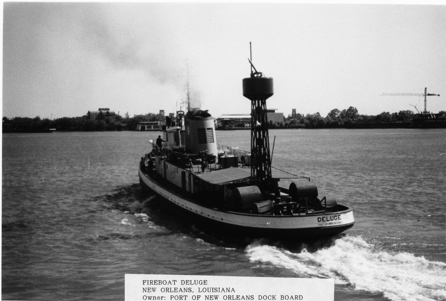
FIREBOAT DELUGE NEW ORLEANS, LOUISIANA Owner: PORT OF NEW ORLEANS DOCK BOARD PORT AFTER QUARTER VIEW OF DELUGE. Photo #3 by JAMES P. DELGADO, 1988 Courtesy of: NATIONAL PARK SERVICE