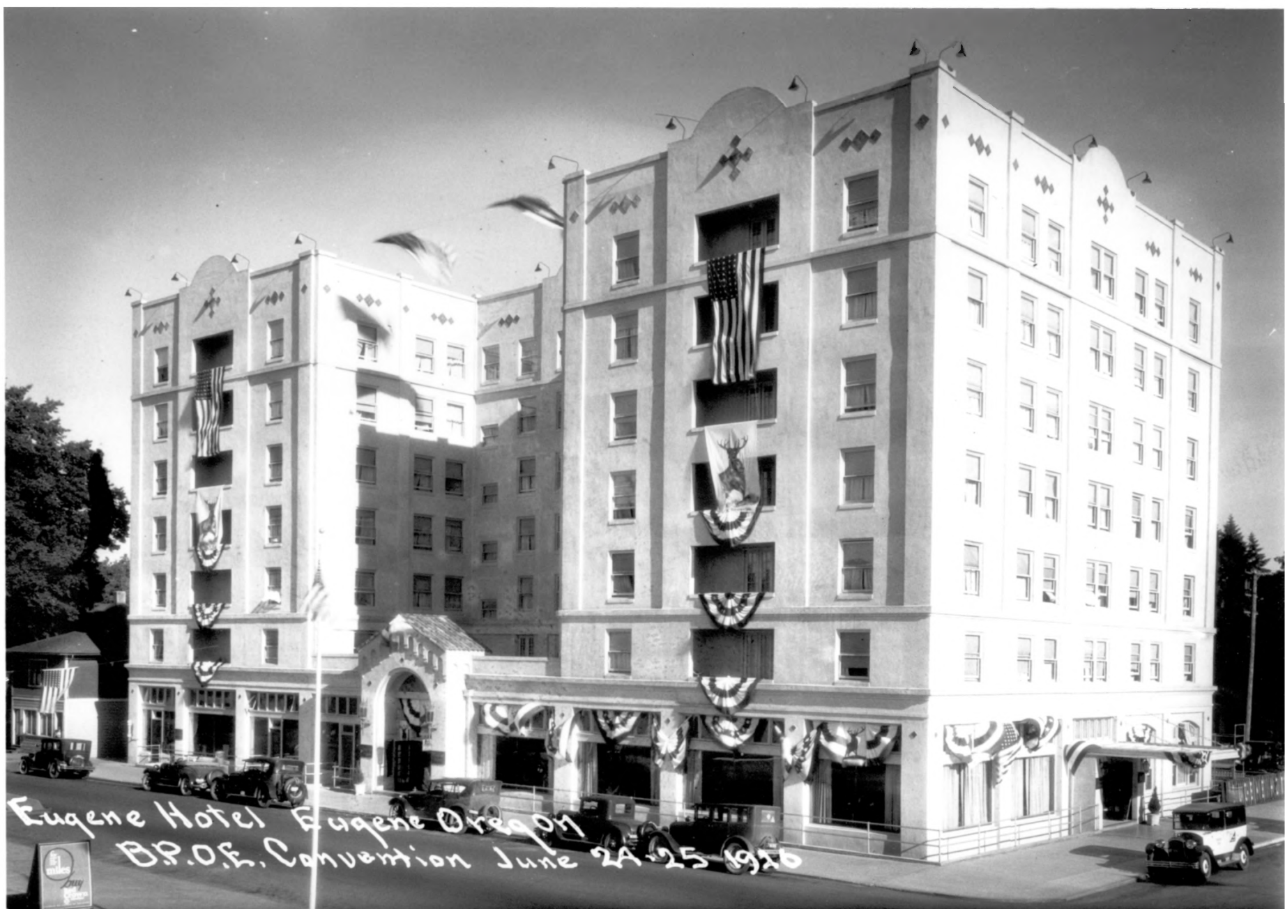
Eugene Hotel Eugene Oregon B.P.O.E. Convention June 24-25 1926