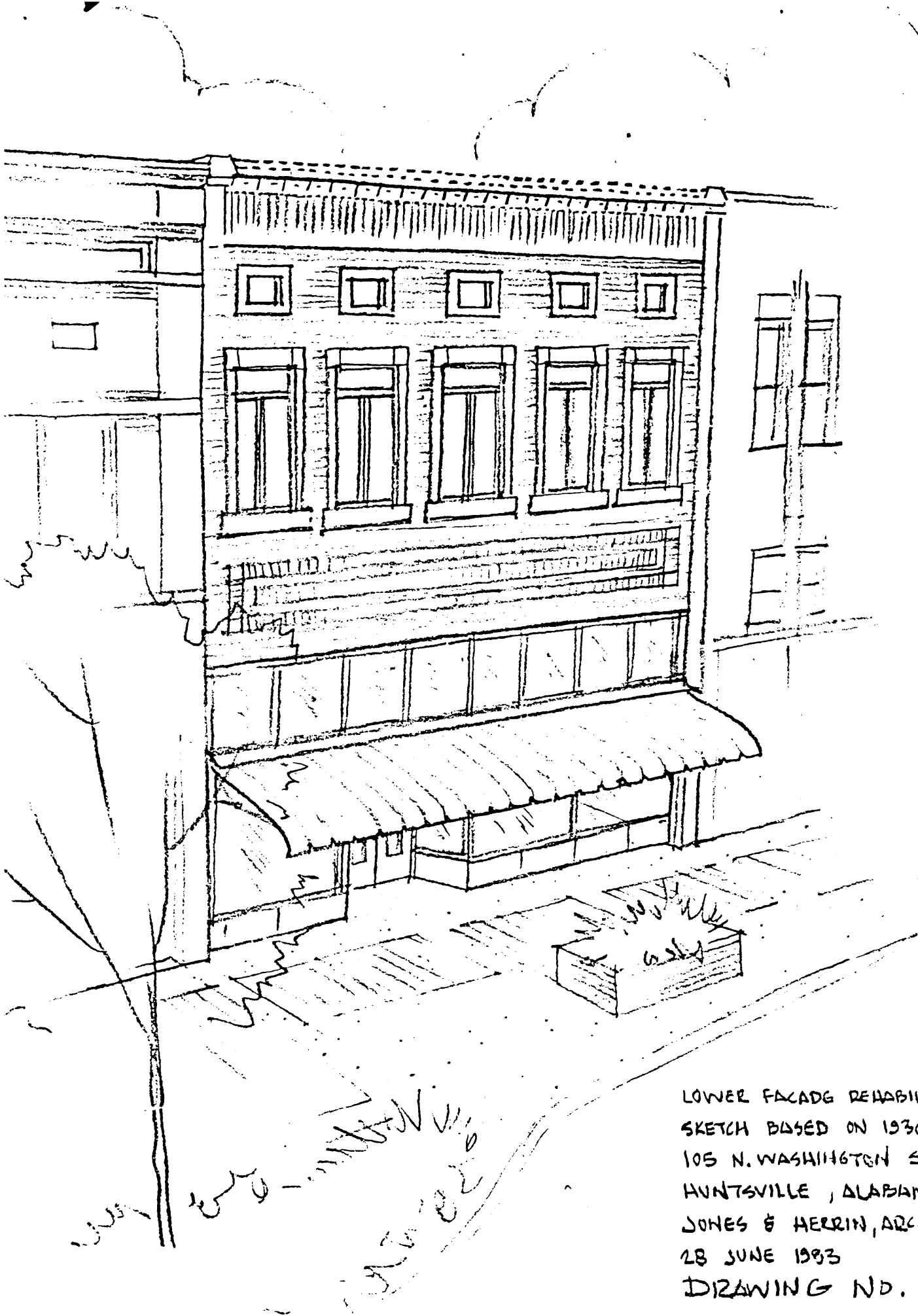
LOWER FACADG REHABILITATION SKETCH BASED ON 1930'S PHOTO 105 N. WASHINGTON STREET HUNTSVILLE, ALABAMA JONES & HERRIN, ARCHITECTS, A.I 28 JUNE 1983 DRAWING NO. 1