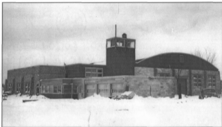
Looking southeast at hangar, winter 1942. Stucco has not been applied to the tower or dormers and the building is not yet painted.

Section Additional Documentation , Page 1 , Carleton Airport name of property Goodhue County, Minnesota county and state