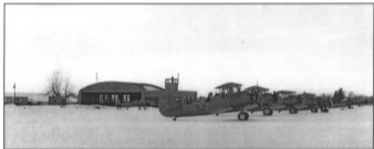
Looking southwest, winter 1943 or 1944.

Goodhue County, Minnesota county and state