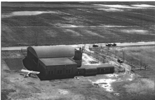
View to the south, 1945.

Goodhue County, Minnesota county and state