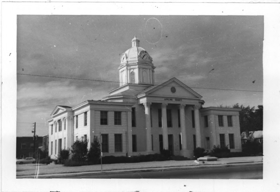
APPLING COUNTY COURTHOUSE

As a repository for records of marriages, wills, land transactions, the courthouse chronicles the county and is a focal point in the life of every citizen.