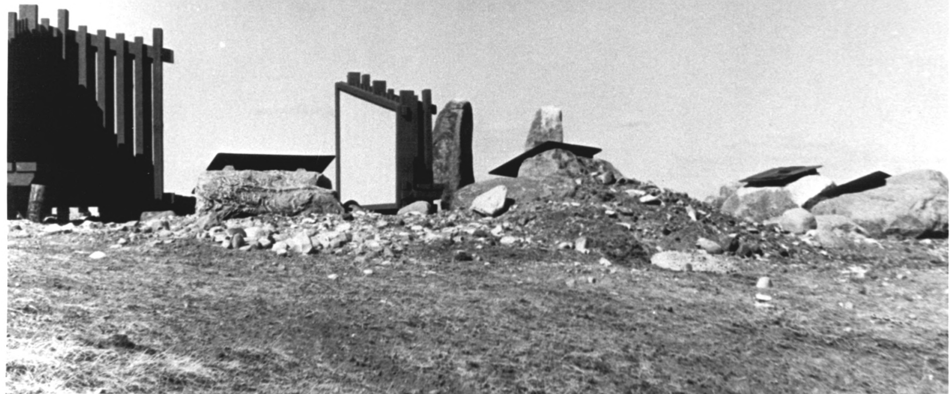
BEAR PAW BATTLEFIELD (Interpretive Markers) view looking from high ground west of Snake Creek north & west Montana Dept. of Fish, Wildlife & Parks