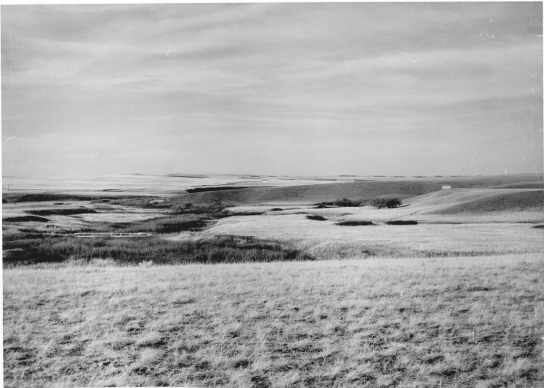
CHIEF JOSEPH BATTLEGROUND OF THE BEAR'S PAW, Montana Looking north from near top of bluff where Miles Charge occurred Photo by Wes Woodgerd, Montana Fish and Game Film Center 1968