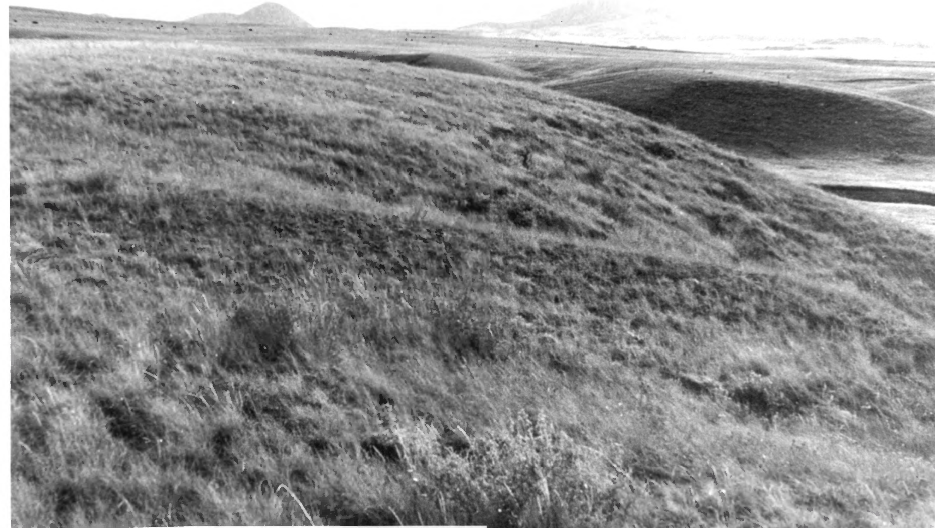
Bear Paw Battlefield (area of Miles' cavalry charge south of ravine) looking South across battleground Montana Dept. of Fish, Wildlife & Parks