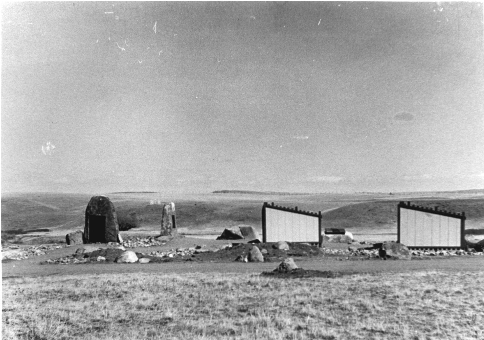
BEAR PAW BATTLEFIELD (Interpretive Facilities) looking from west to east across Snake Creek toward Indian positions on east side Montana Dept. of Fish, Wildlife & Parks