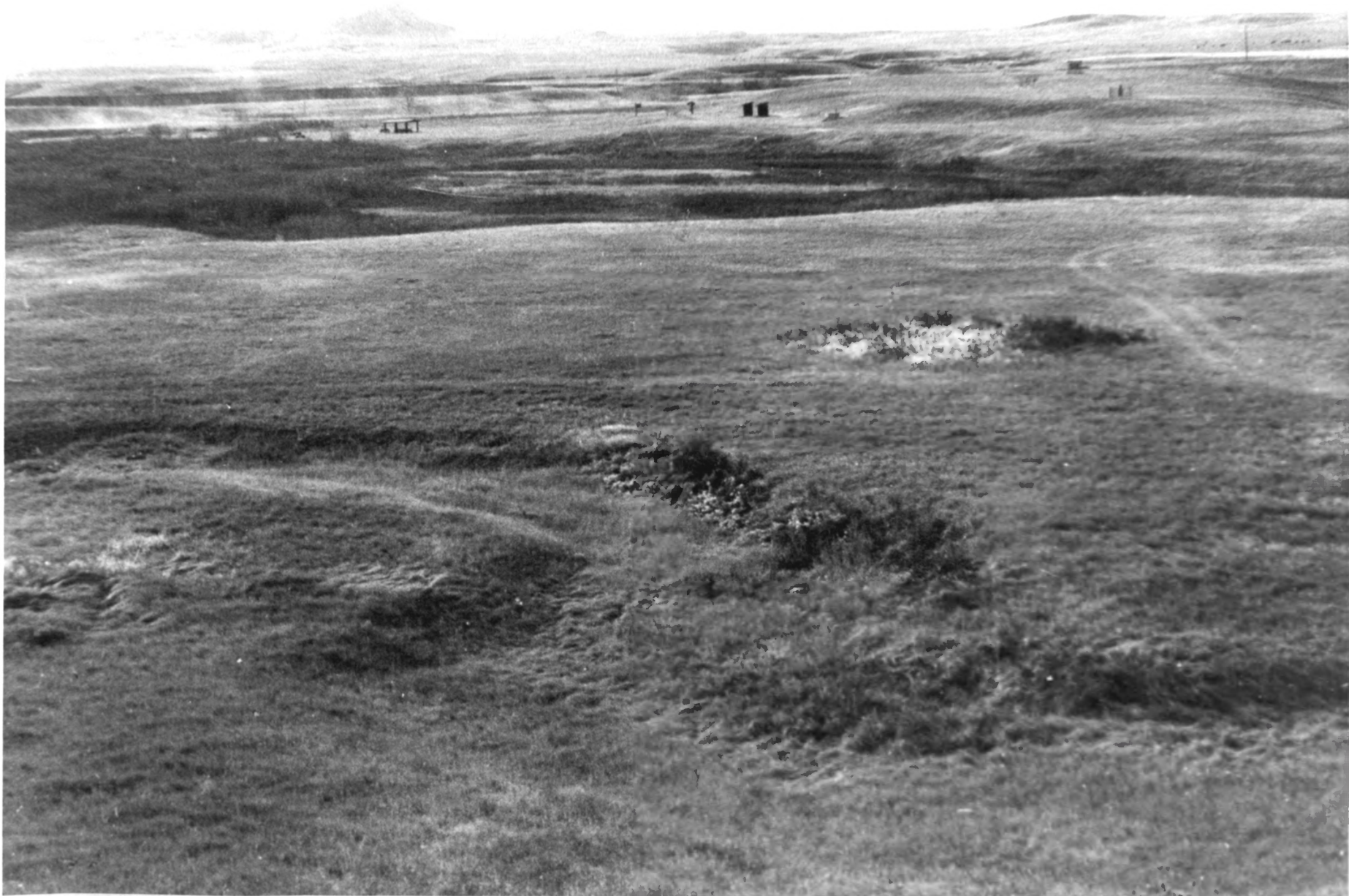
BEAR PAW BATTLEFIELD (Picnic area, Interp. Fac.) looking southwest from rifle pits on east side of Snake Creek, Bear Paw Mts. in back