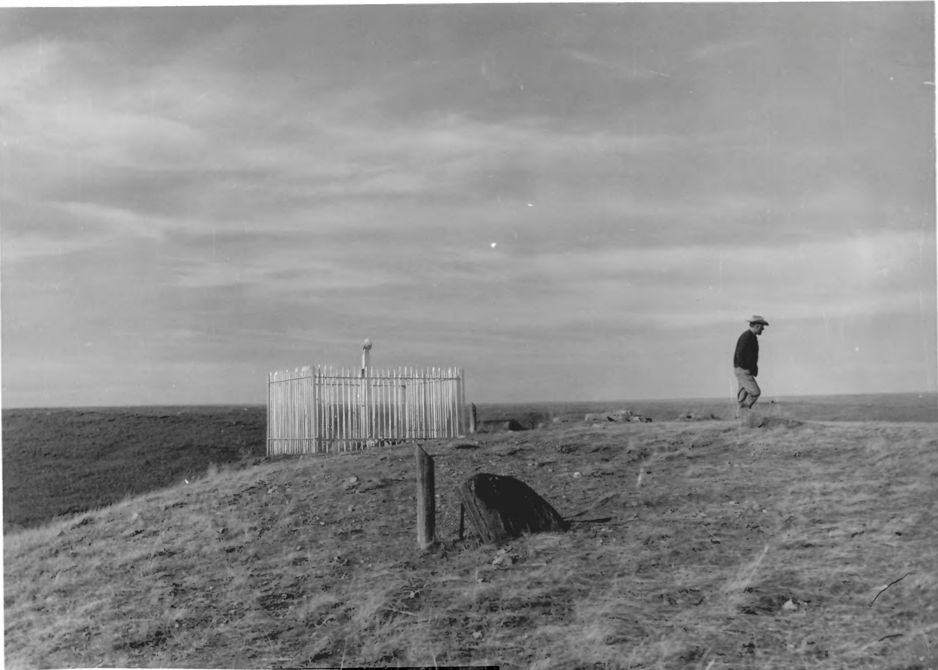
CHIEF JOSEPH BATTLEGROUND OF THE BEAR'S PAW, Montana Looking north from site of Chief Looking Glass Monument

1968