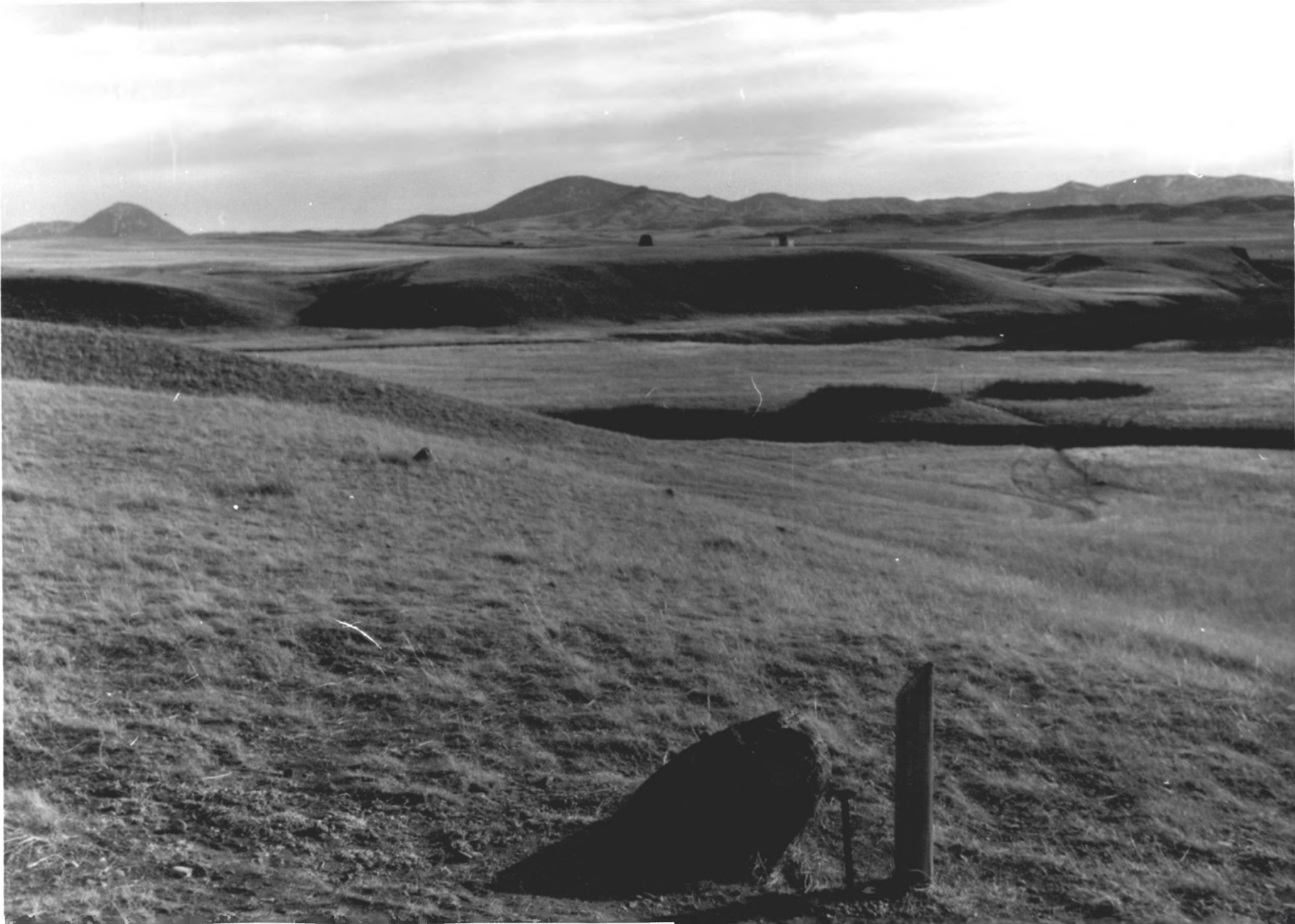
CHIEF JOSEPH BATTLEGROUND OF THE BEAR'S PAW, Montana Looking south toward bluff where Miles Charge occurred 1968