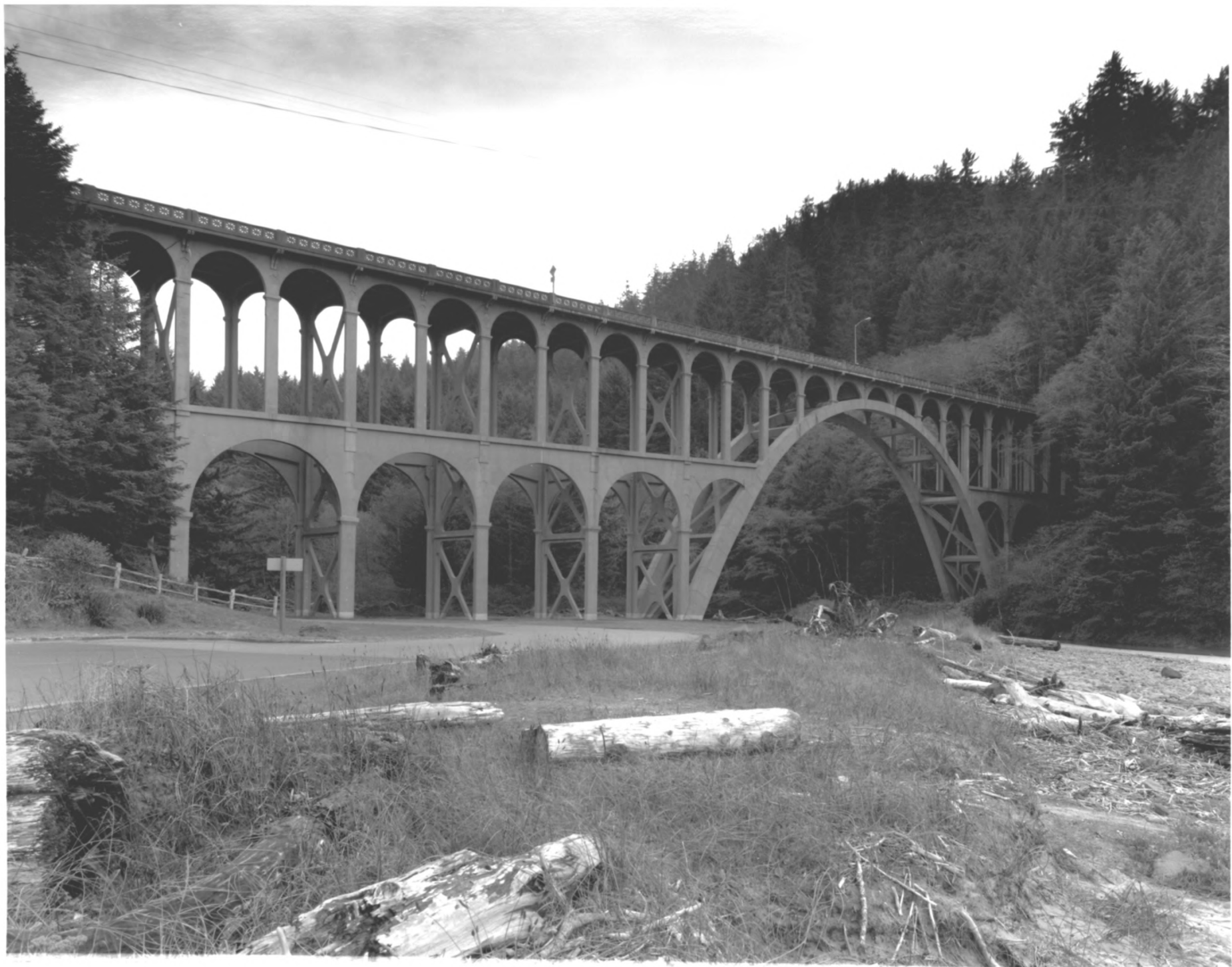
CAPE CREEK BRIDGE, HELETA HEAD VICINITY, OREGON #3