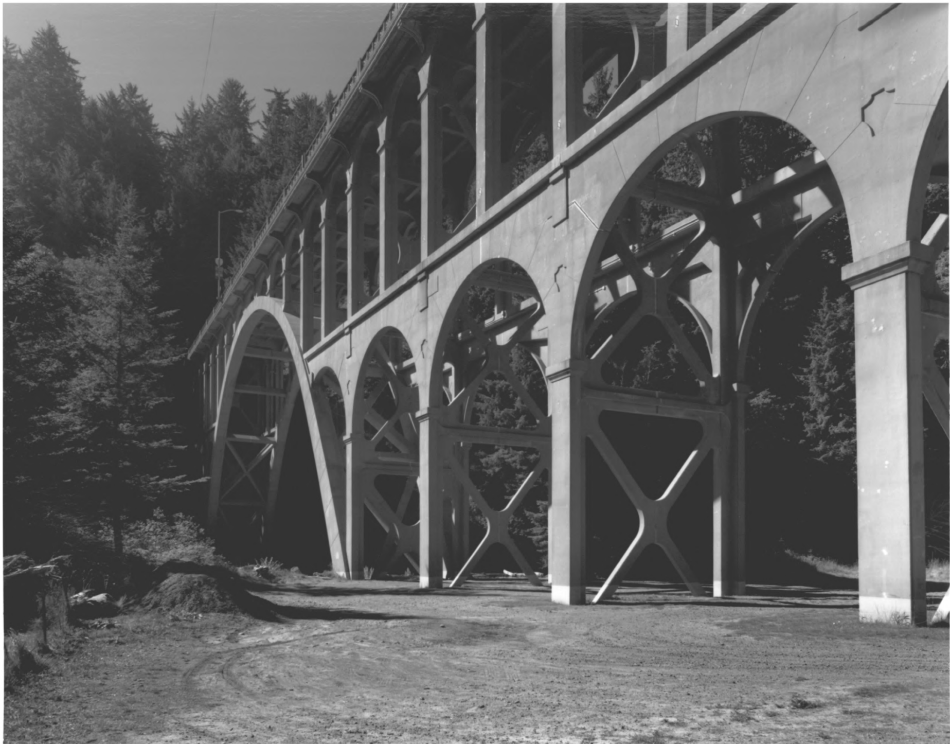
CAPE CREEK BRIDGE, HELENA HEAD VICINITY, OREGON #5