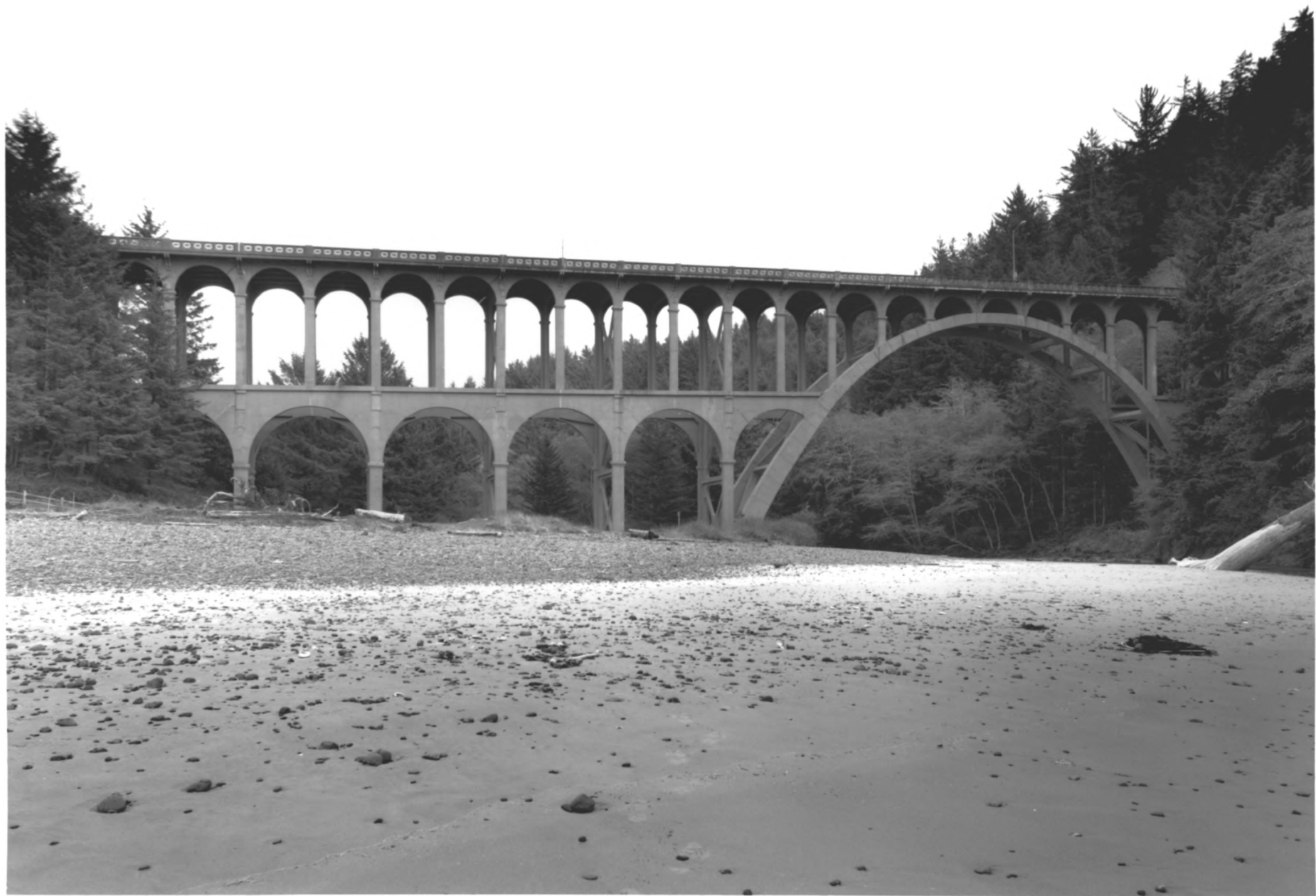
CAPE CREEK BRIDGE, HEGETA HEAD VICINITY, OREGON