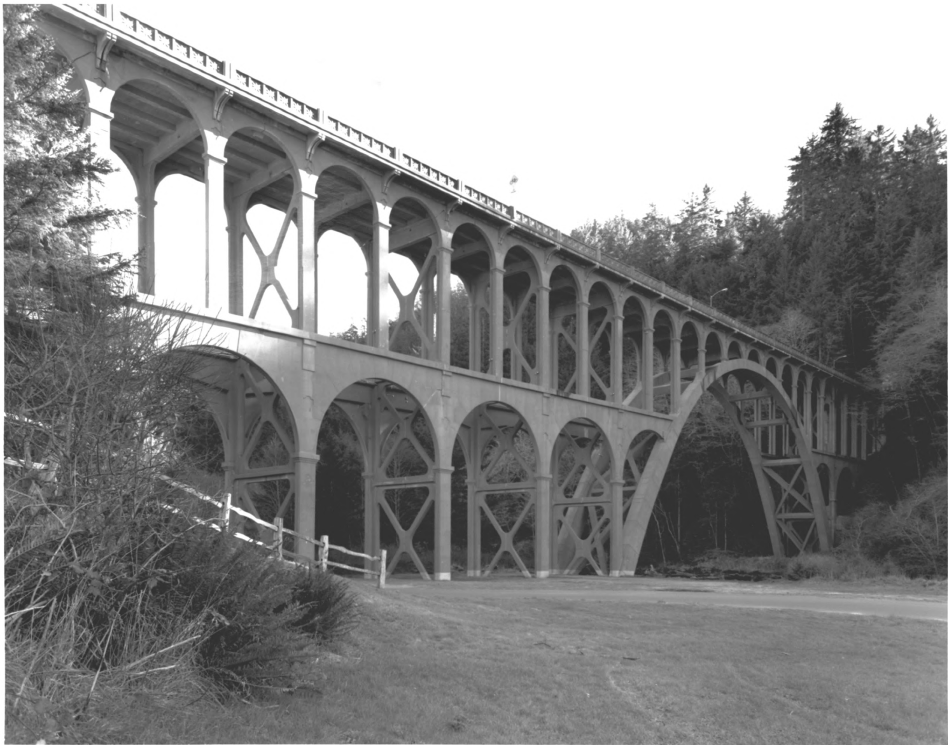
CAPE CREEK BRIDGE, HELETA HEAD VICINITY, OREGON