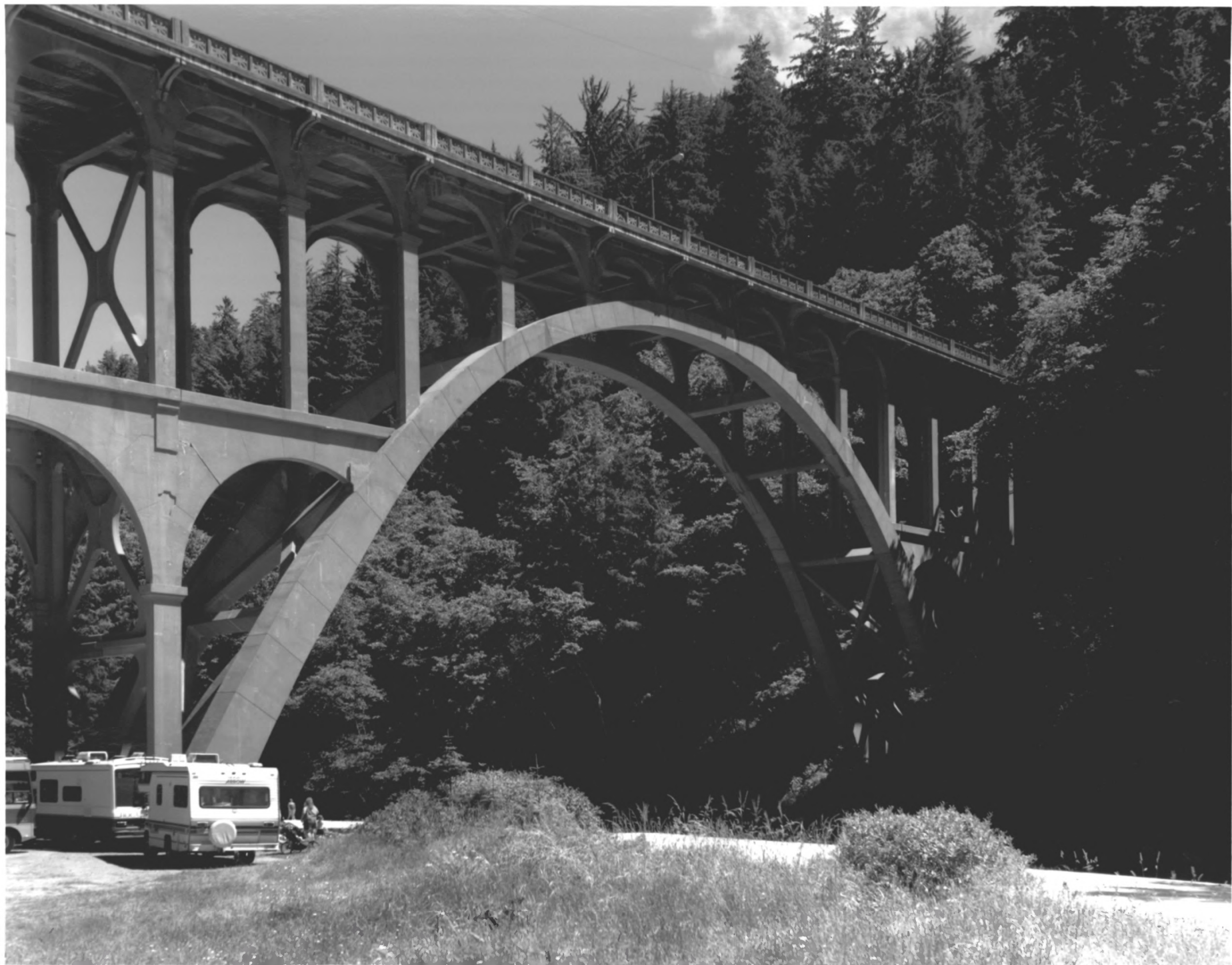
CAPE CREEK BRIDGE, HELENA AREA VICINITY OREGON #6