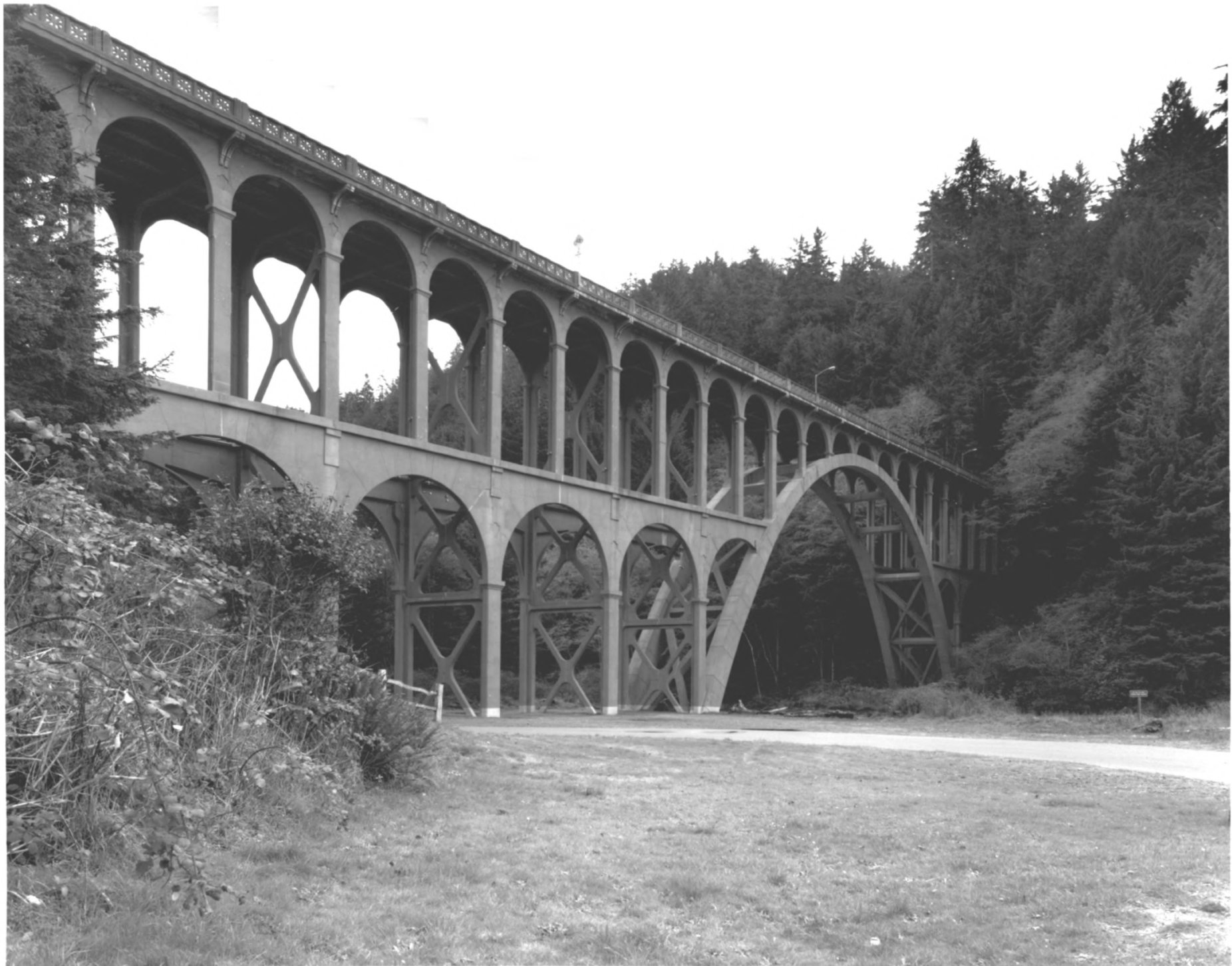
CAPE CREEK BRIDGE, HECETA HEAD VICINITY, OREGON #2