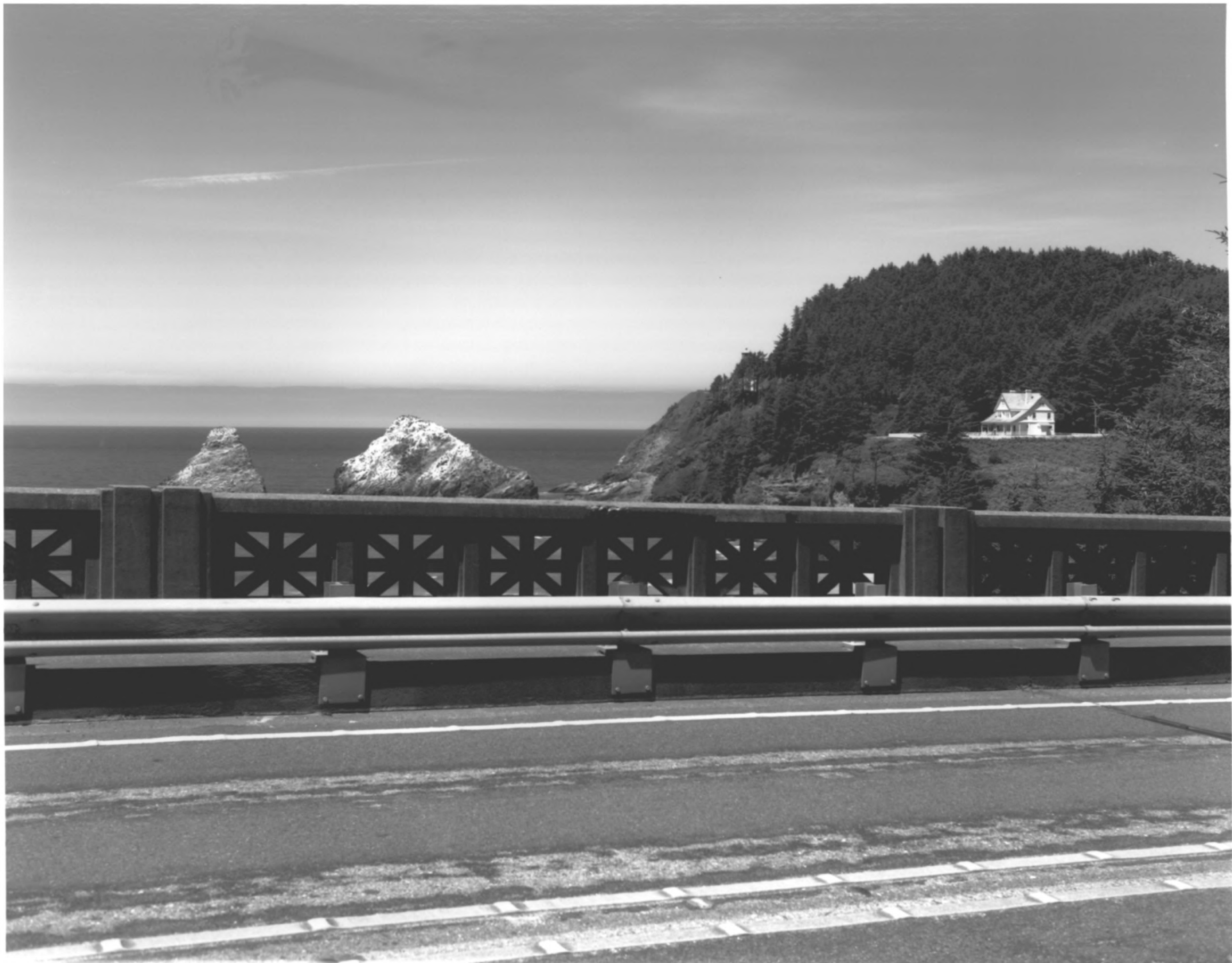
CAPE CREEK BRIDGE, NELETA HEAD VICINITY, OREGON