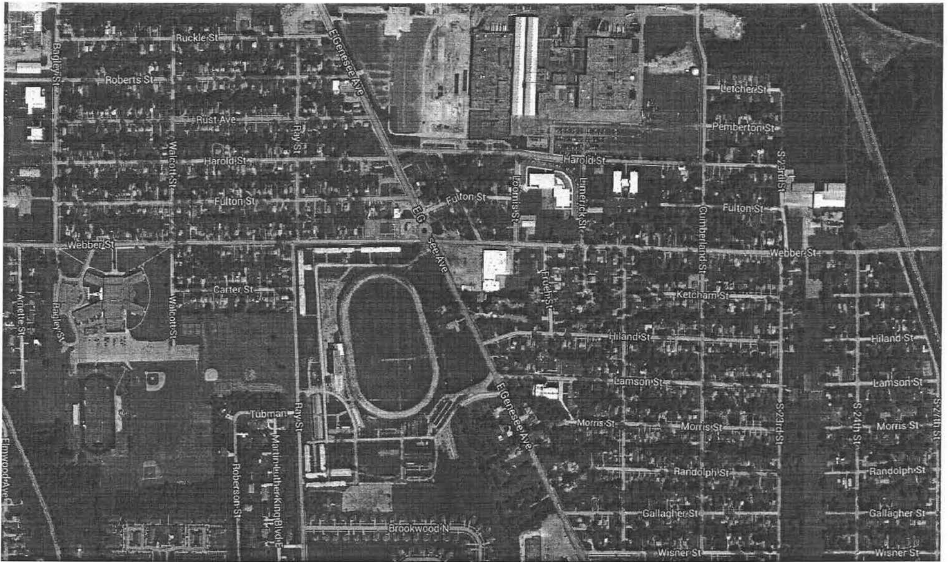
Saginaw County Fairgrounds Main Gate, Saginaw County, Michigan Lat.: 43.407299; Long.: -83.917084