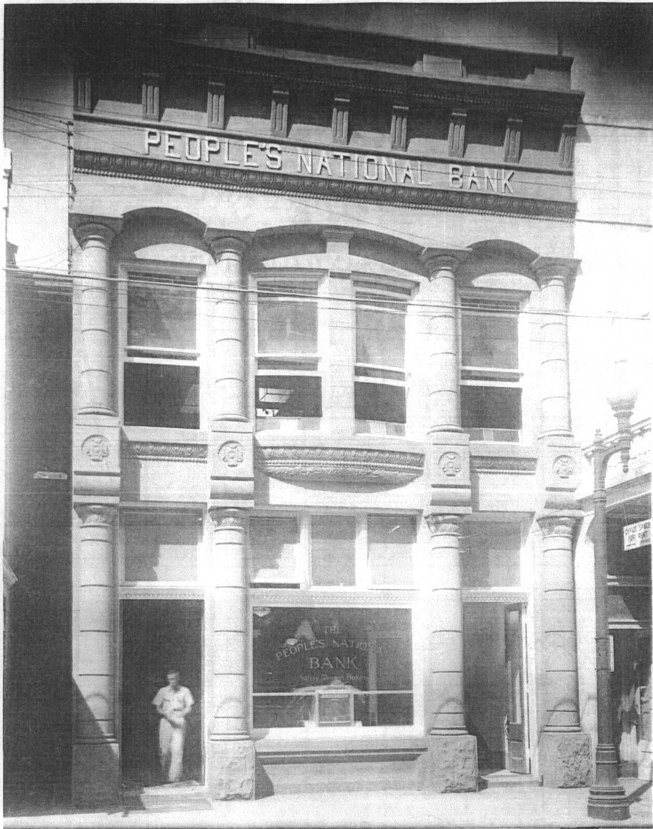
People's National Bank