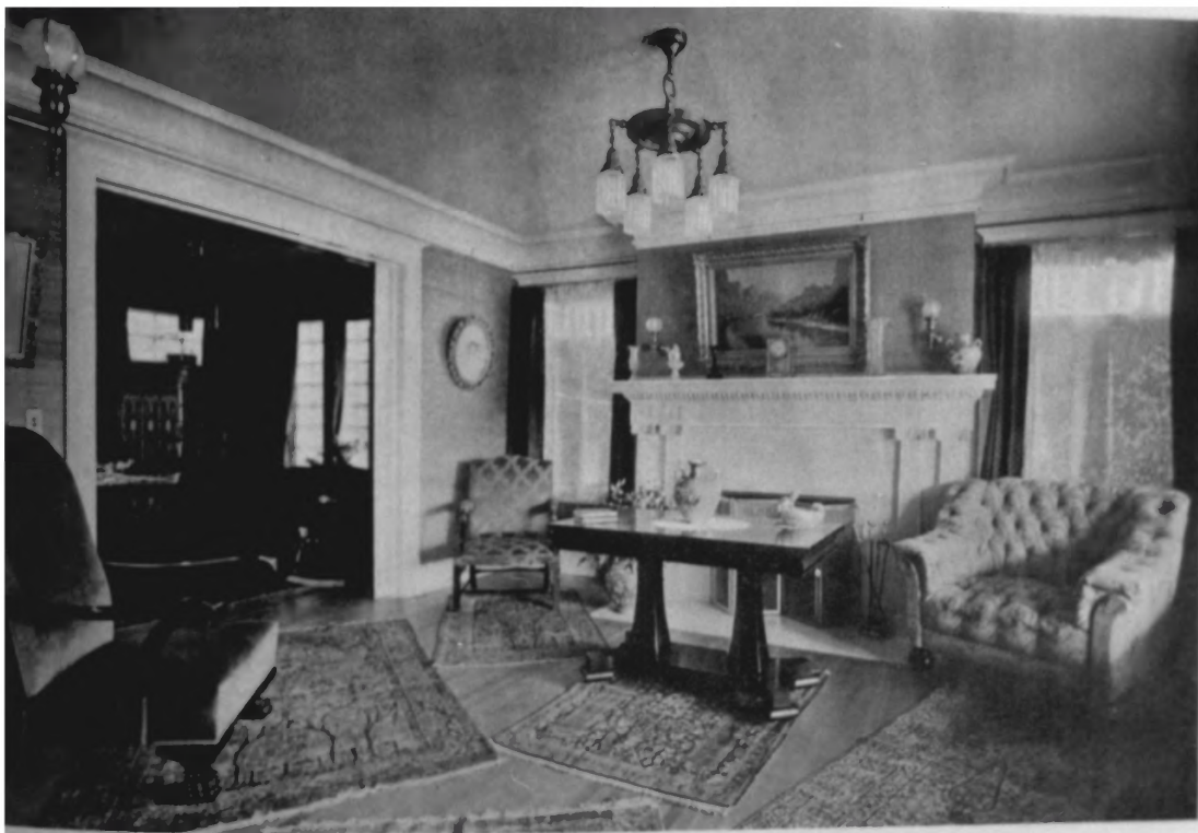
Living-room in Becker Home