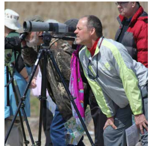
Millennium Reserve partners touring land to be preserved and restored in the Calumet region, home of nesting Bald Eagles.

Build a partnership organization to work on the Lake Michigan Trail which will provide access to Lake Michigan in four states through planning three recreation travel modes while marketing the trail for increased tourism and economic development opportunities.