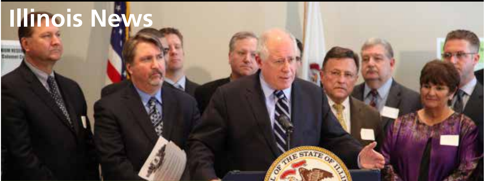
Governor Pat Quinn announcing the Millennium Reserve Steering Committee.