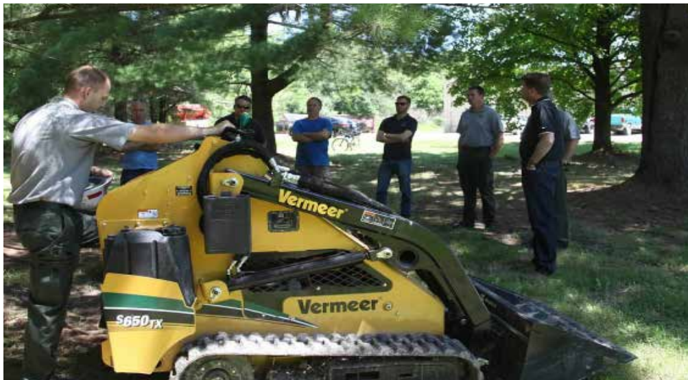
Trails for Illinois, Army Corps, General Dacey Trail, and the Illinois Department of Natural Resources meet to prepare for collaborative trail building this summer.

Convene quad state organizations, local governments, and state governments to set vision, mission, goals, and outcomes leading to the development of land and water trails, US bike routes, and an enhanced Lake Michigan Circle Route.