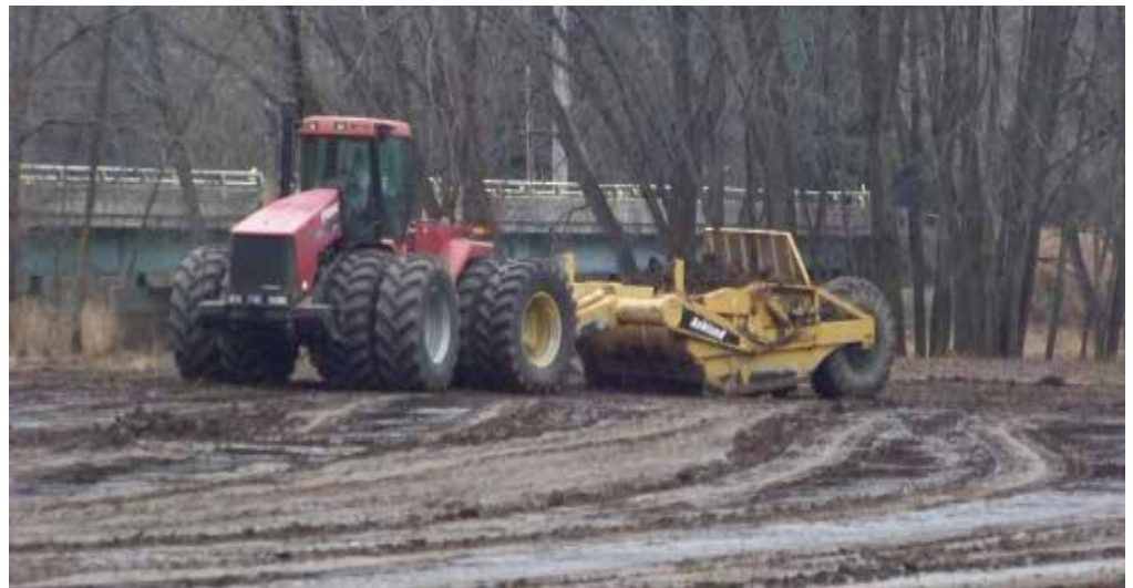
Friends of the Pecatonica River Foundation preparing wetlands at Atten's Landing water trail access site.

During this past spring and summer, Atten's Landing started by building the dirt ramp for the new entrance with the support of Fischer Excavation equipment, and Stephenson Service Company fuel donations. This portion of the project, completed on December 13, awaits gravel that will form the road and the creation of a walking path. Members of the Pecatonica River Foundation did this amazing work with the help and support of: Ducks Unlimited, the National Wild Turkey Federation, Pheasants Forever, and area local governments. Wasting no time, the group is building a dock for another access site and working to provide concrete picnic tables all along the water trail landings.