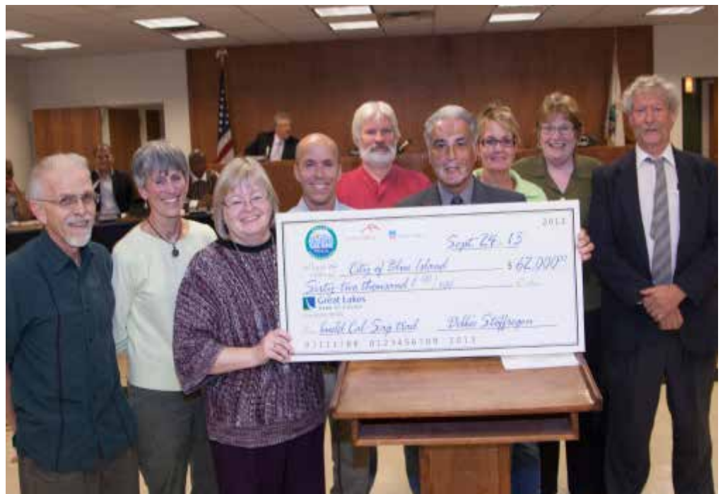
Friends of the Cal-Sag Trail supporting trail development and wayfinding with money raised through their annual fundraiser “Bridges and Blues.”