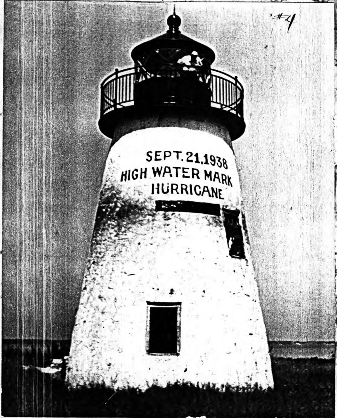
BIRD ISLAND LIGHTHOUSE BUZZARDS BAY MASS. THE BLACK MARK IS SIXTEEN FEET ABOVE THE TOWER FOUNDATION AS PER LETTER 2-11-79 FROM DEPARTMENT OF COMMERCE LIGHT HOUSE SERVICE.