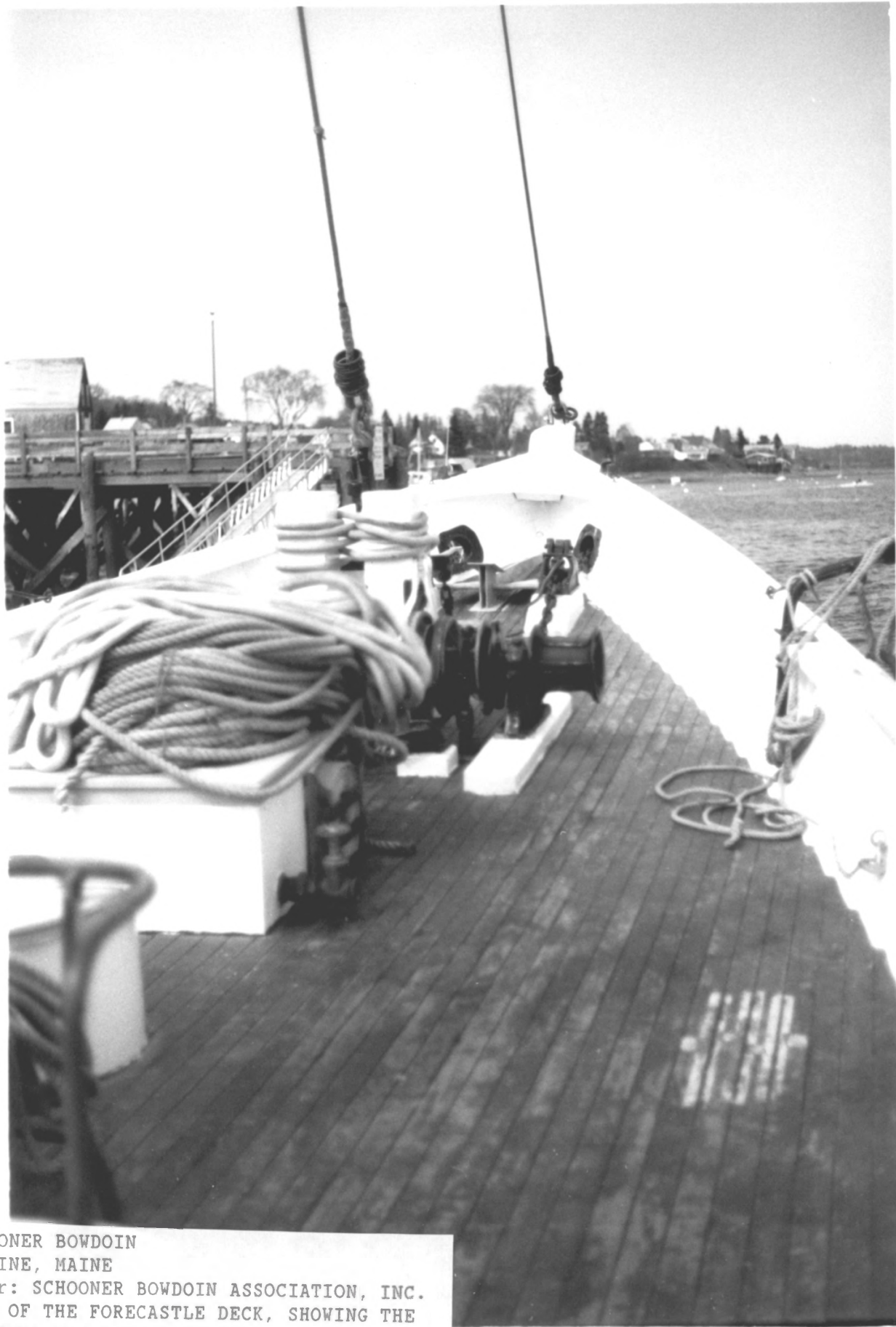
SCHOONER BOWDOIN CASTINE, MAINE Owner: SCHOONER BOWDOIN ASSOCIATION, INC. VIEW OF THE FORECASTLE DECK, SHOWING THE ORIGINAL WINDLASS. Photo #6 by JAMES P. DELGADO, 1989 Courtesy of: NATIONAL PARK SERVICE