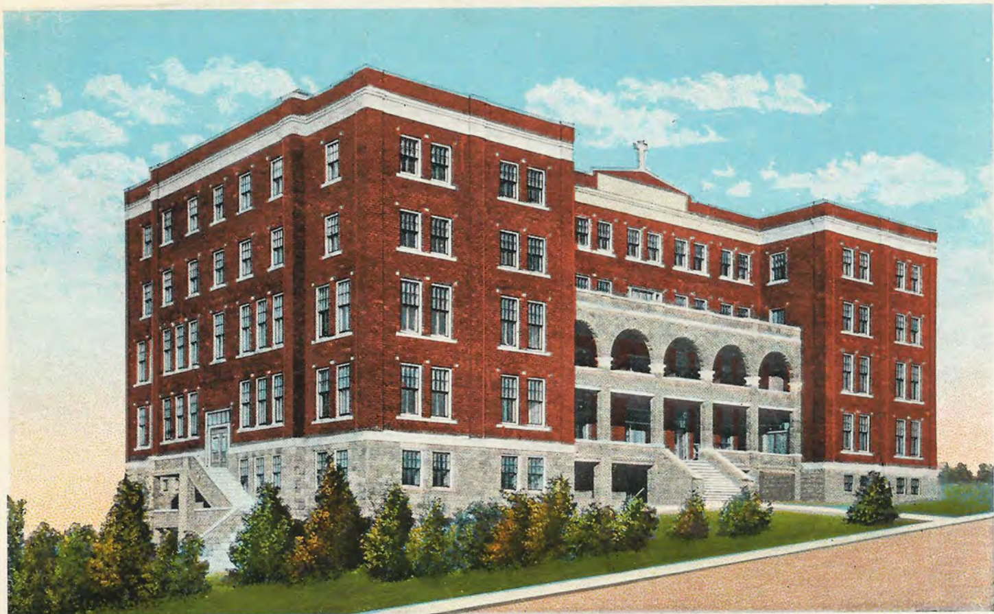
HOLY FAMILY ORPHANAGE, MARQUETTE, MICH.