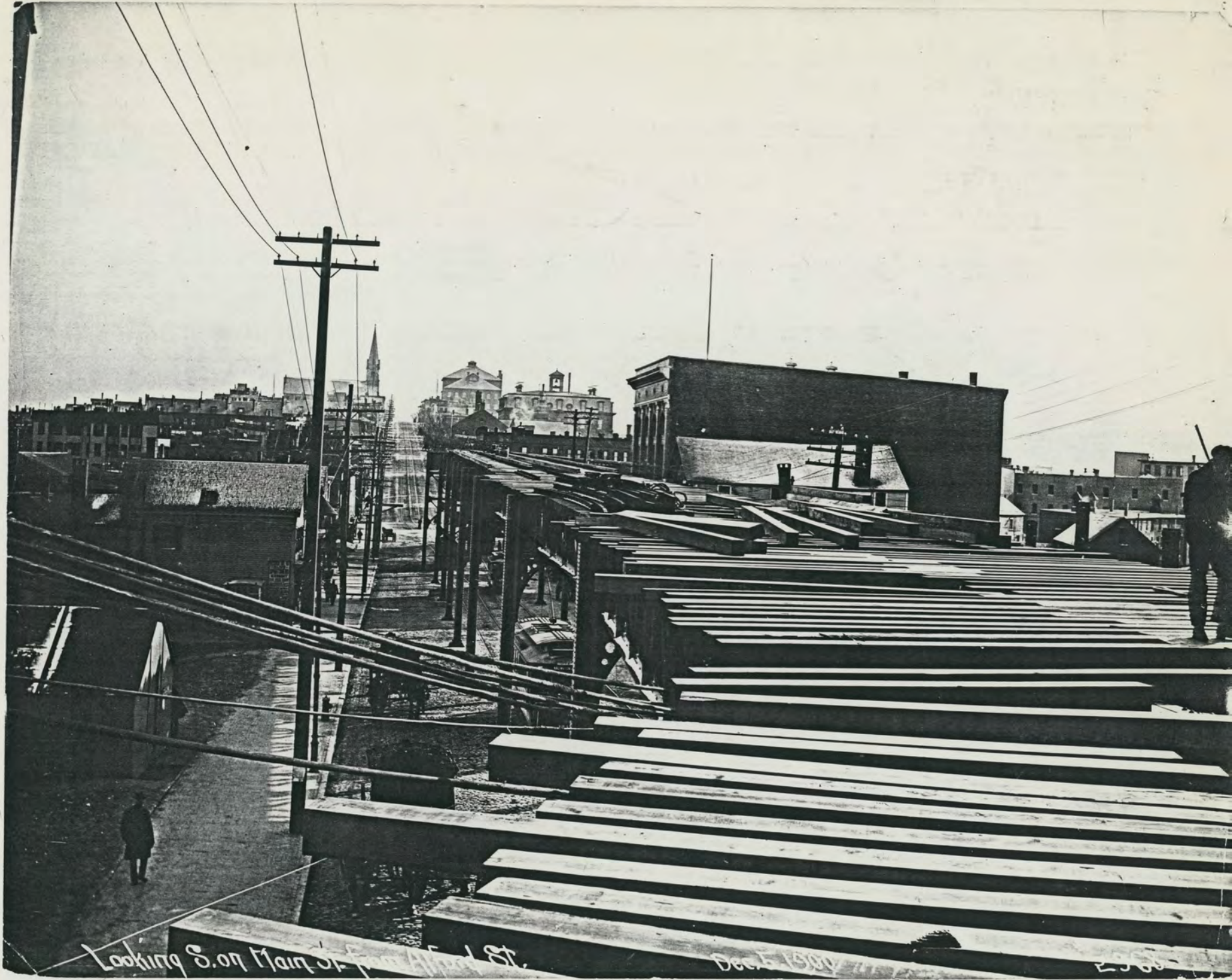
Looking S. on Main St. from Alfred St. Dec. 5 1900 2360 Bunker Hill School, Charlestown, MA View South on Main St.. Dec. 6, 1900