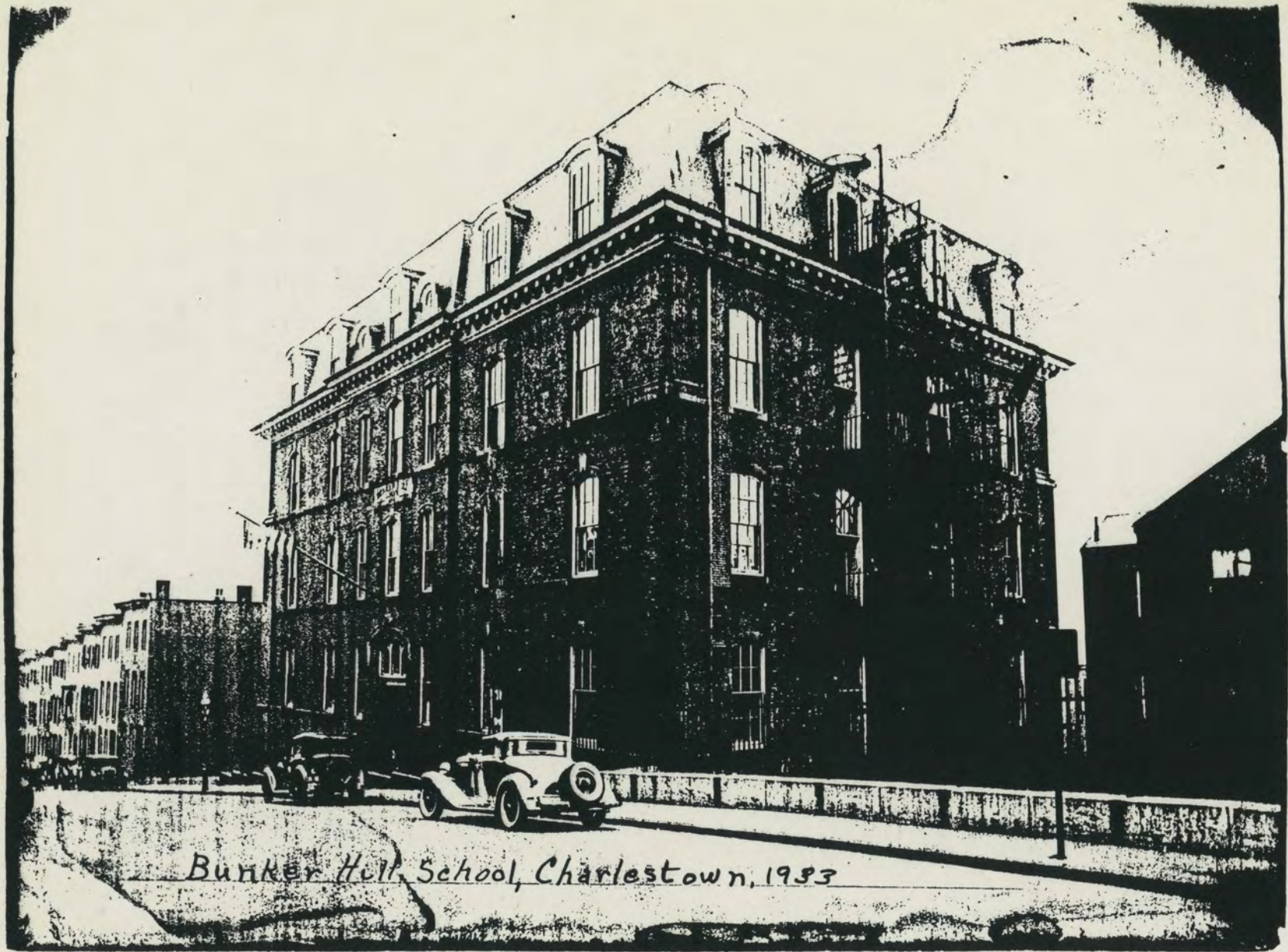
Bunker Hill School, Charlestown ,MA 1933