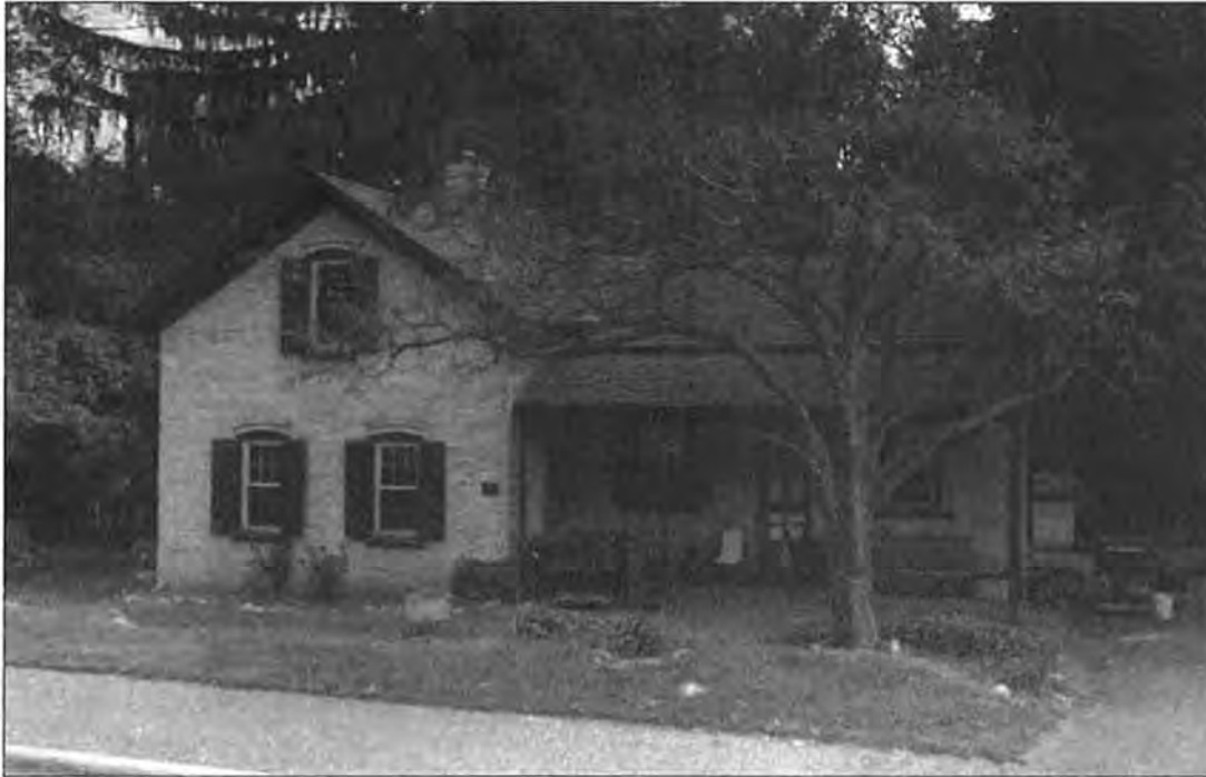
Figure 3. Carver Cottage prototype, Carver, Minnesota