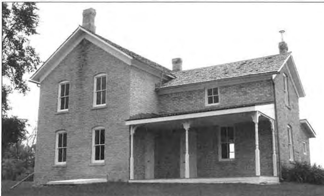
Figure 4. Wendelin Grimm farmhouse, Laketown Township, Minnesota