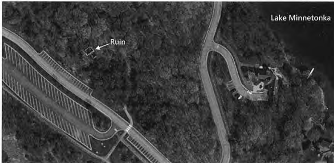
Figure 1. Current aerial view of Schmid Farmhouse Ruin