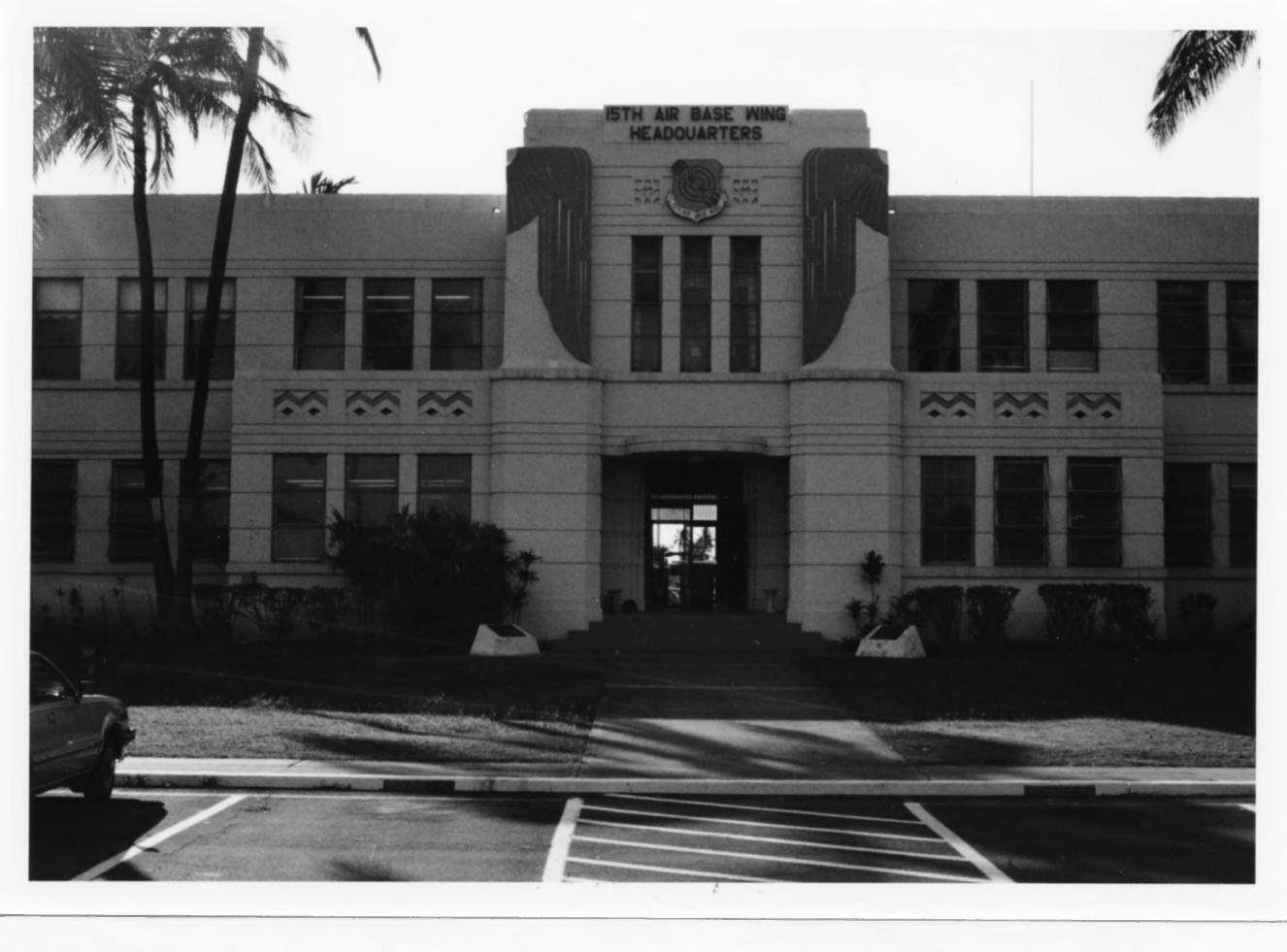
7. In 1941, this handsome structure was the headquarters for Hickam Field.