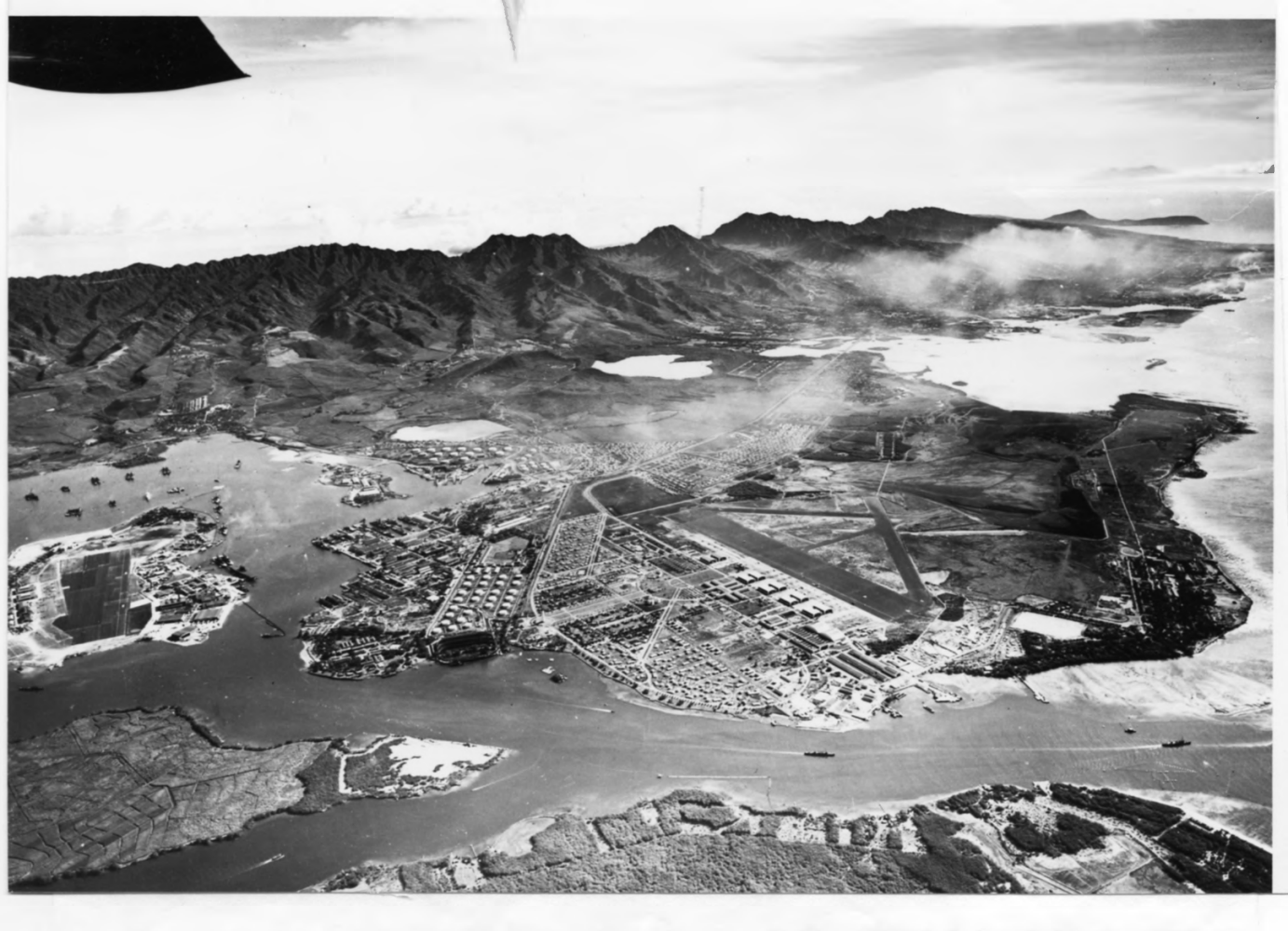
1. Hickam Field and Pearl Harbor, Hawaii, ca. 1941. Ford Island is on extreme left. Hickam's row of double hangars and runways are right center.