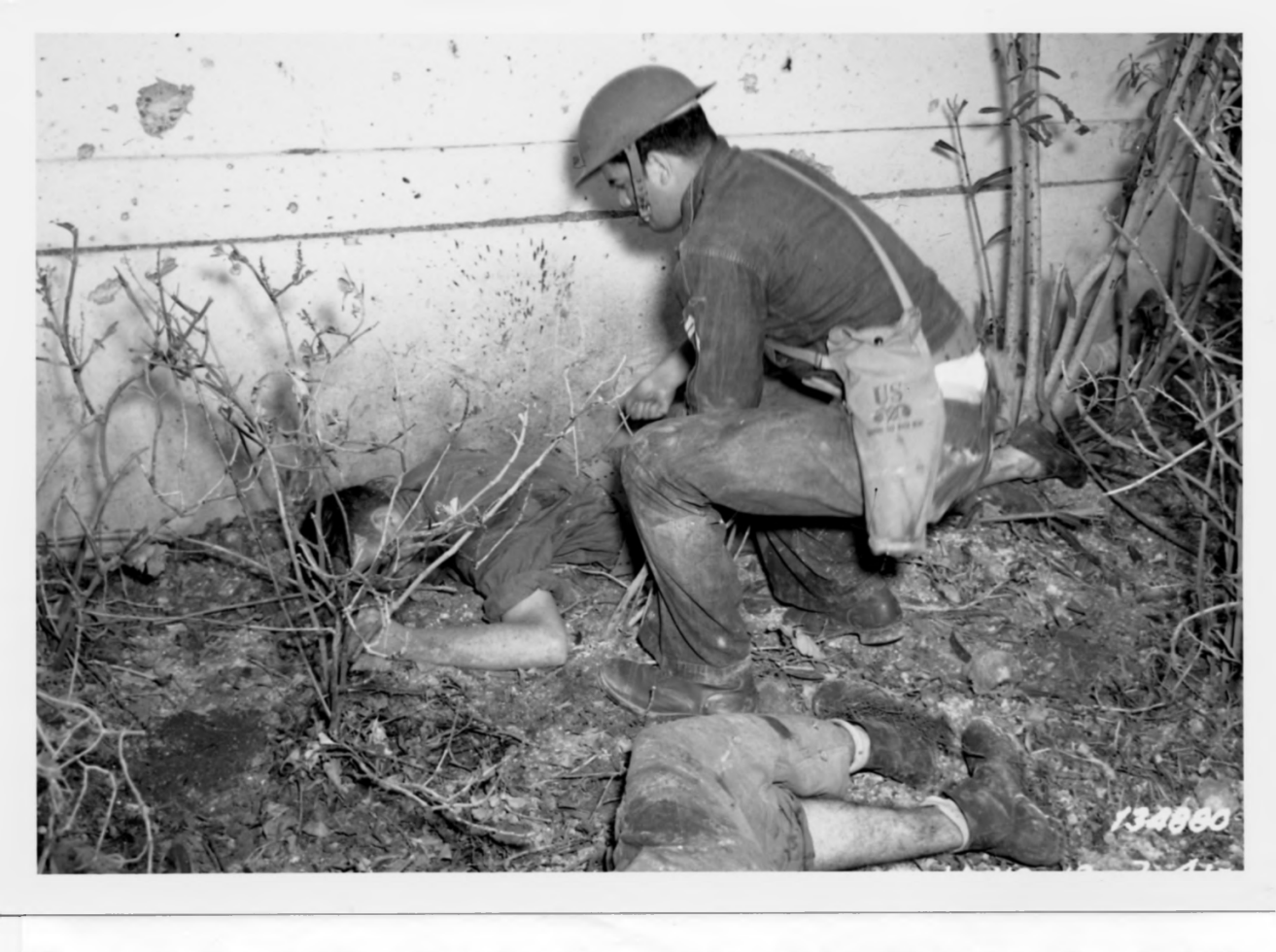
5. Casualties at the enlisted men's barracks, Hickam Field, December 7, 1941.