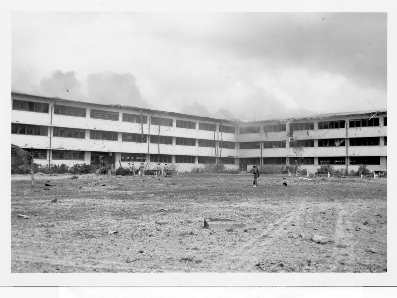
4. Enlisted men's barracks, Hickam Field, December 7, 1941.