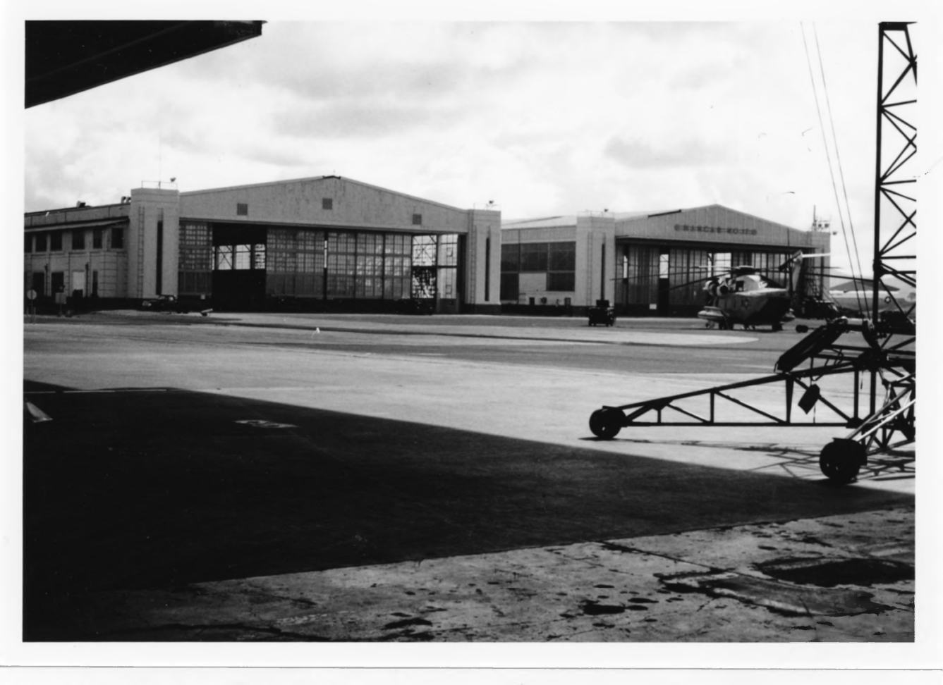
3. Hickam Field's hangars today.