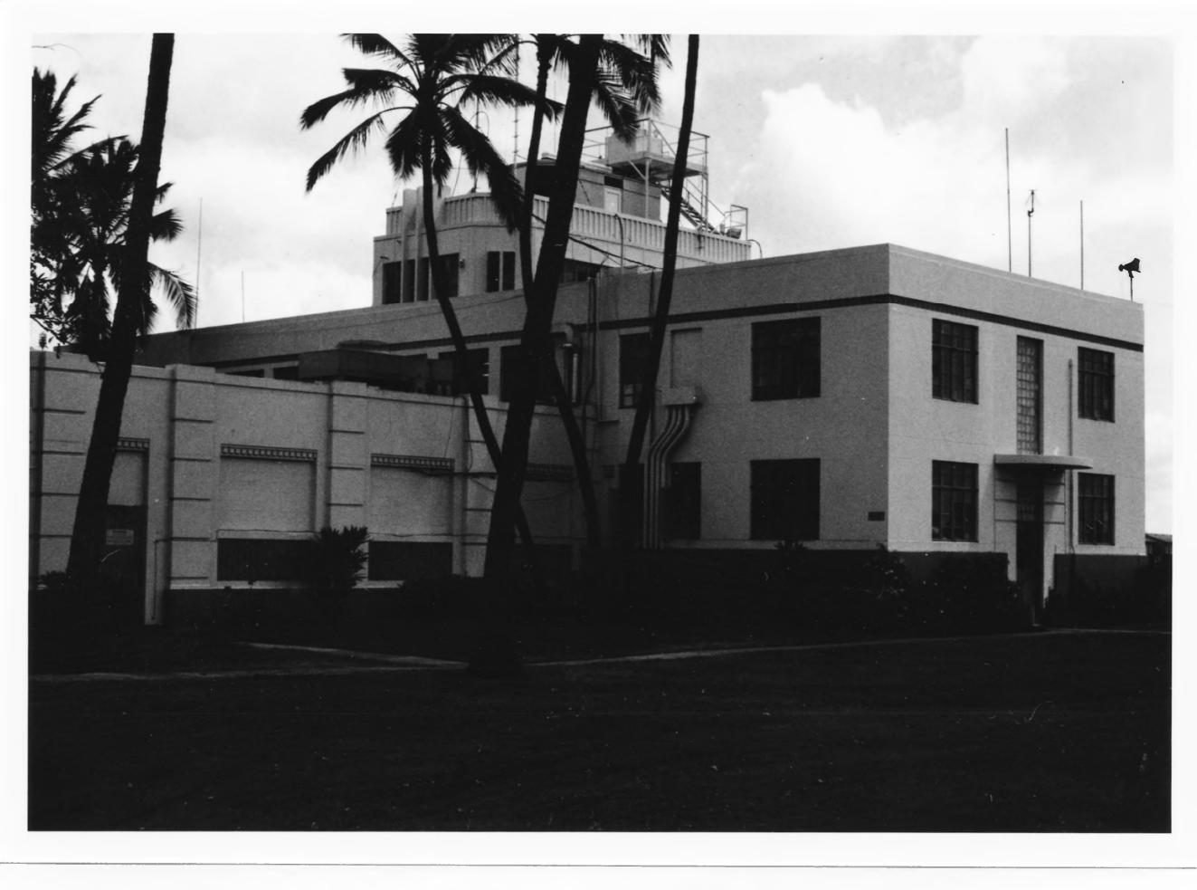
8. The 1941 air operations building at Hickam Field.