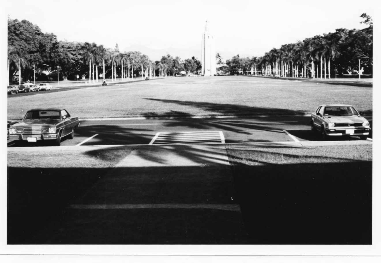
9. Hickam Field's water tower, a local landmark. Following the Japanese attack, the tower was covered with camoflage paint.