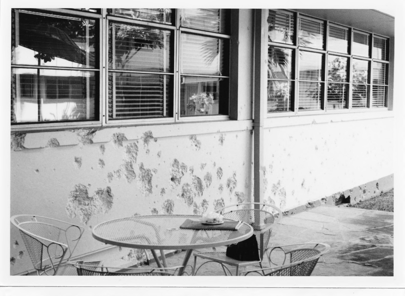
6. Bullet holes still pockmark the barracks' walls. The structure now is an administrative building.