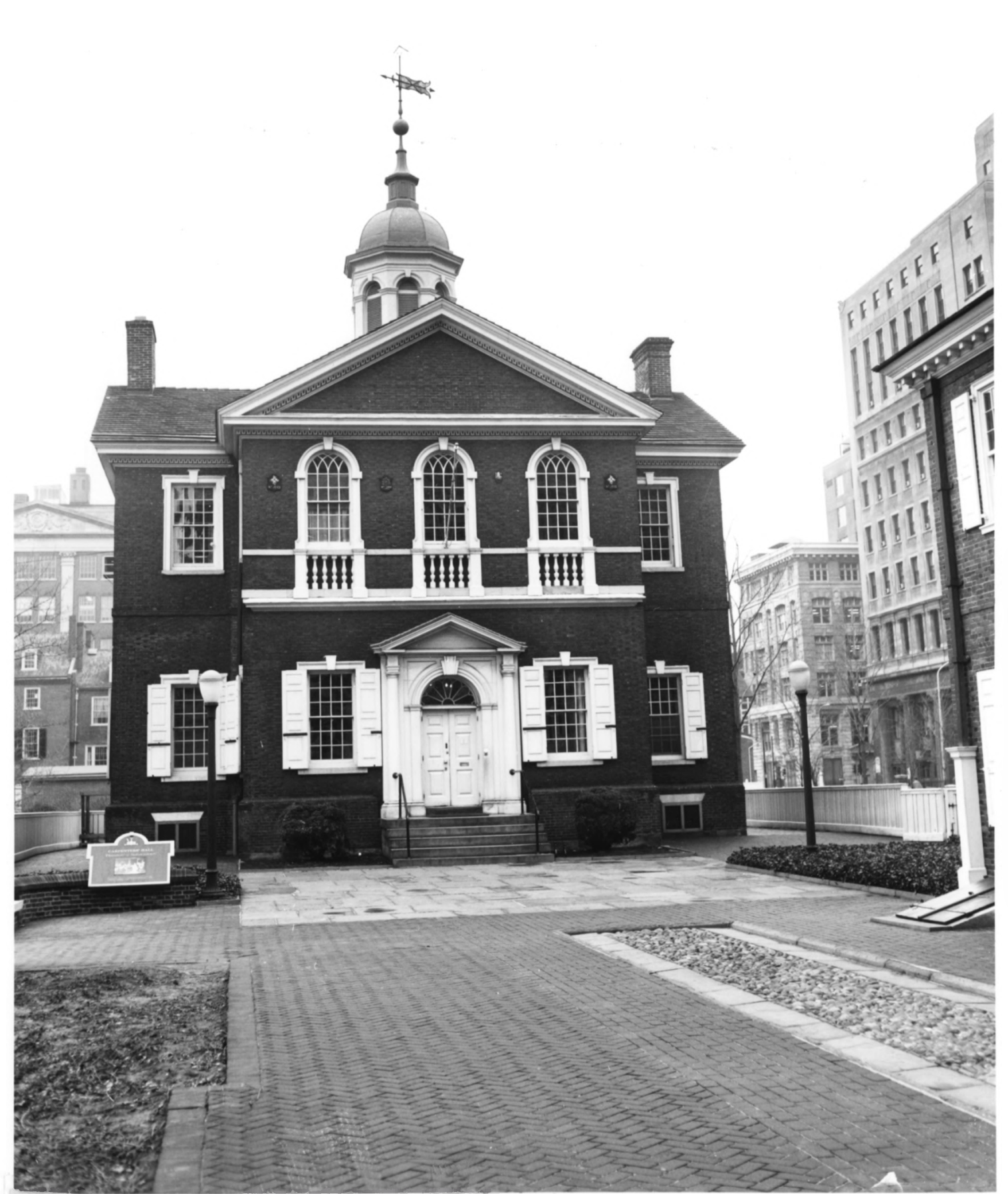
Carpenters Hall, Philadelphia, Pennsylvania