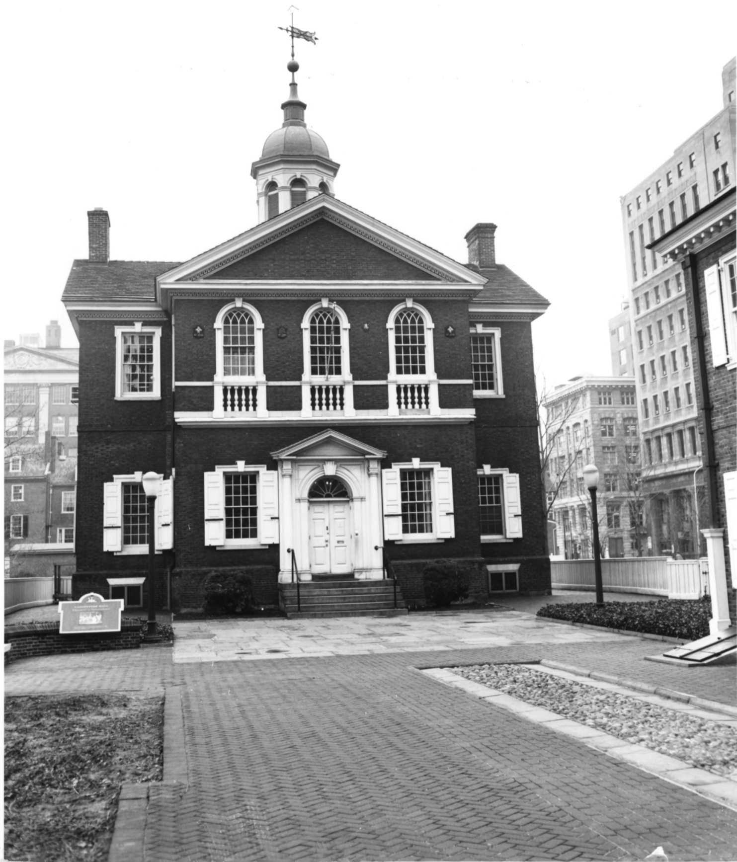
Carpenters Hall, Philadelphia, Pennsylvania