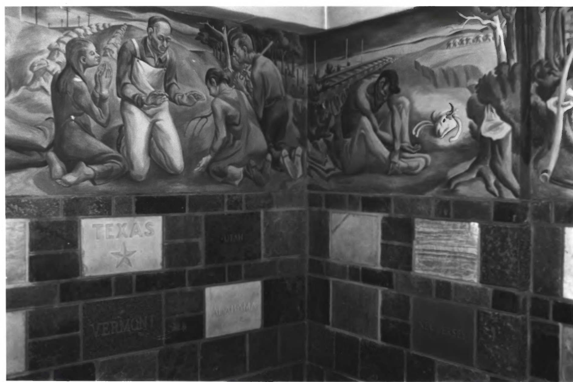
Willmar Auditorium Willmar, Kandiyohi County, MN