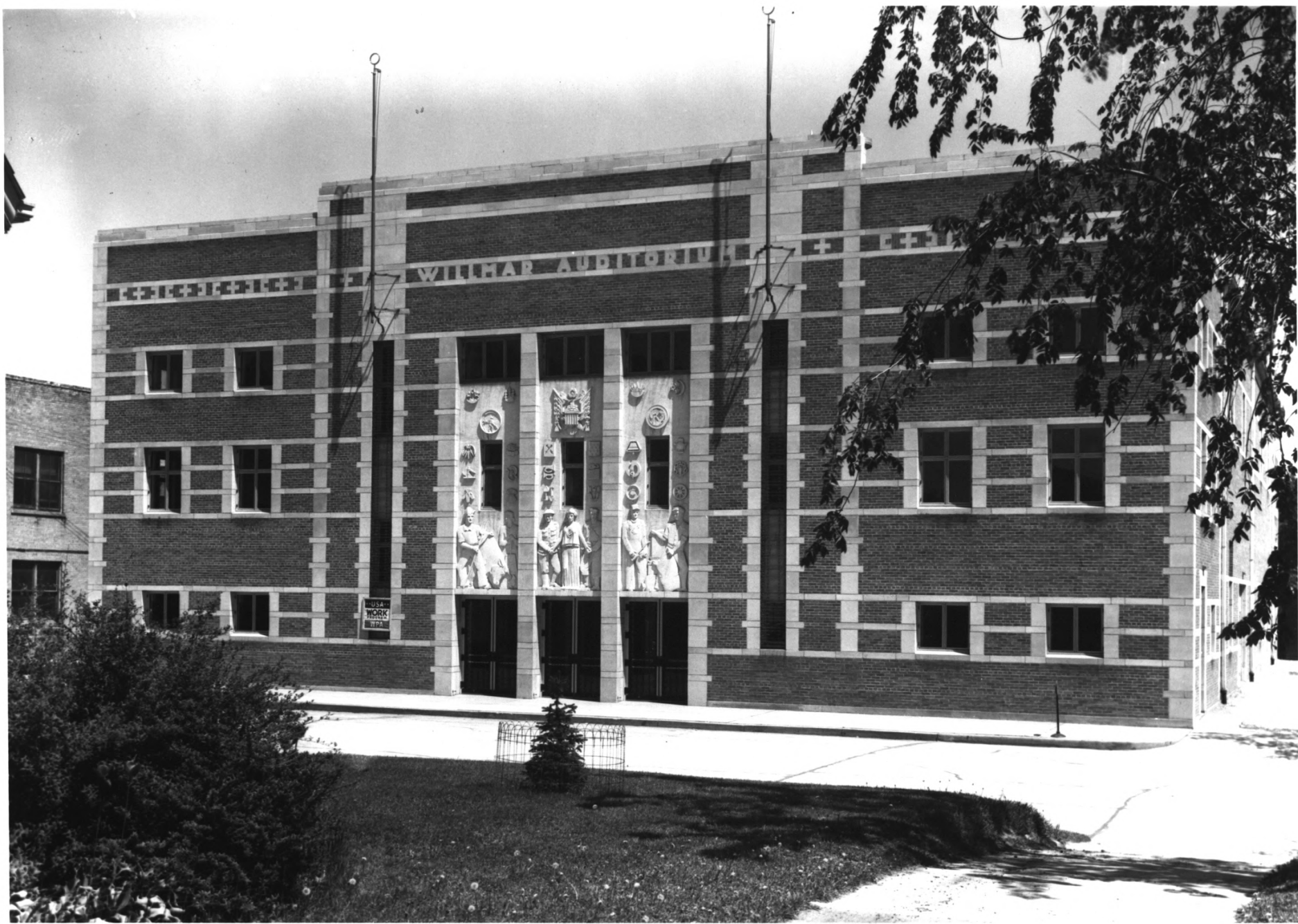
Willmar Auditorium (1937 view) Willmar, Kandiyohi County, MN 5517-A