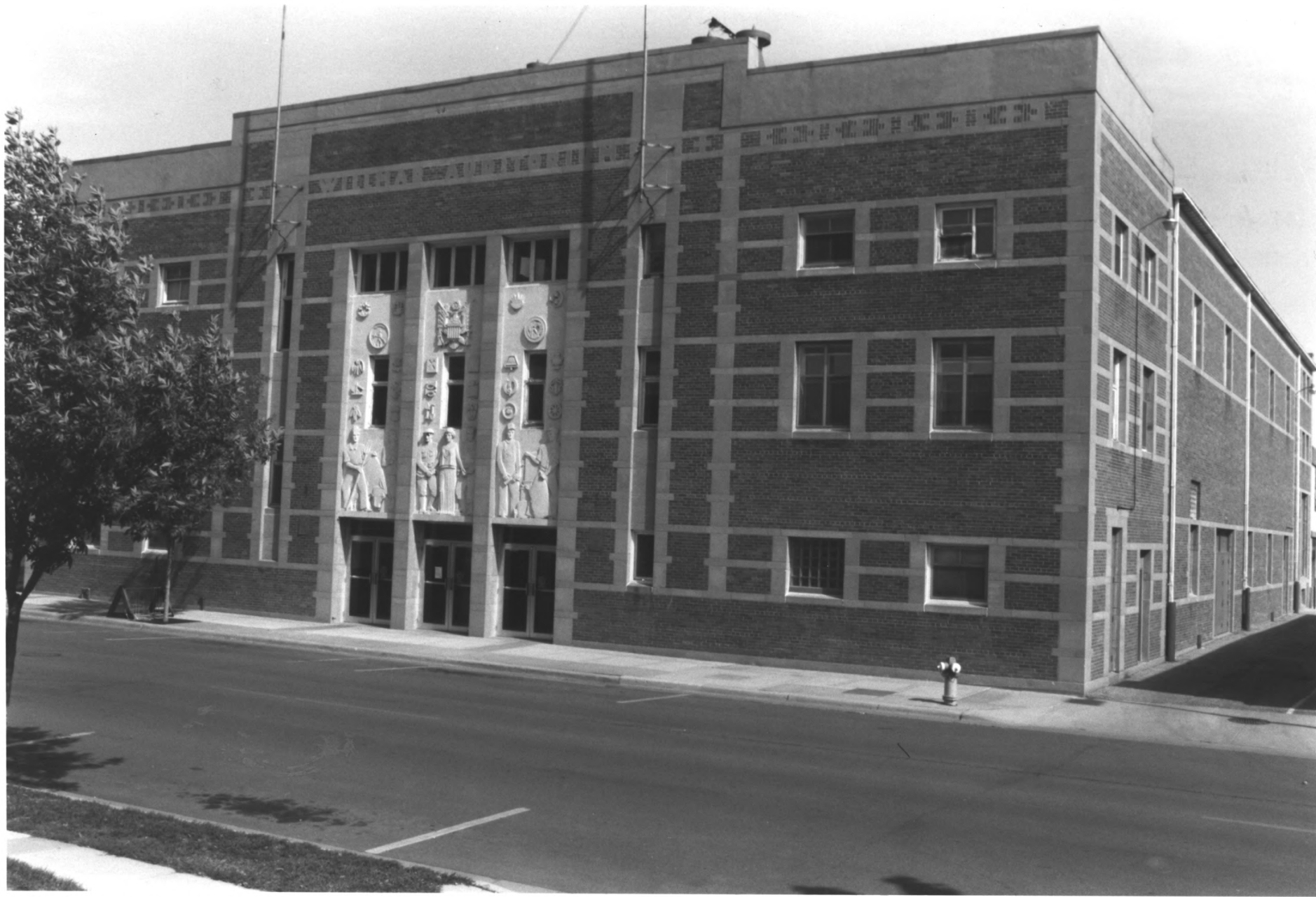
Willmar Auditorium Willmar, Kandiyohi County, MN 010659 - 1A