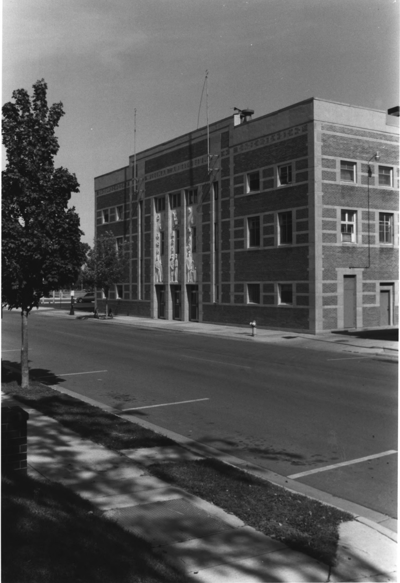
Willmor Auditorium Willmor, Kandiyohi County, MN 010663-23