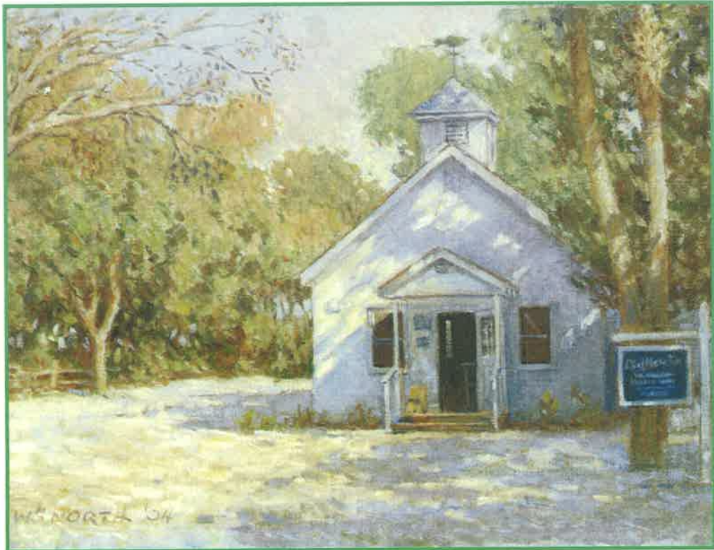
"From an original oil painting by William North" Chapel by the Sea, Captiva Island, Florida