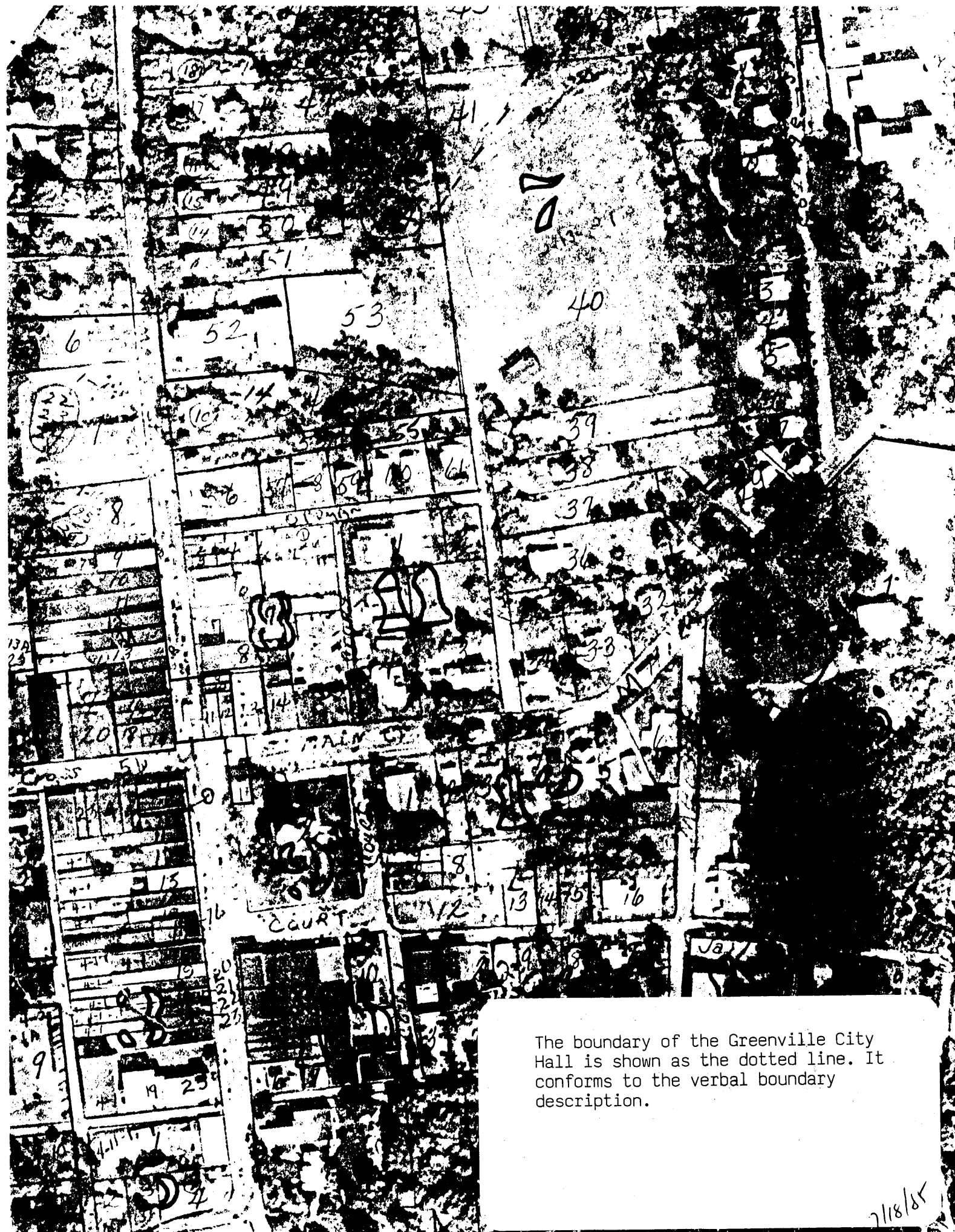
The boundary of the Greenville City Hall is shown as the dotted line. It conforms to the verbal boundary description.