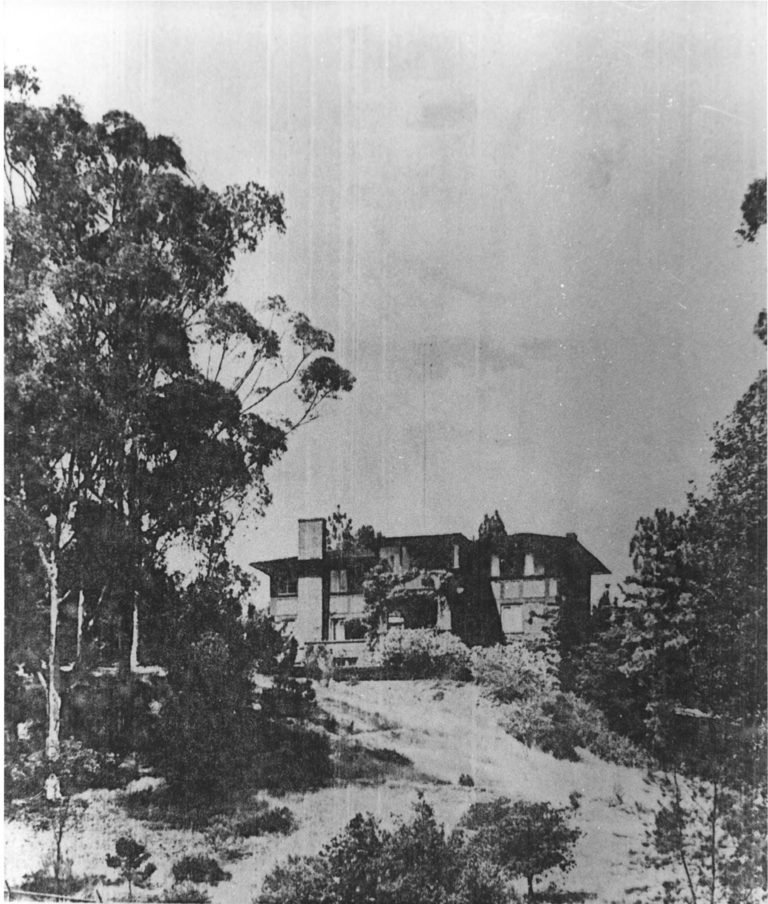
Burnham residence, San Diego, 1906-1907