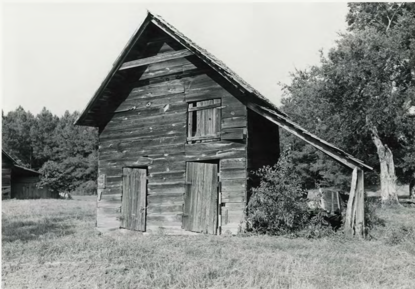
DA-2 Brazeale Homestead, structure #7 Don Brown, photographer May 27, 1982 Negative on file at the AHPP View from the West