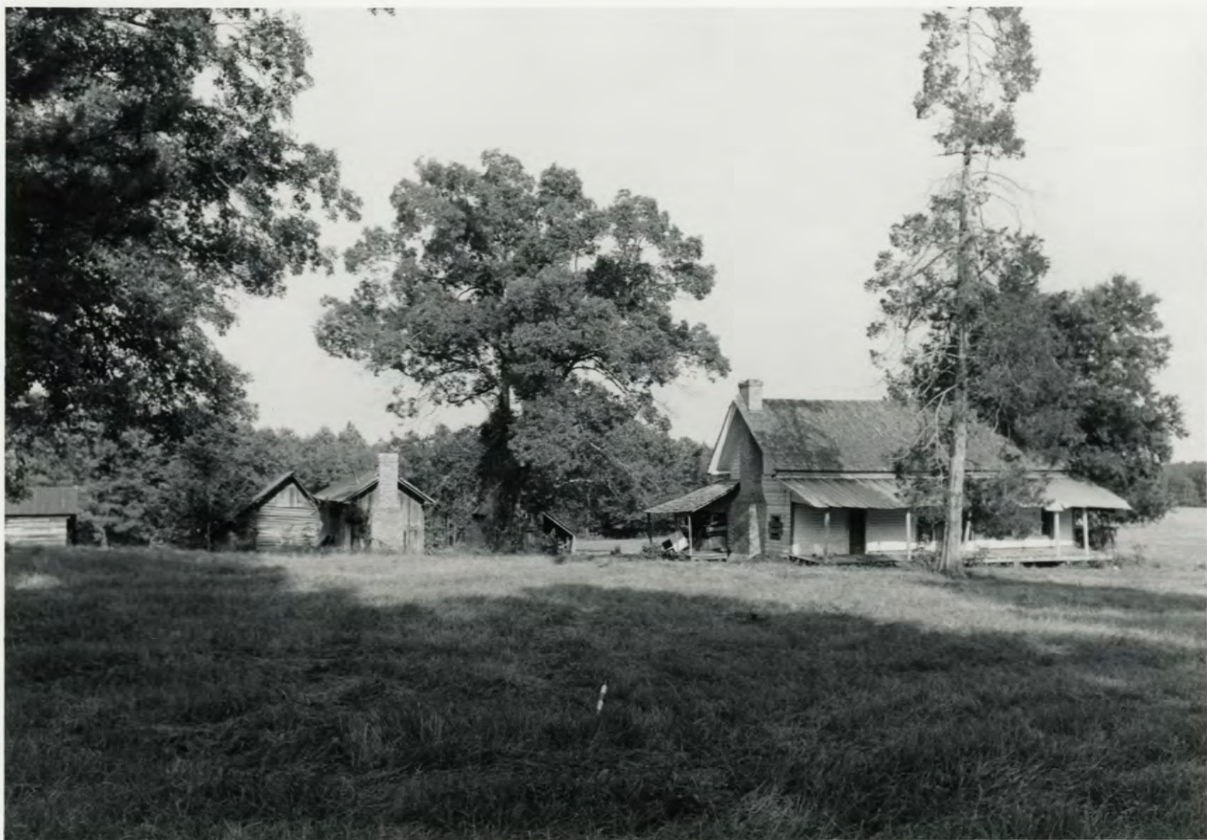
DA-2 Brazeale Homestead May 27, 1982 View from the Northwest