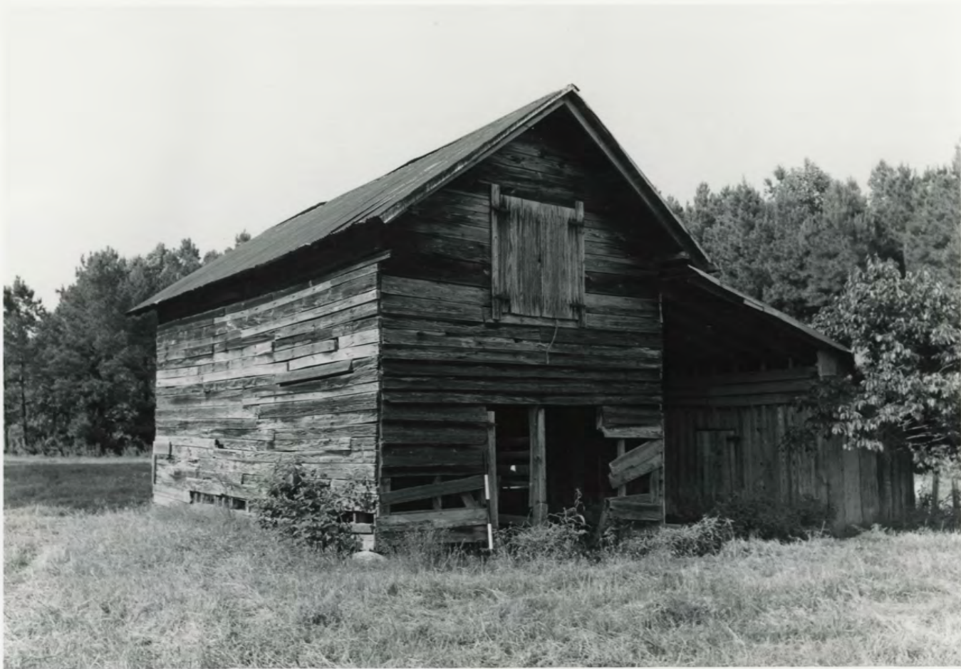
DA-2 Brazeale Homestead, structure #8 Don Brown, photographer May 27, 1982 Negative on file at the AHPP View from the Southwest