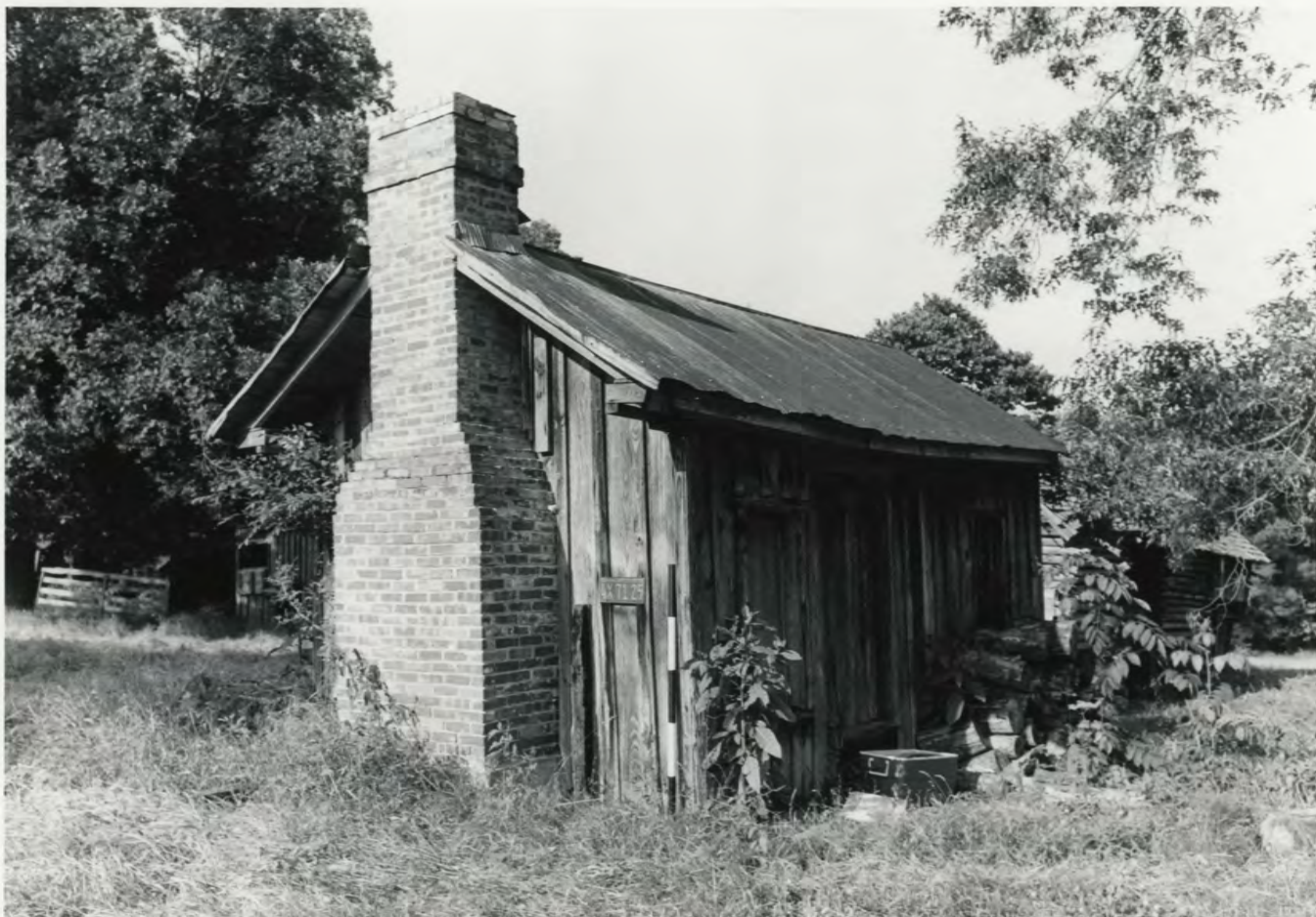
DA-2 Brazeale Homestead structure #3 Don Brown, photographer May 27, 1982 Negative on file at the AHPP View from the Southeast