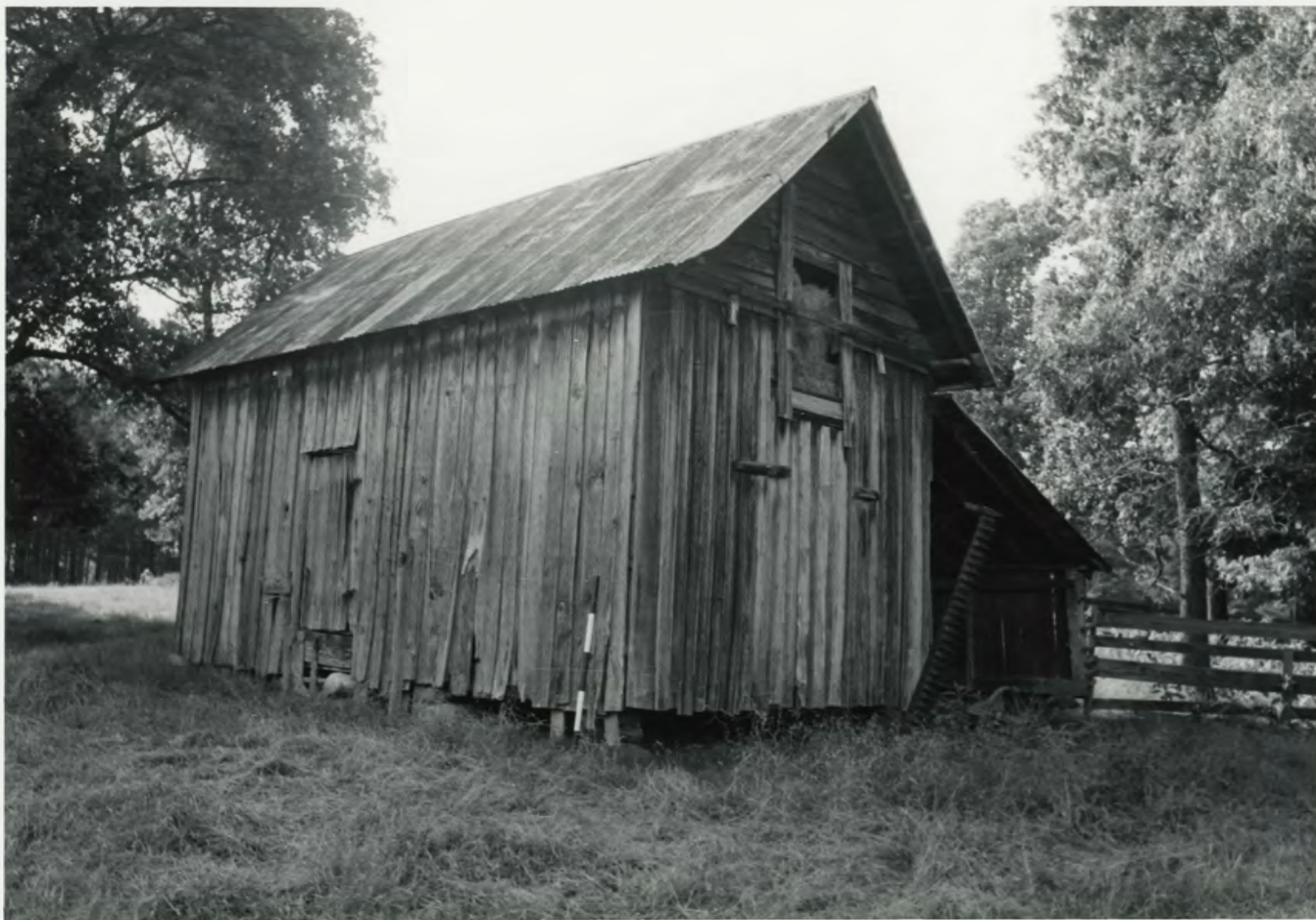
DA-2 Brazeale Homestead, structure #5 Don Brown, photographer May 27, 1982 Negative on file at the AHPP View from the Southwest