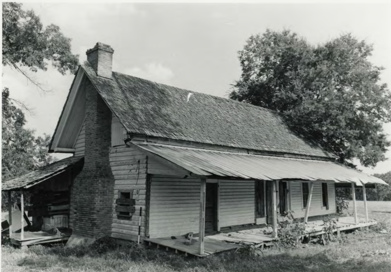
DA-2 Brazeale Homestead May 27, 1982 View from the Northeast