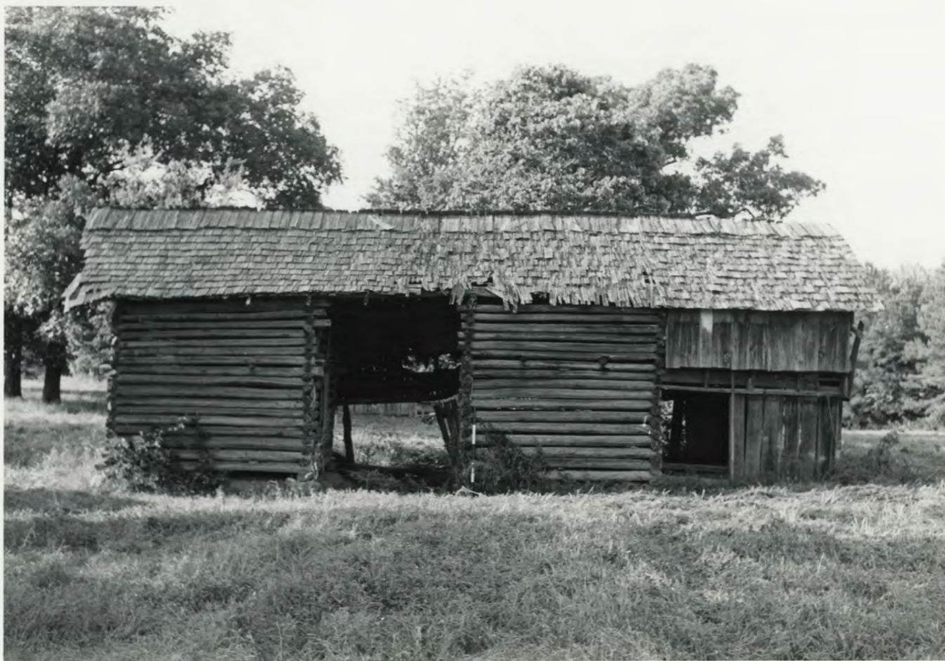
DA-2 Brazeale Homestead structure #4 Don Brown, photographer May 27, 1982 Negative on file at the AHPP View from the South