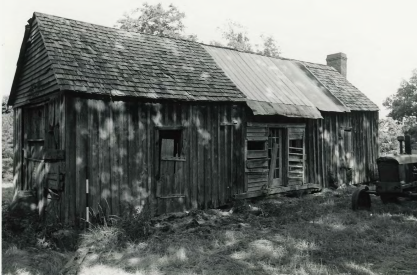
DA-2 Brazeale Homestead, structure #2 Don Brown, photographer May 27, 1982 Negative on file at the AHPP View from the Northeast