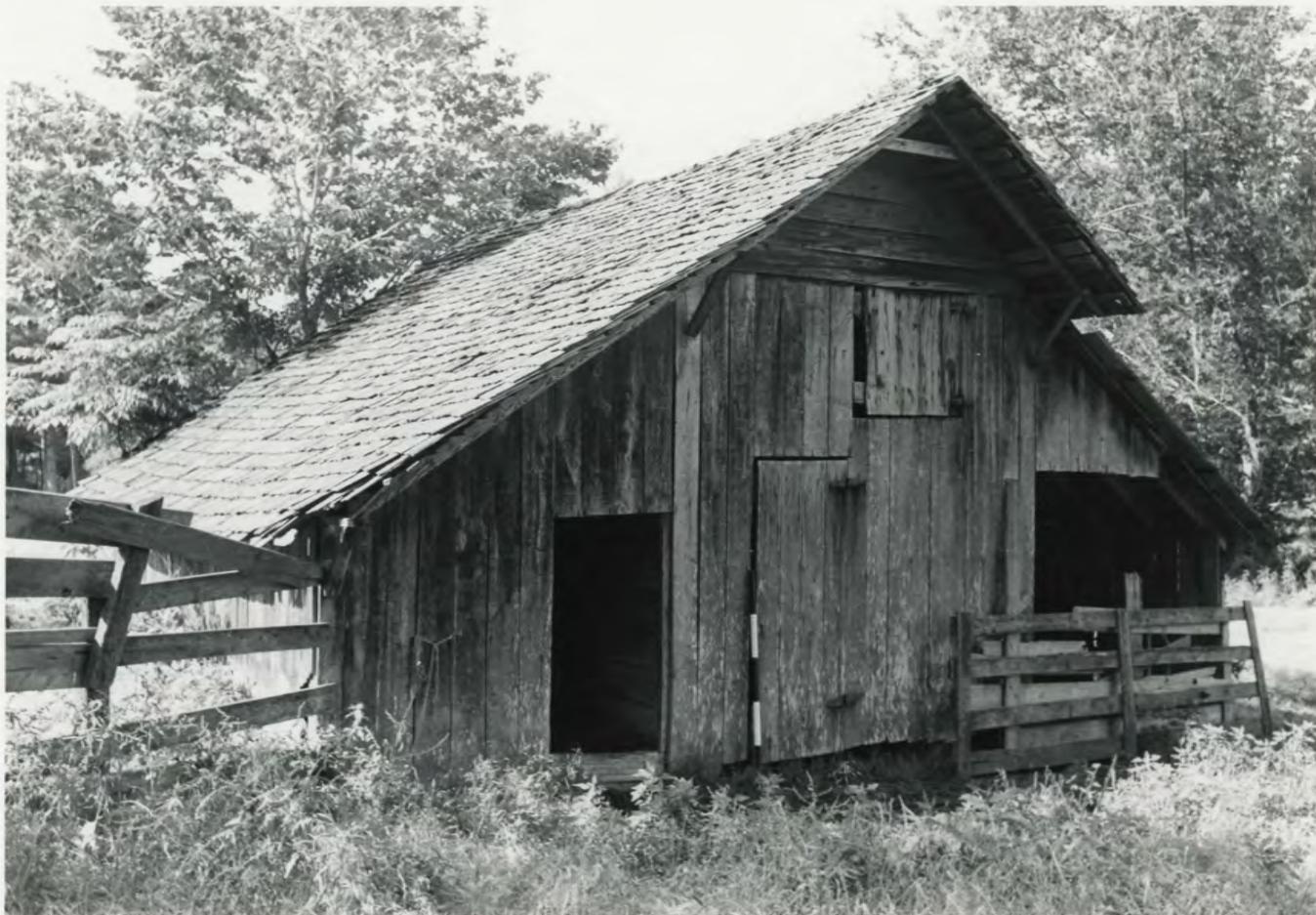
DA-2 Brazeale Homestead, structure #6 Don Brown, photographer May 27, 1982 Negative on file at the AHPP View from the Southwest