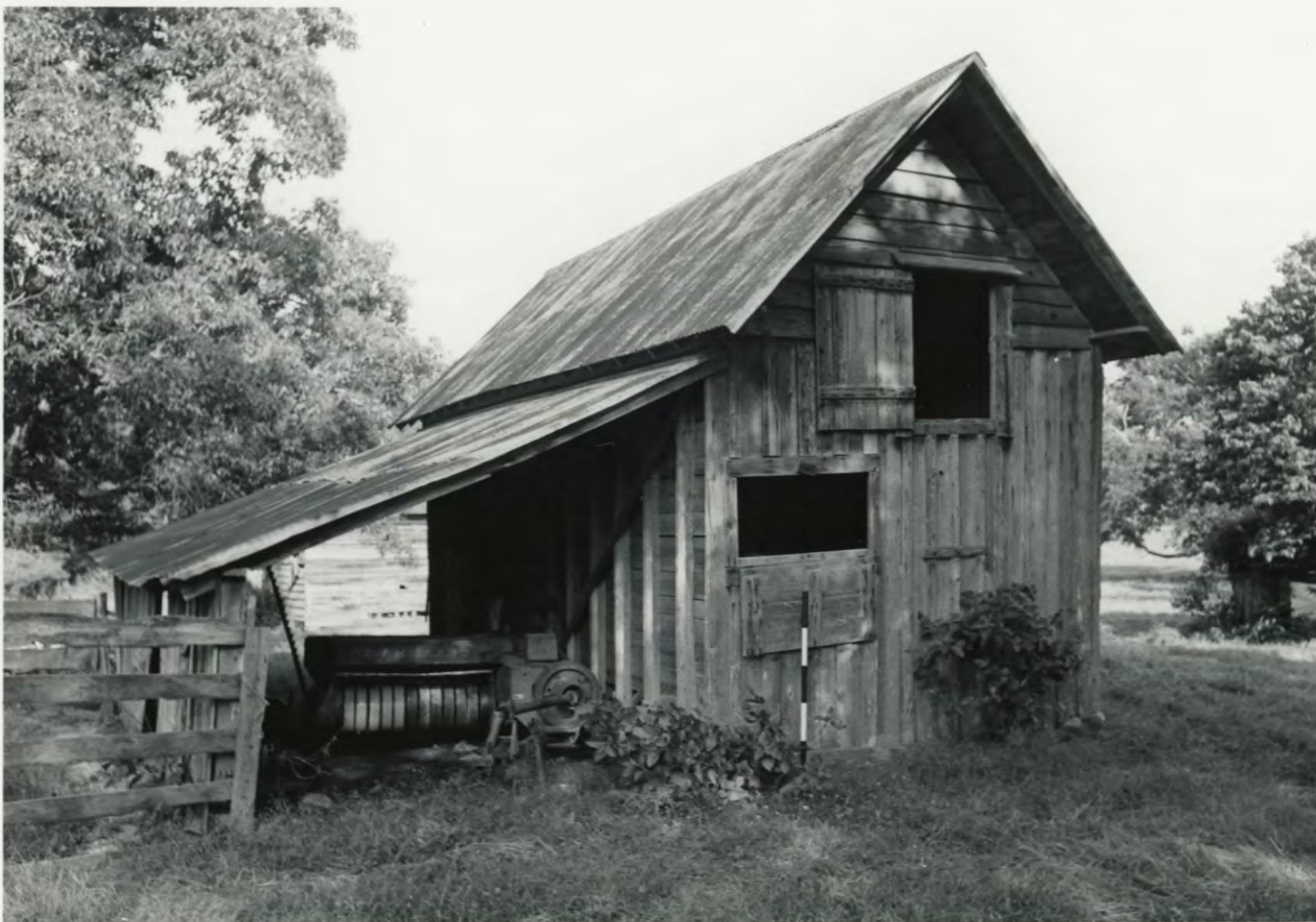
DA-2 Brazeale Homestead, structure #5 May 27, 1982 View from the Northwest