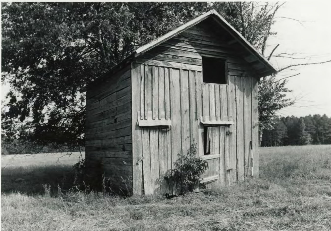
DA-2 Brazeale Homestead, structure #9 Don Brown, photographer May 27, 1982 Negative on file at the AHPP View from the Northwest