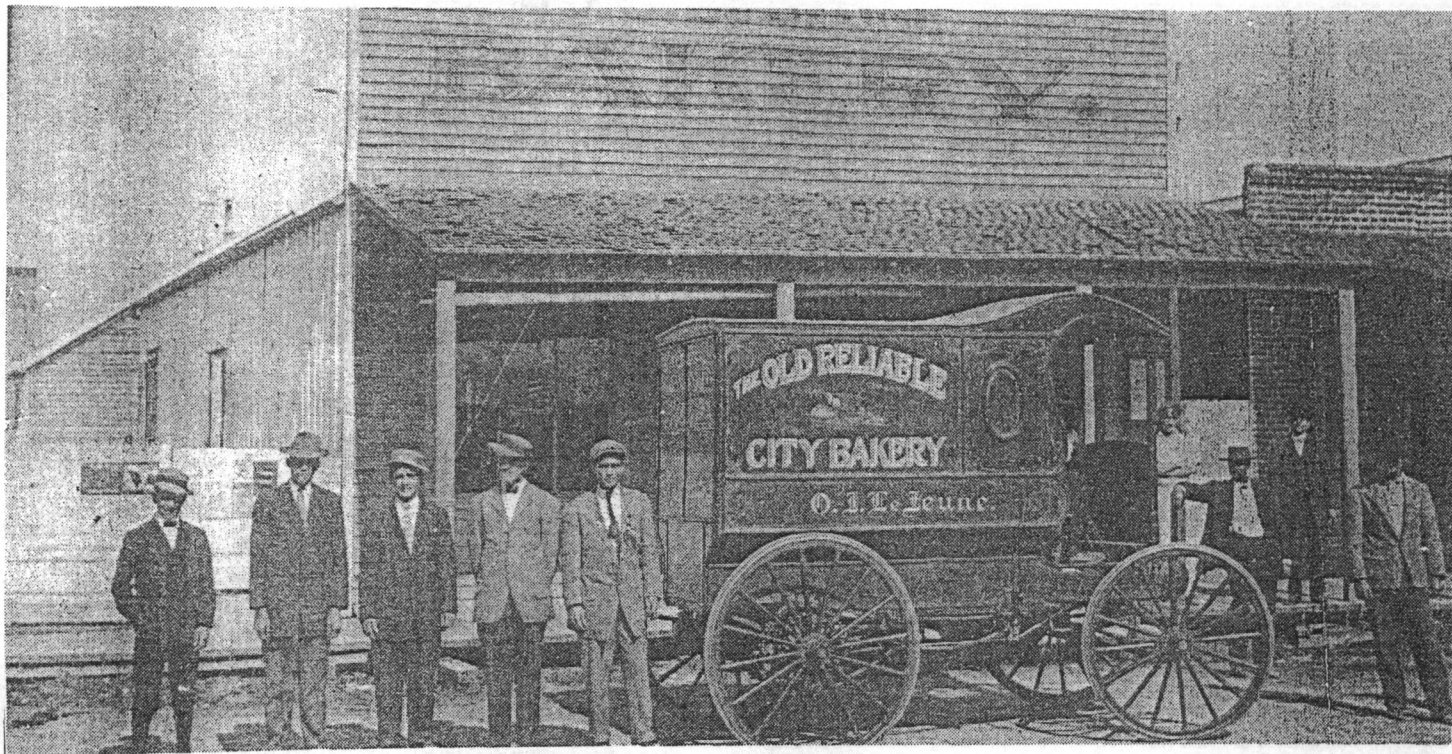
LeJeune's Bakery Iberia Parish, LA