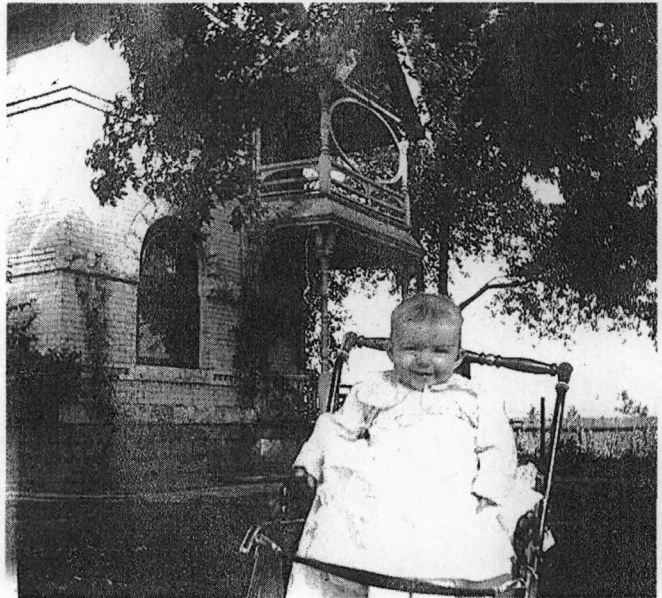
Facade view circa 1914. Note the wood oval in the second-story porch.

Nearly all of the alterations to the house undertaken by the current owner have been to the interior of the house, and are in keeping with the historic context. The current owner has repainted the exterior of the house, repainted and wallpapered the interior, updated the kitchen, the upstairs bathroom and food preparation area, added two guest baths and the dumbwaiter, and added a wooden patio on the south side for dining. Externally, the current owner has enlarged the 1913 kitchen addition for commercial use. The brick foundation and brick and frame exterior blend very well with the original kitchen brick foundation and exterior walls.