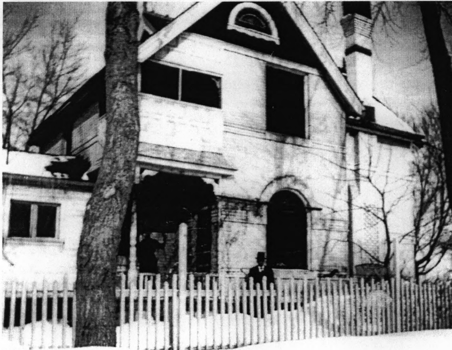
Robinson House, circa 1913. South and west (rear) elevations.

On the south side of the house, the dining room and overlying bedroom project out from the house approximately three feet, while fitting into the side gable. The stone foundation