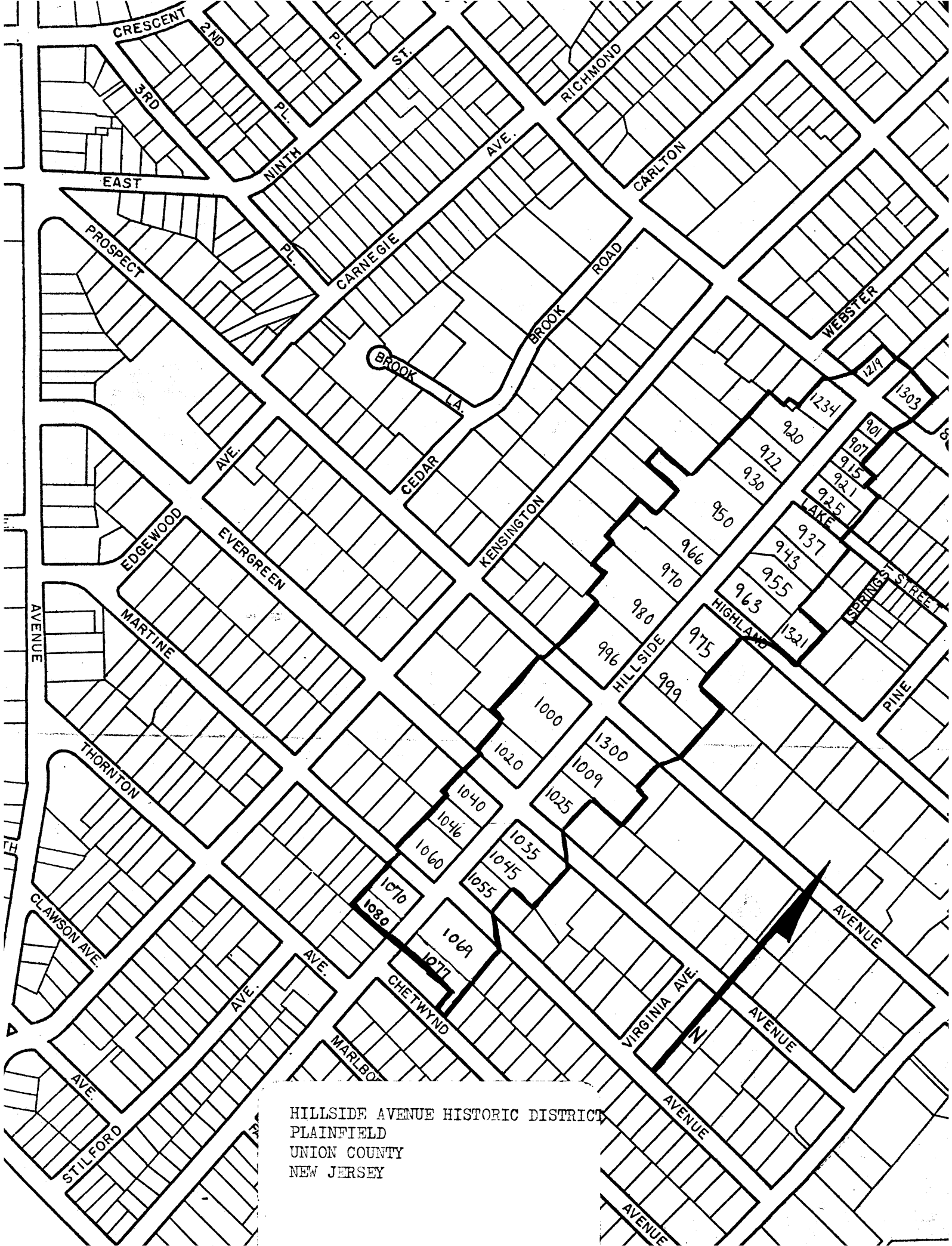
HILLSIDE AVENUE HISTORIC DISTRICT PLAINFIELD UNION COUNTY NEW JERSEY